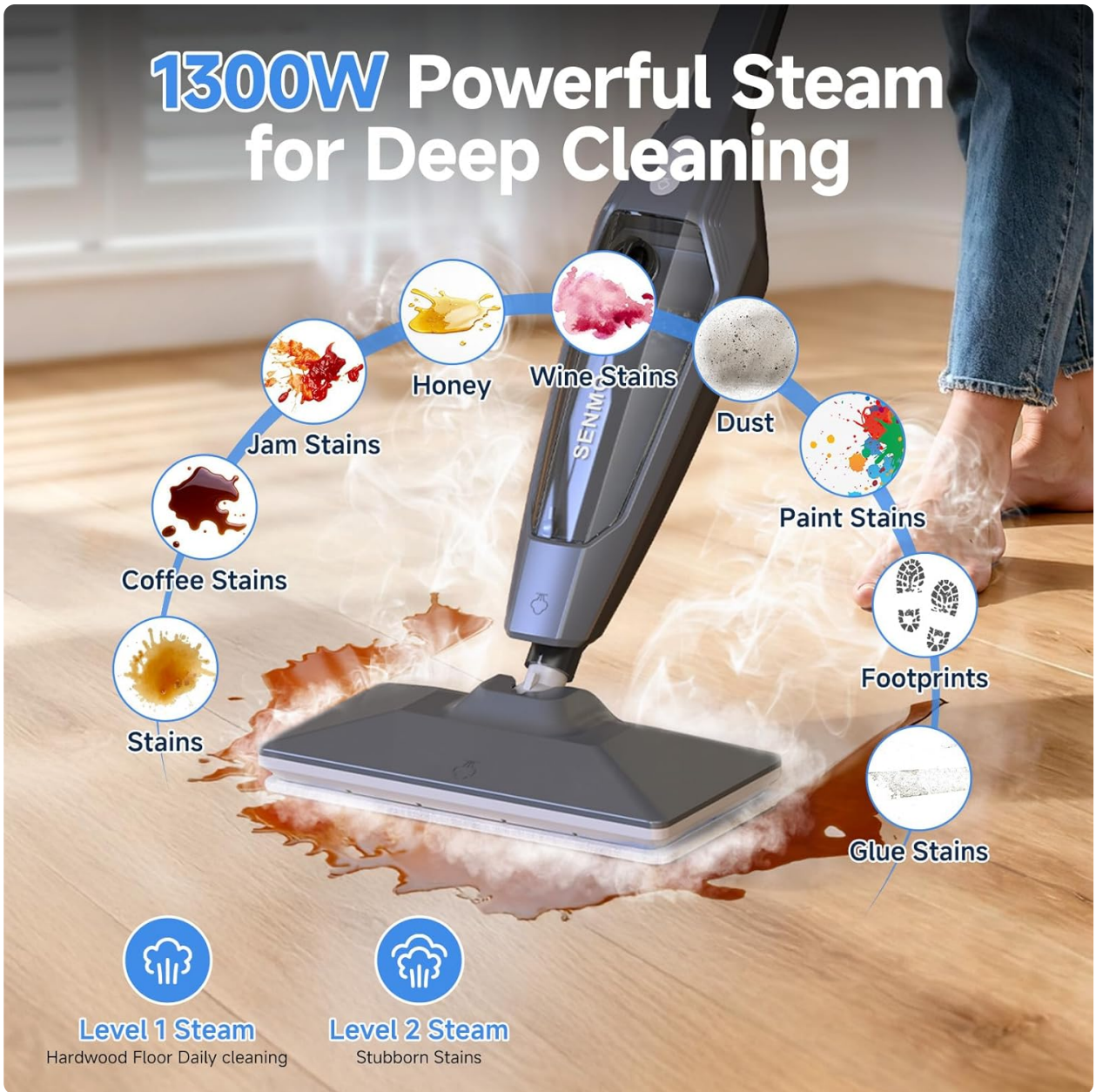
Image: Steam mop effectively cleaning various stains with dual steam modes.