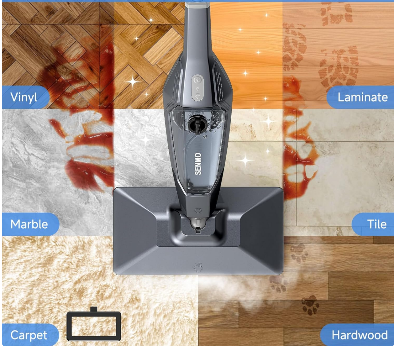
Image: The steam mop is effective on all types of floors.

Your browser does not support the video tag.