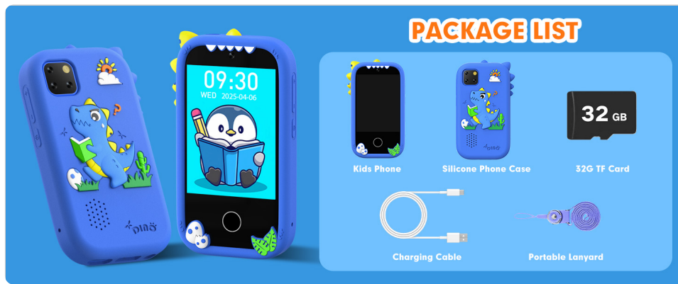
Image: Illustration of the Mgaolo Kids Smart Phone W5 package contents, including the phone, silicone case, 32GB TF card, charging cable, and lanyard.