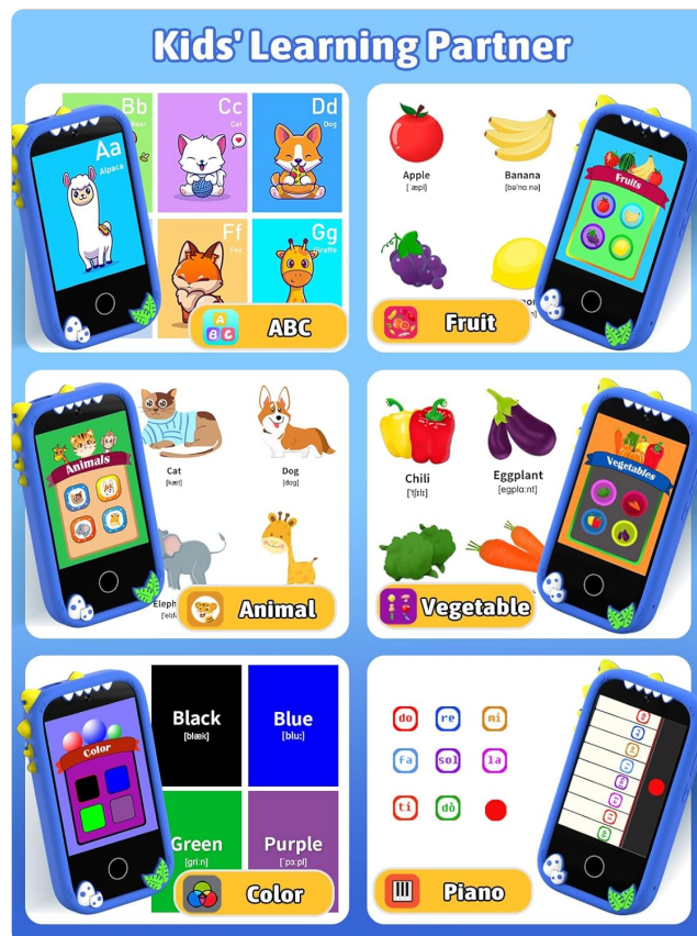
Image: Screenshots of the phone's learning applications, including ABCs, fruits, animals, vegetables, colors, and a piano interface.