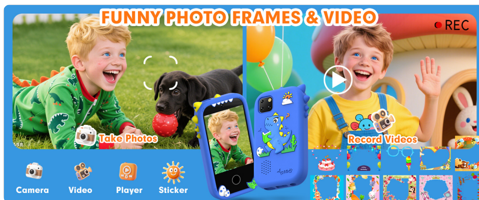
Image: The phone's camera interface demonstrating photo and video recording capabilities, along with various decorative photo frames.