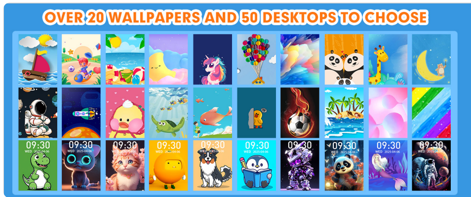
Image: A selection of over 20 wallpapers and 50 desktop themes available for customization on the phone.