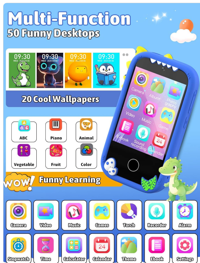
Image: The phone's interface displaying multiple application icons and customizable desktop wallpapers.