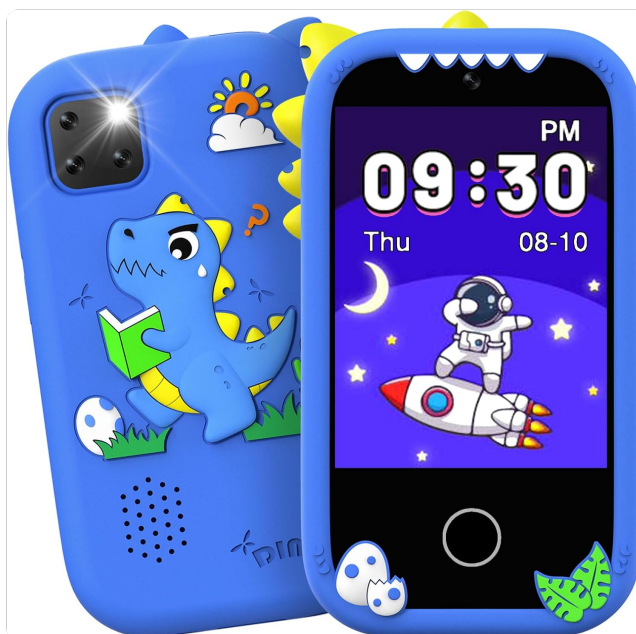
Image: Front and back view of the Mgaolo Kids Smart Phone W5, showcasing its design and the silicone protective case.

This instruction manual provides detailed guidance for the safe and effective use of your Mgaolo Kids Smart Phone W5. Please read this manual thoroughly before operating the device and retain it for future reference. This device is designed to offer a blend of educational content and entertainment for children.