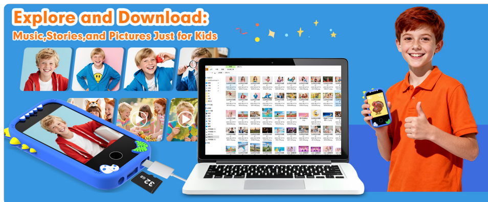
Image: The Mgaolo Kids Smart Phone W5 connected to a laptop, illustrating the process of transferring music, stories, and pictures.