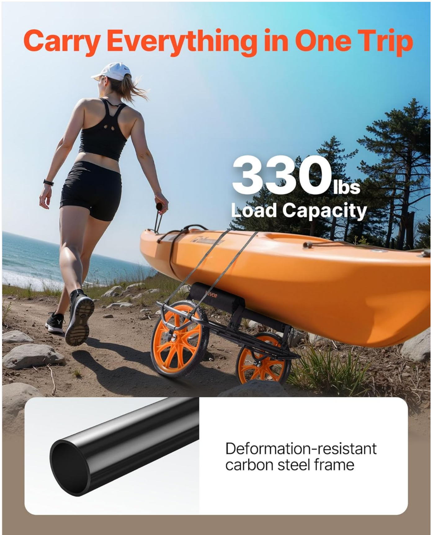
Figure 5.1: Transporting a kayak using the VEVOR Kayak Cart.