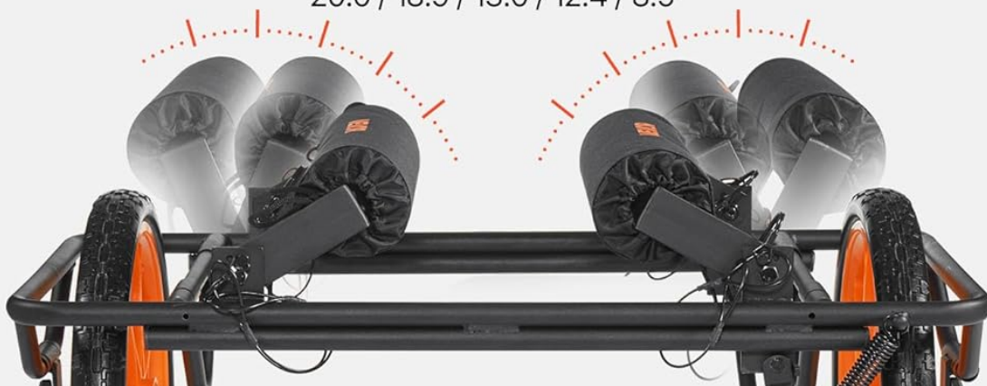
Figure 5.3: The adjustable support bracket accommodates different watercraft widths.