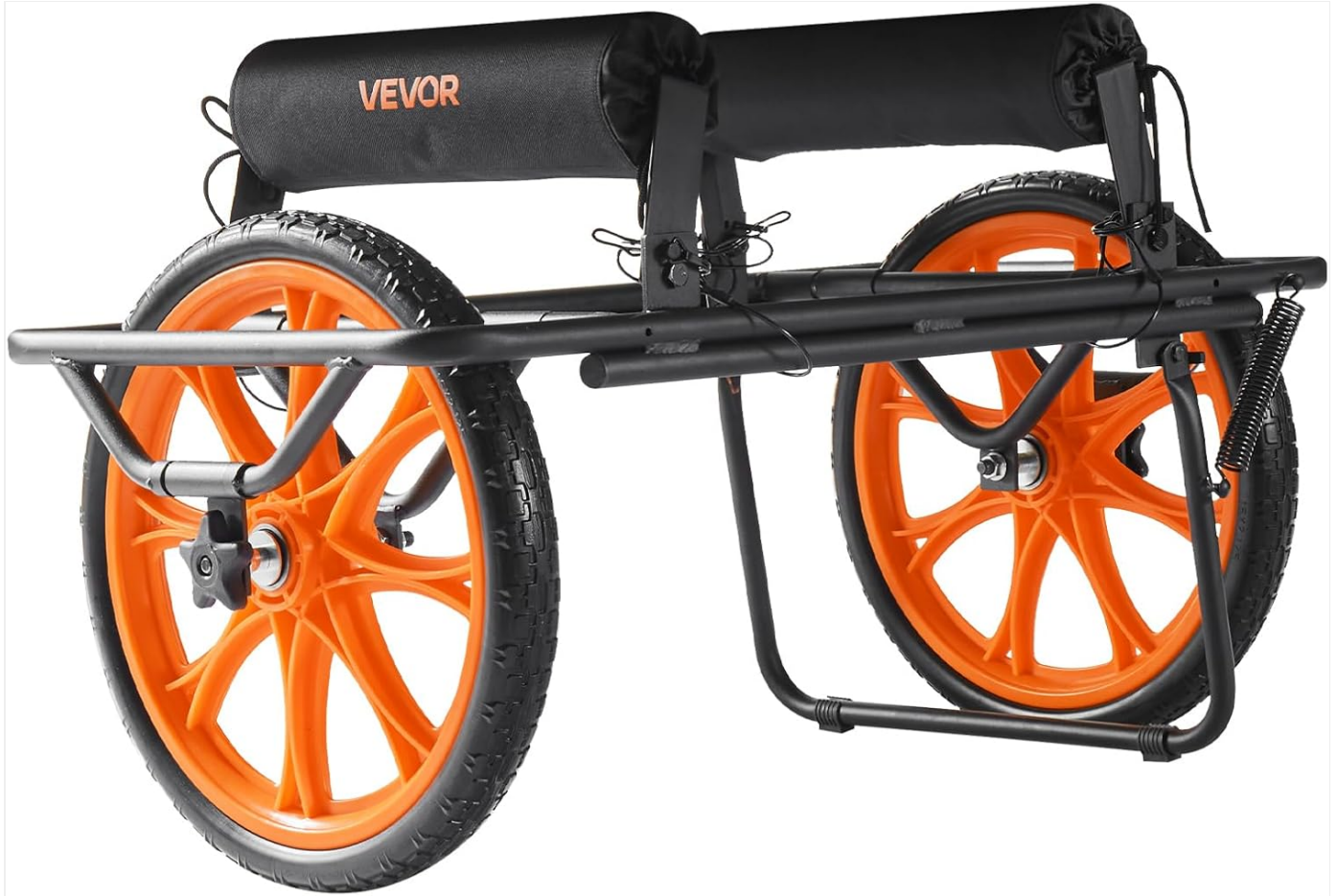
Figure 4.1: Fully assembled VEVOR Kayak Cart.