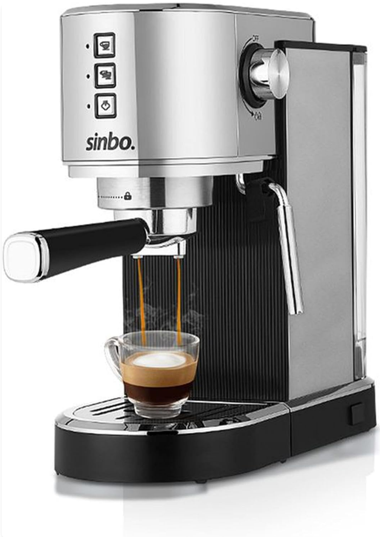
Figure 1.1: The Sinbo SCM-2987 Espresso Coffee Machine in operation, brewing a fresh cup of espresso.