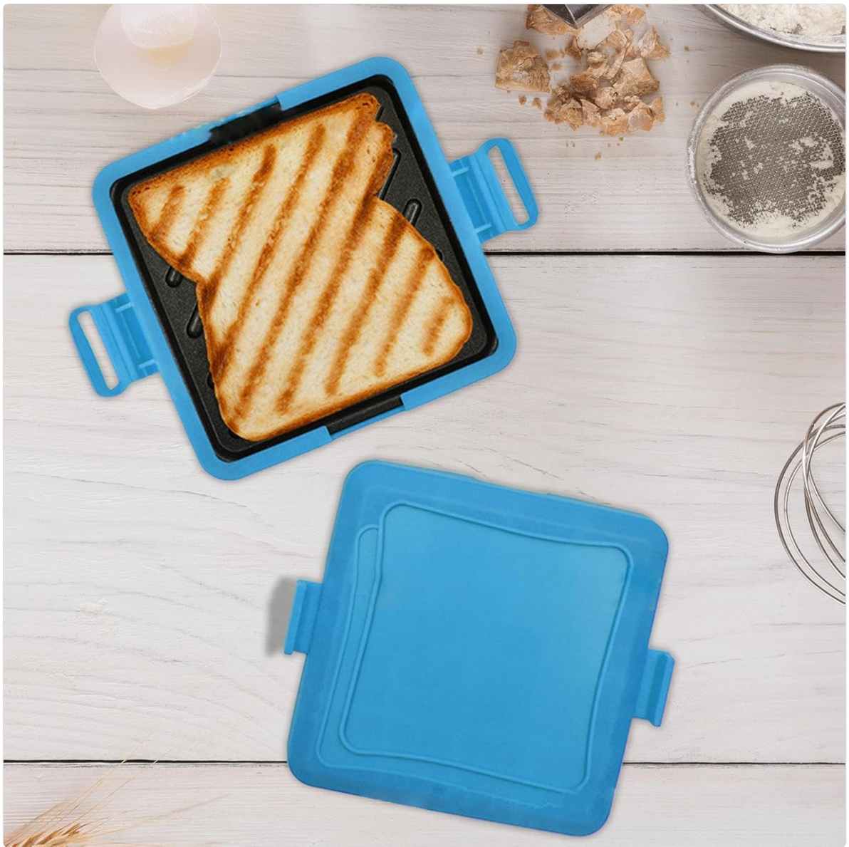
Image 5.2: The sandwich maker press opened, revealing a toasted sandwich.