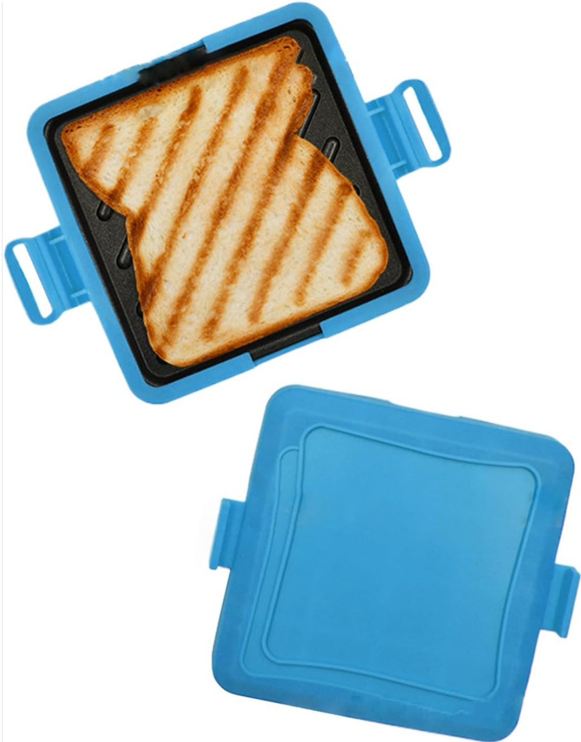
Image 5.1: Sandwich placed inside the closed press, ready for microwaving.