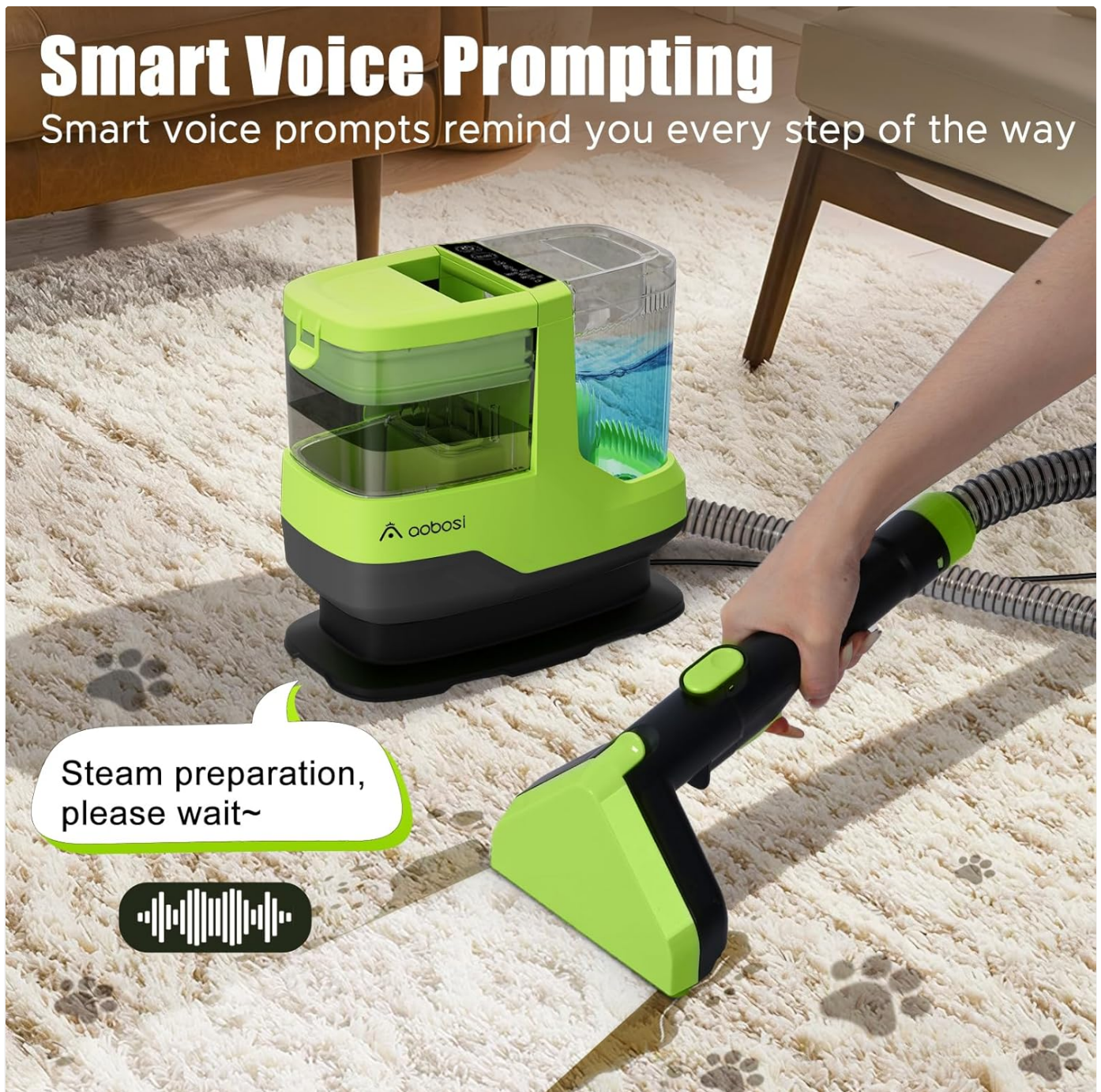
Image: The AAOBOSI C688 machine displaying its smart voice prompting feature, with a speech bubble indicating "Steam preparation, please wait~".

Smart voice prompts remind you every step of the way