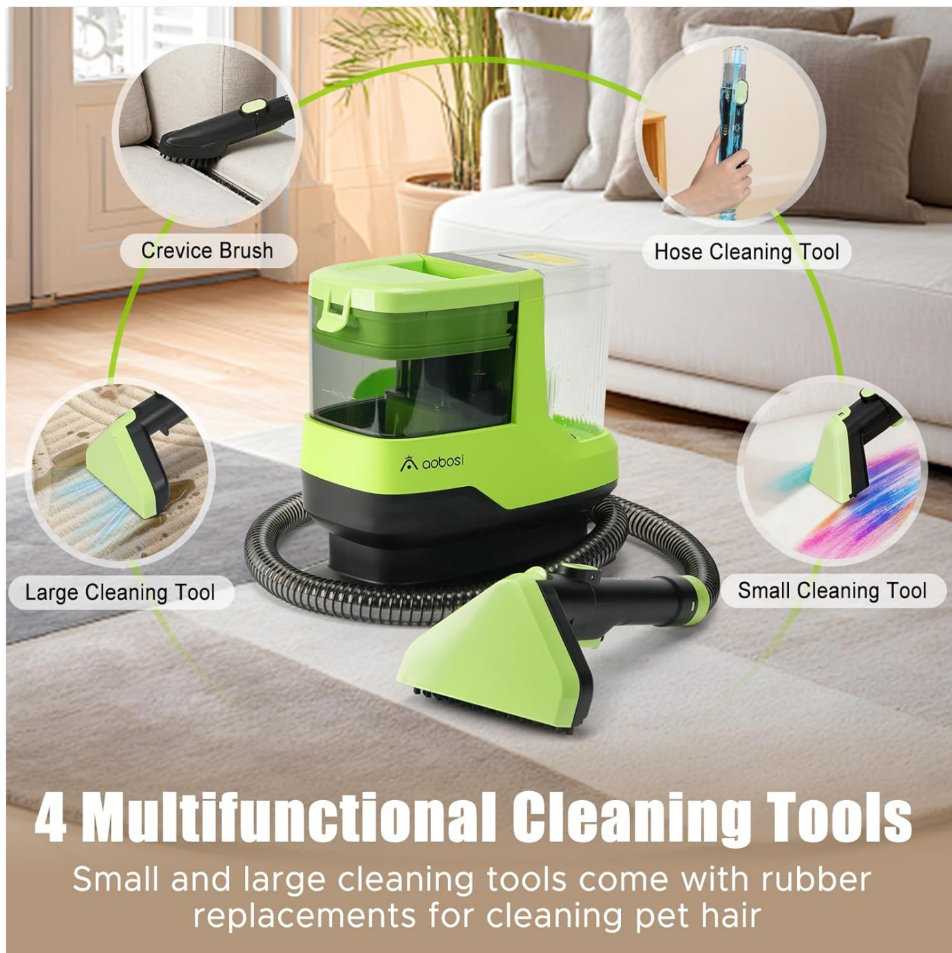
Image: A visual representation of the four specialized cleaning tools included with the AAOBOSI C688: Crevice Brush, Hose Cleaning Tool, Large Cleaning Tool, and Small Cleaning Tool.