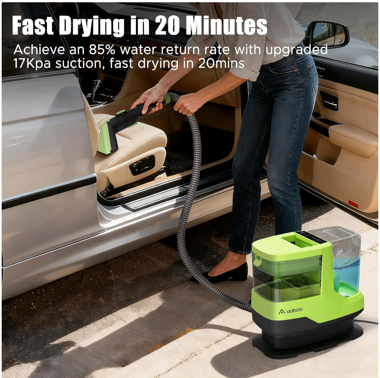
Image: A user cleaning the interior of a car with the AAOBOSI C688, illustrating the machine's fast-drying capability.