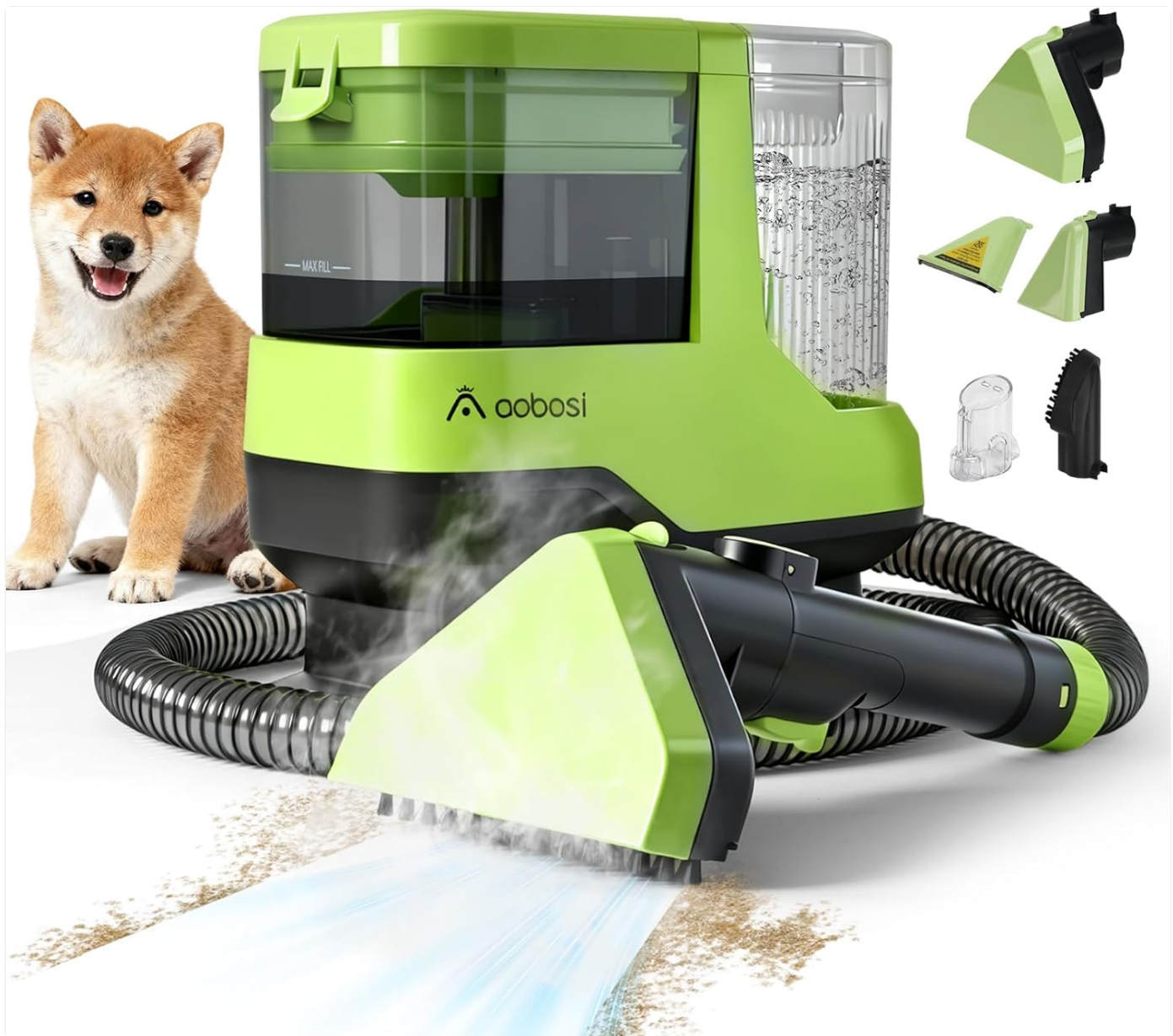
Image: The AAOBOSI C688 Carpet and Upholstery Cleaner Machine, shown with its various attachments and a dog, illustrating its use for pet-related cleaning.