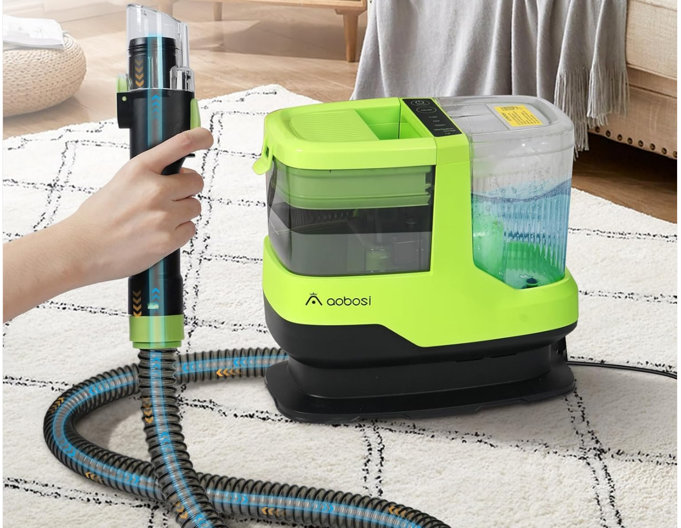
Image: A user demonstrating the 2-step self-cleaning process for the AAOBOSI C688's hose, using the dedicated hose cleaning tool.

Install the self-cleaning tool & run a hot/cold wash mode to clean hose and prevent odor