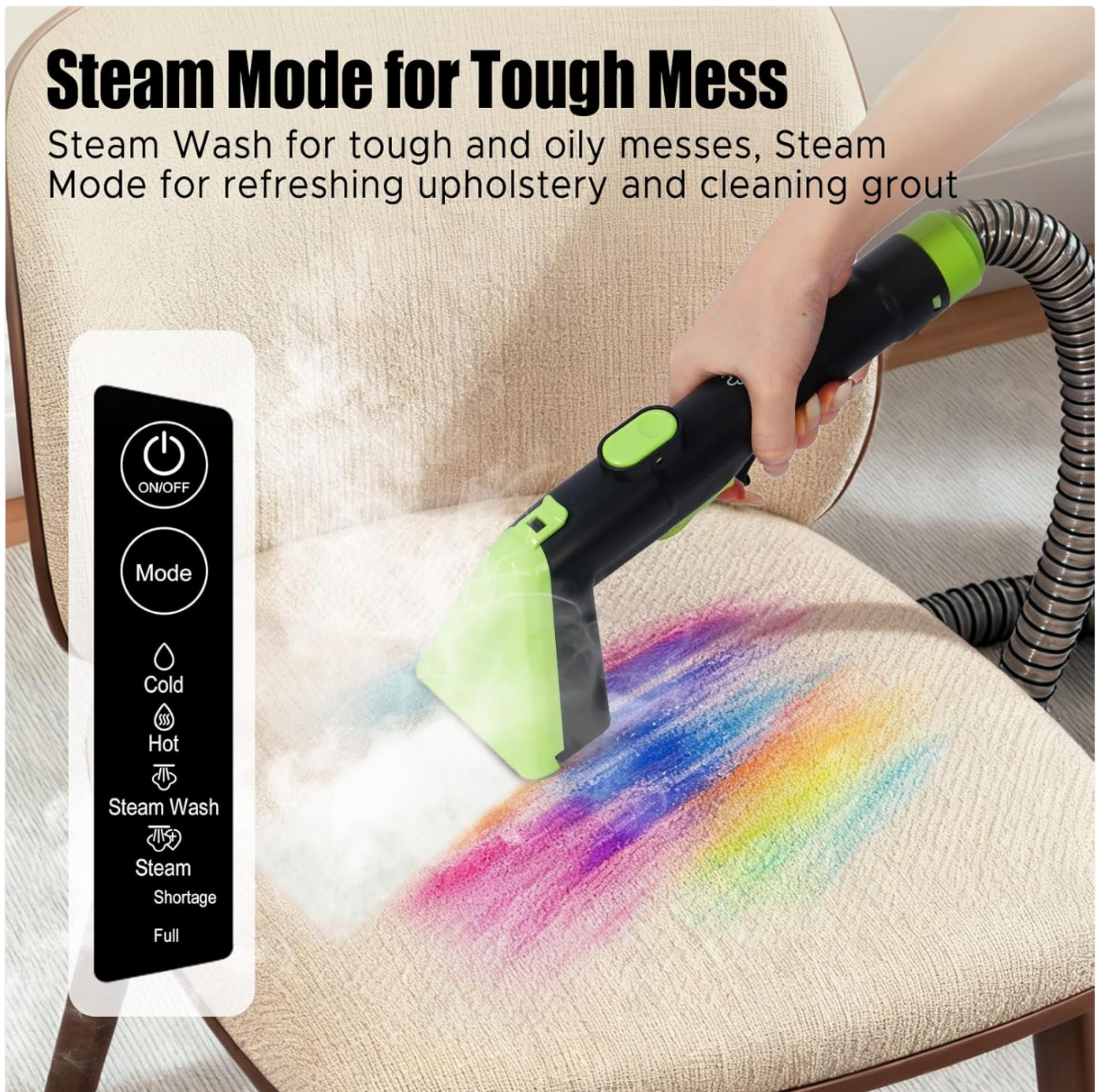
Image: The AAOBOSI C688 machine demonstrating its Steam Mode, effectively cleaning colorful stains from an upholstered chair.

Steam Wash for tough and oily messes, Steam Mode for refreshing upholstery and cleaning grout