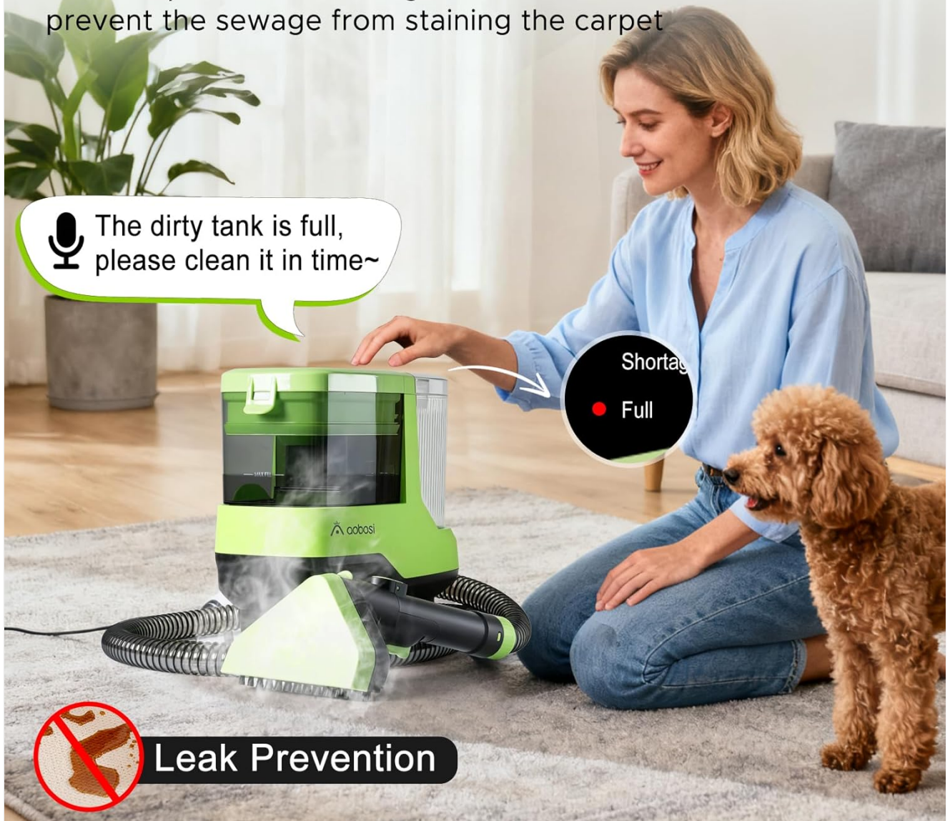
Image: The AAOBOSI C688 demonstrating its auto-stop leak prevention, with a voice prompt indicating "The dirty tank is full, please clean it in time~" and a visual indicator for a full tank.

Auto-stop when the sewage tank is full, prevent the sewage from staining the carpet