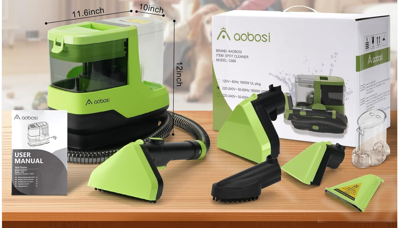
Image: An illustration of all components included in the AAOBOSI C688 package, such as the main unit, hose, large and small hand tools, crevice brush, hose cleaning tool, and user manual.