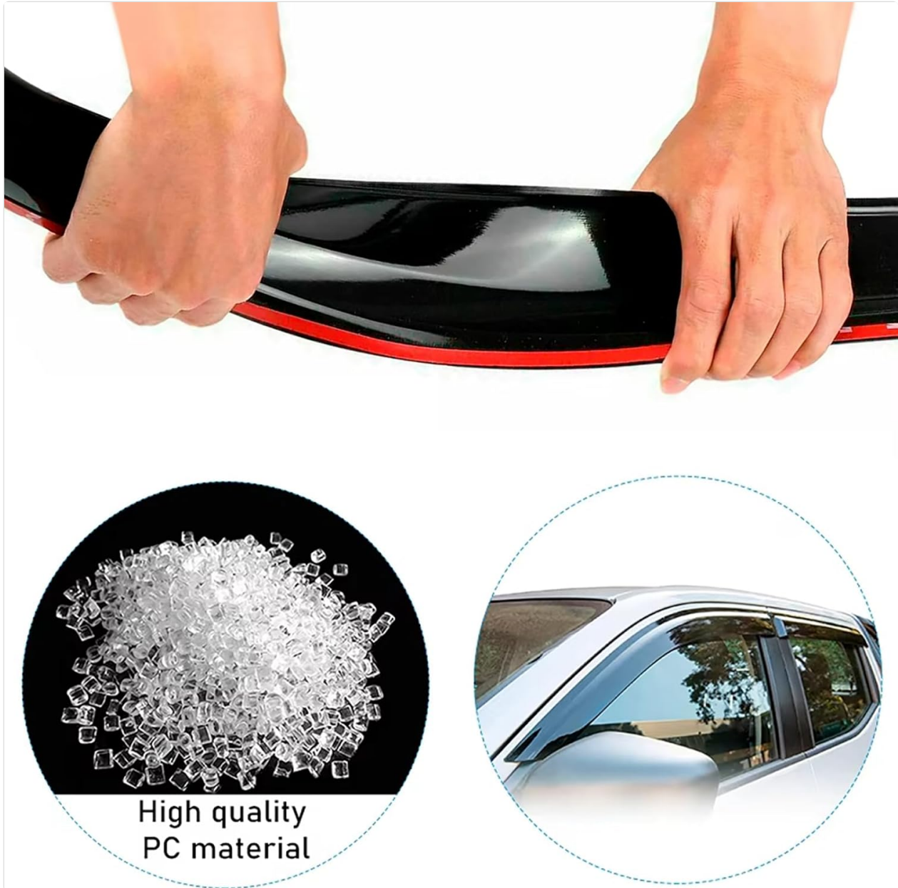
Image 5.1: Demonstrating the durability and quality of the visor material.