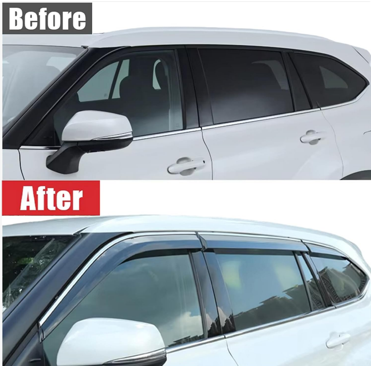
Image 3.3: Visual comparison of the vehicle before and after visor installation.