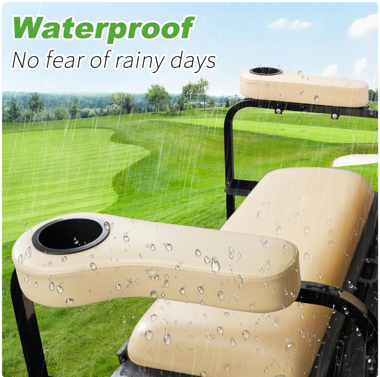
Figure 4.2: Close-up of the arm rests showing water resistance, indicating their waterproof properties.