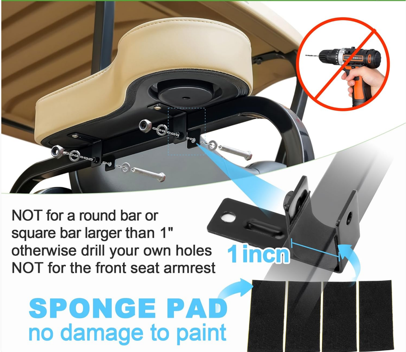
Figure 3.2: Sponge pads are applied to the brackets to prevent scratches and ensure a secure fit on the golf cart bar.

The bracket is for a 1 inch square bar only