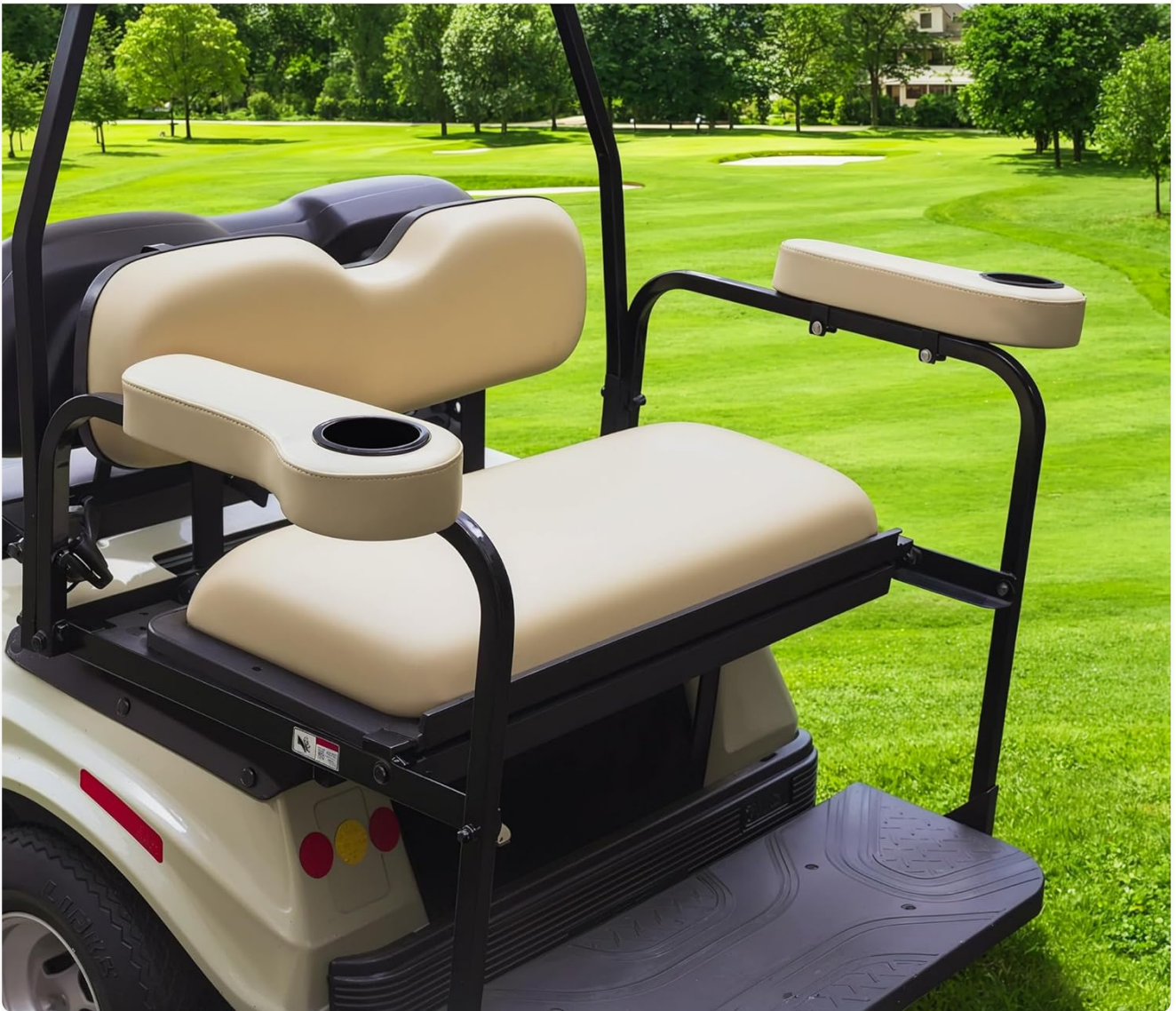
Figure 4.1: The 10LOL Golf Cart Rear Seat Arm Rests installed on a golf cart, showcasing their design and integration.

THE PREFERRED BRAND FOR HIGH - END CUSTOMERS