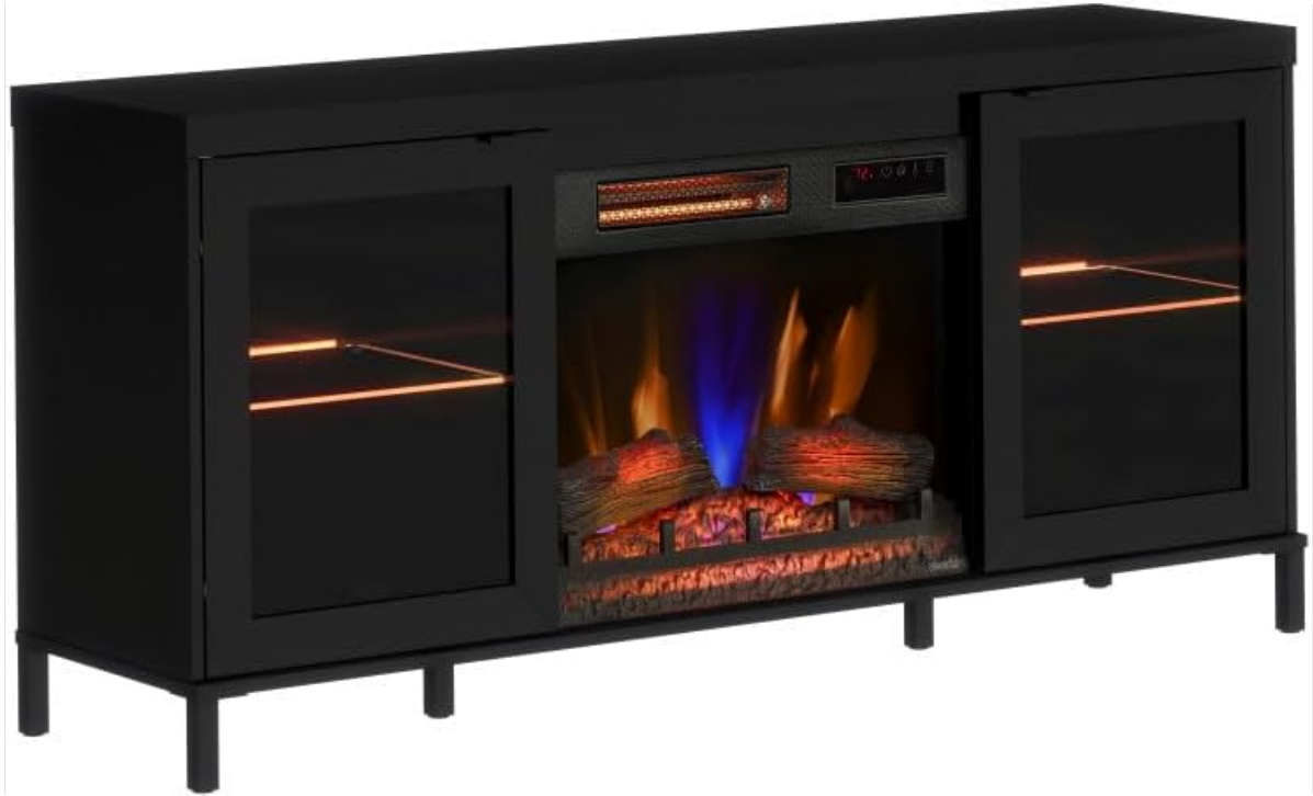
Image 4.1: Dimensional view of the TV stand, indicating a width of 59.5 inches, height of 28 inches, and depth of 15.5 inches.