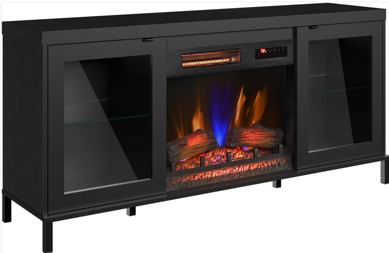
Image 1.1: The duraflame Electric Fireplace TV Stand, showcasing its central fireplace unit, glass-front storage cabinets, and overall black finish.

This manual provides essential instructions for the safe assembly, operation, and maintenance of your duraflame Electric Fireplace TV Stand. Please read all instructions carefully before use and retain this manual for future reference.