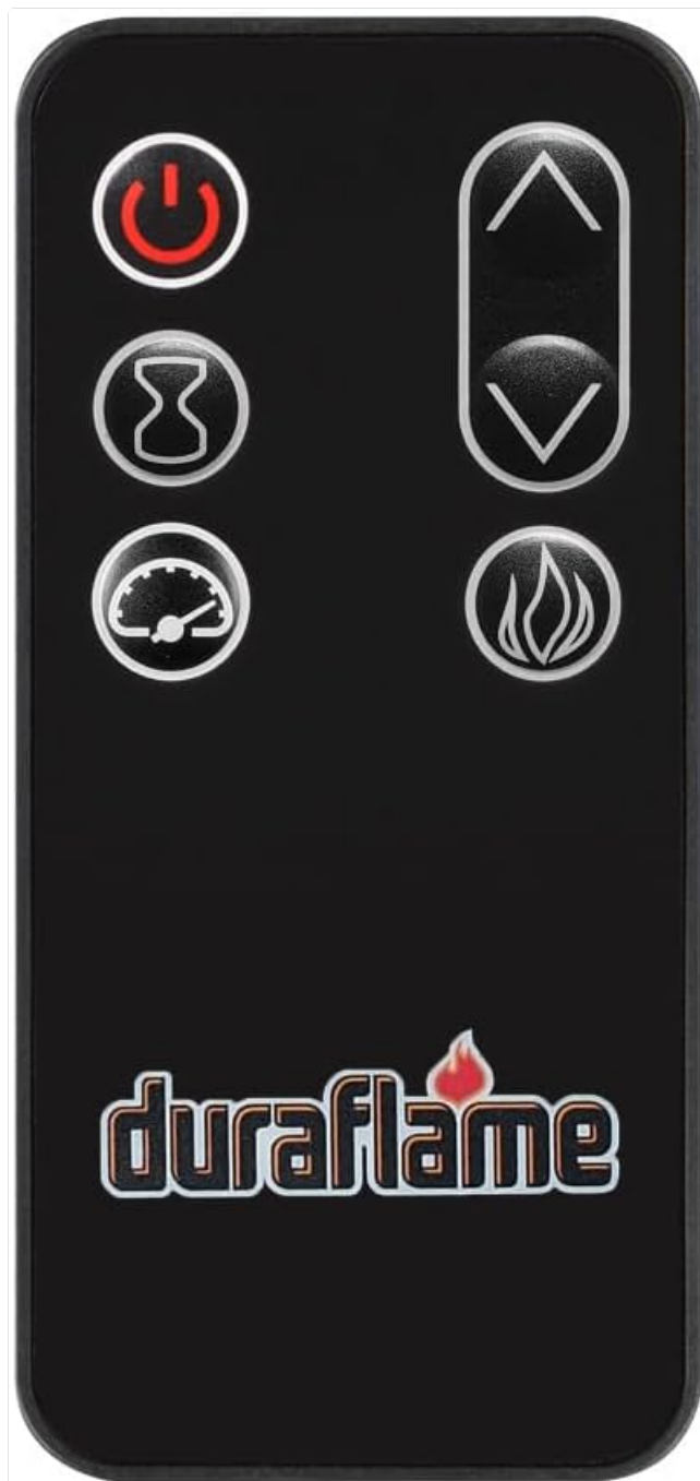
Image 5.1: The remote control, showing buttons for Power, Timer, Temperature, and Flame Effect.