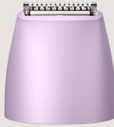
BIKINI TRIMMER HEAD