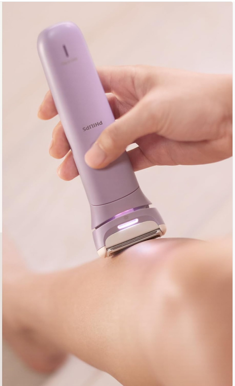
Image: The shaver's LED light helps reveal fine hairs for a thorough shave.