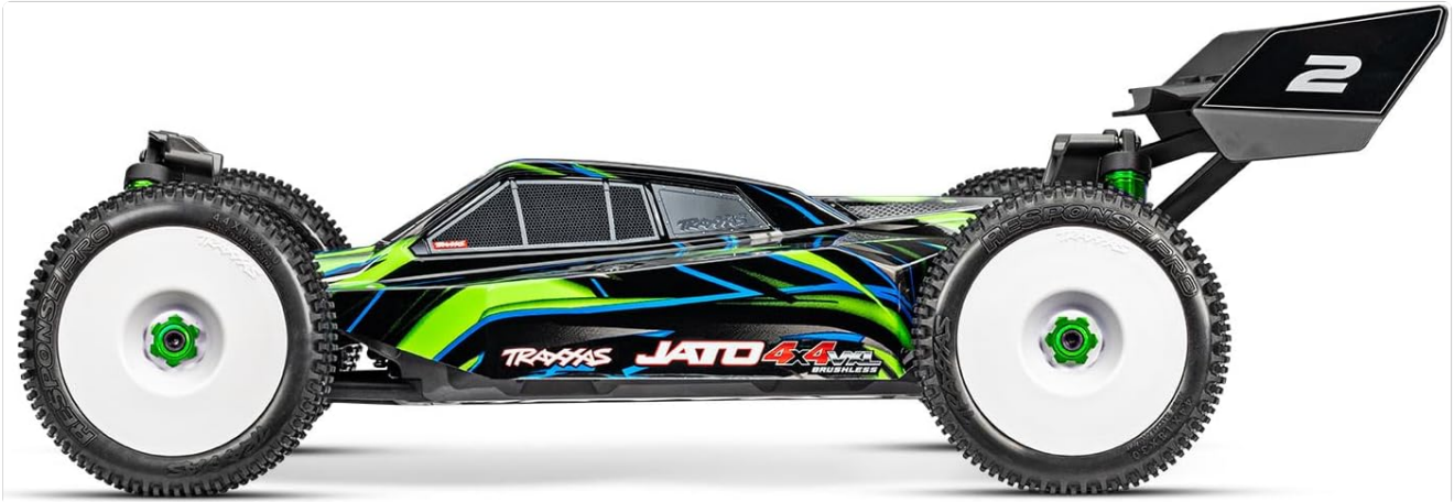
Figure 1: Side view of the Traxxas Jato 4X4 VXL-4s RC Buggy in green, showcasing its sleek design and large wheels.