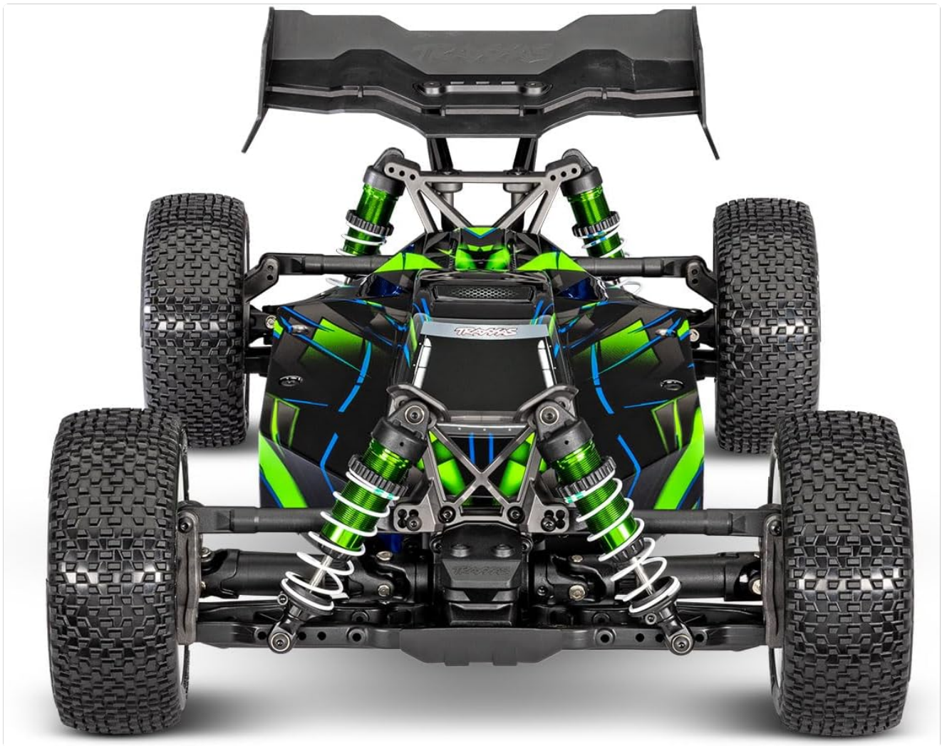
Figure 2: Rear view of the Traxxas Jato 4X4 VXL-4s RC Buggy, highlighting the high-downforce wing and robust suspension.