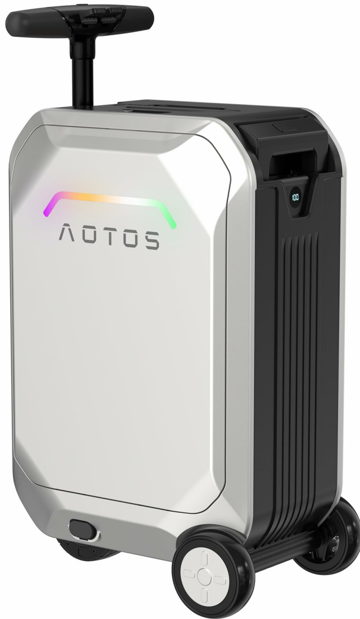
Image 1: The AOTOS Smart Rideable Luggage L2 in Silver, showcasing its sleek design and integrated lighting.