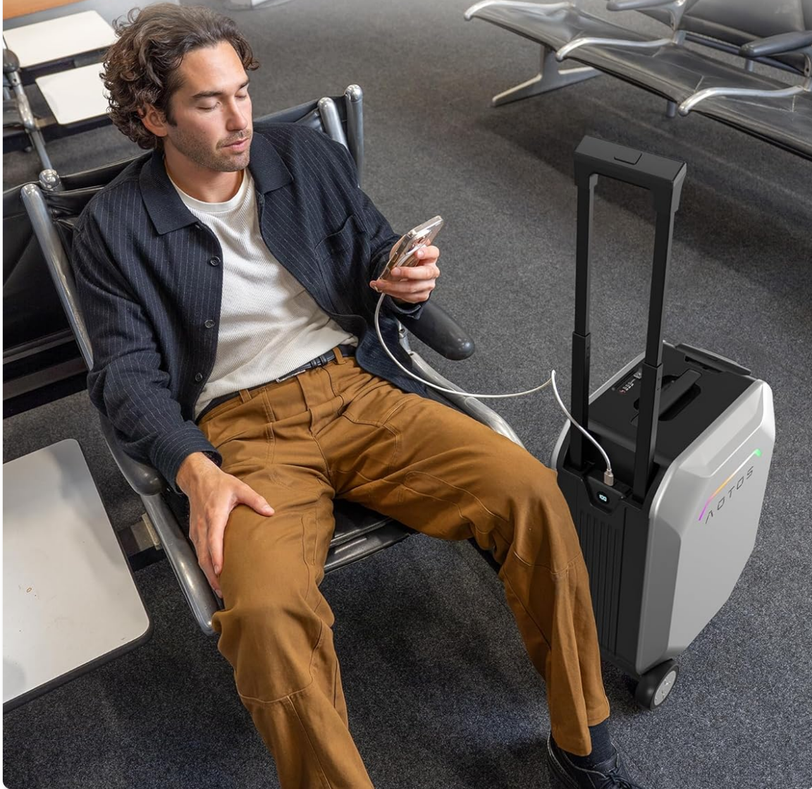
Image 2: A user charging their phone from the integrated power bank of the AOTOS luggage while seated.

The AOTOS Luggage-Scooter Suitcase's built-in TSA-approved charger (92.5Wh removable power bank) safely powers your phone, tablet, or laptop mid-trip. FAA-compliant design + scratch-resistant shell—travel smarter, not harder