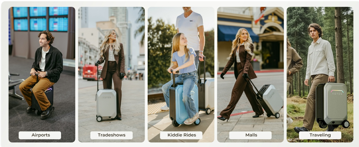
Image 4: A person comfortably riding the AOTOS luggage through an airport terminal, demonstrating its mobility.