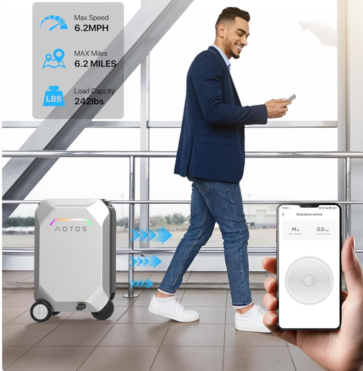
Image 6: A user interacting with the AOTOS mobile application to control the luggage, displaying its smart features.

Elevate your travels with this app-controlled smart carry-on: monitor battery life, adjust speed modes, and enjoy hands-free remote steering while self-diagnostic alerts prevent surprises—all wrapped in customizable ambient lighting for stylish, stress-free mobility.