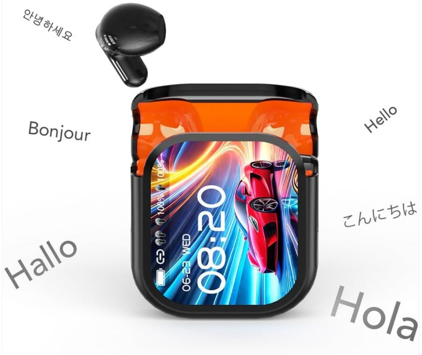
Image: The NE20 earphones illustrating their ability to translate multiple languages.