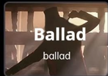
Image: The NE20's display interface showing sound effect options and mini-game access.