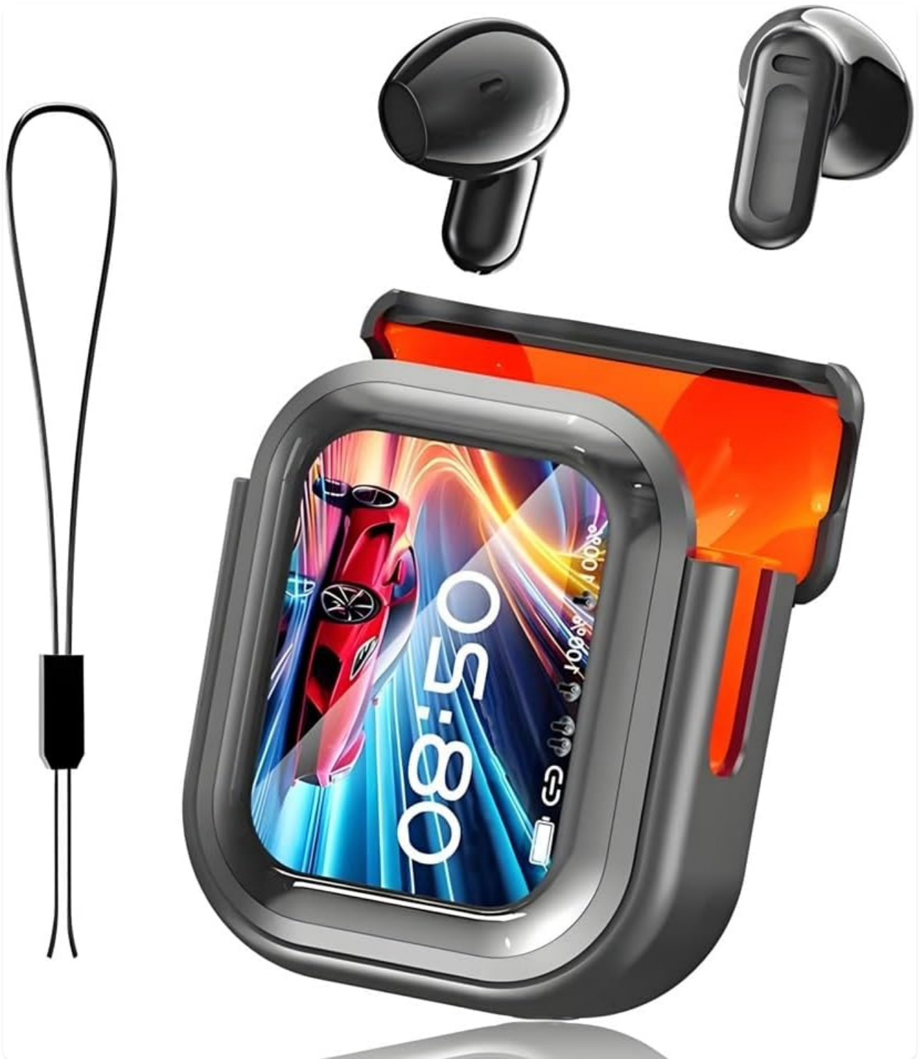
Image: The NE20 earphones and their charging case, featuring a vibrant LED display.