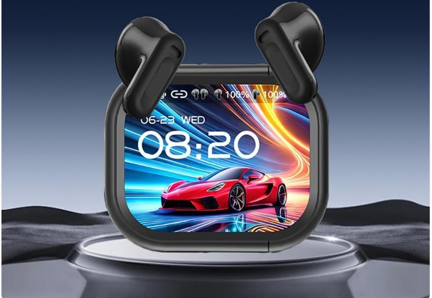
Image: The NE20 earphones in their charging case, highlighting the LED display.

Intelligent noise reduction | AI Intelligent Dialogue Translation | 140 Languages