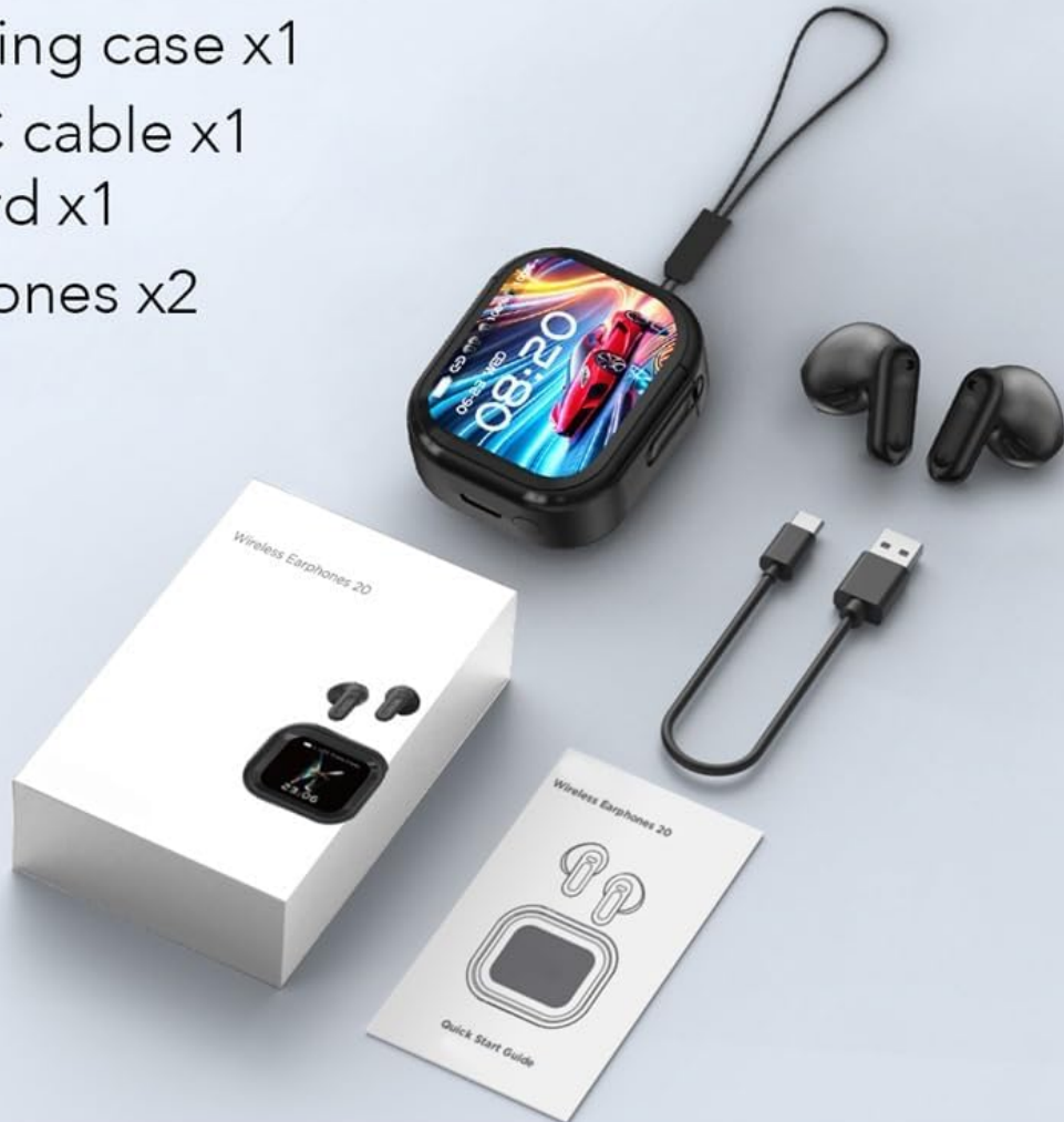
Image: An illustration of the NE20 product packaging and its contents.