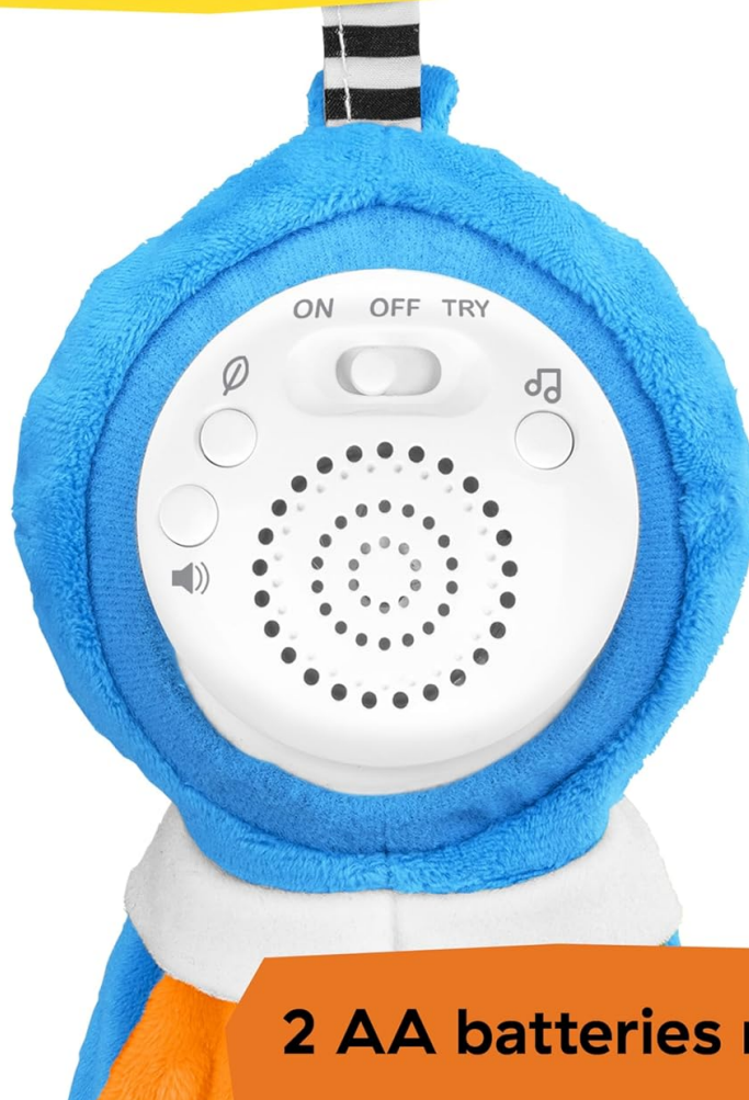
Image: The back of the Opus Octopus Soother, showing the battery compartment and controls for volume and sound options.

5 volume levels, just right for every moment!