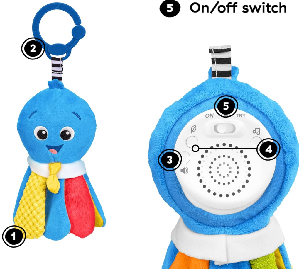
Image: A visual guide to the Opus Octopus Soother's controls and features, including the on/off switch, volume control, and sound options.

Your browser does not support the video tag.