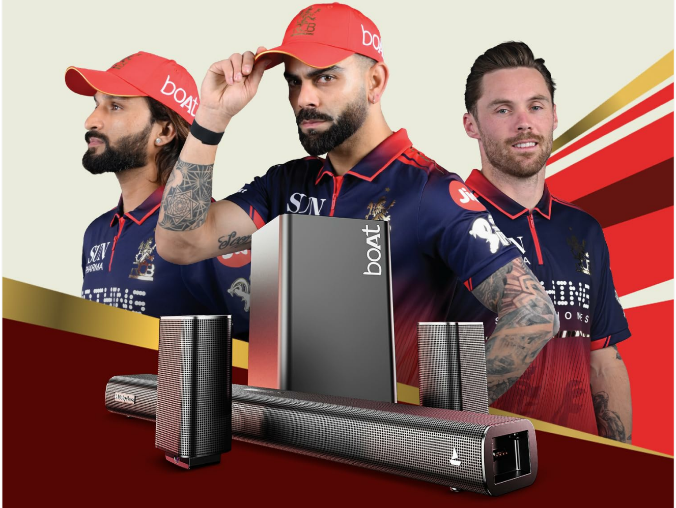
Image: The boAt Aavante Prime X soundbar system, showing the main soundbar unit, the wireless subwoofer, and two detachable satellite speakers.