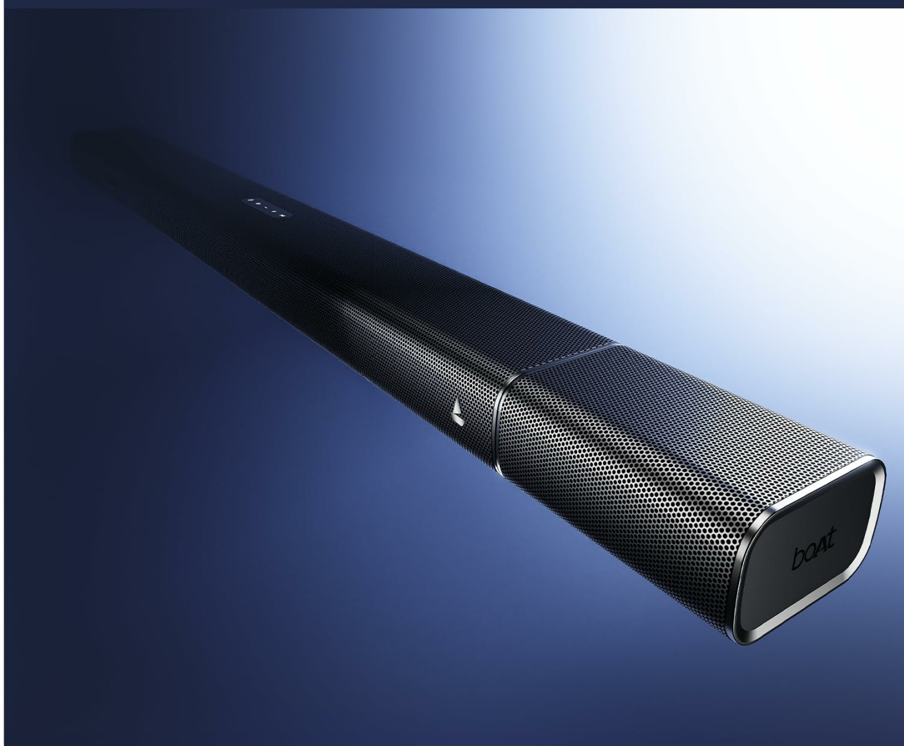
Image: Visual representation of the soundbar's seamless connectivity options and the included master remote control.