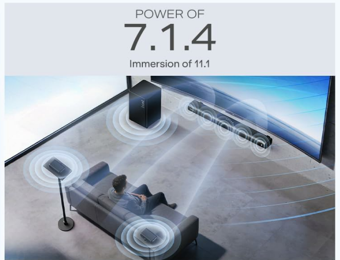
Image: Illustrates the advantage of a truly wireless sound experience with the boAt Aavante Prime X compared to traditional wired soundbars.