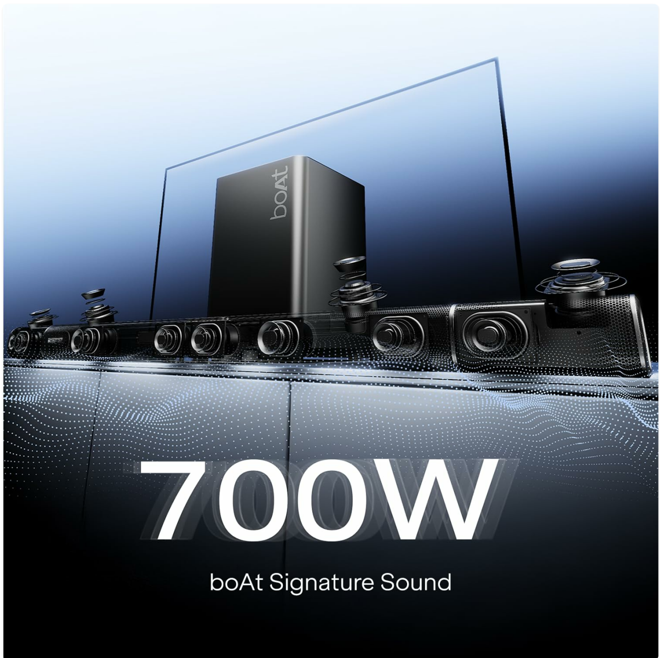
Image: Depicts the optimal placement of the soundbar, subwoofer, and satellite speakers for a 7.1.4 channel sound experience.