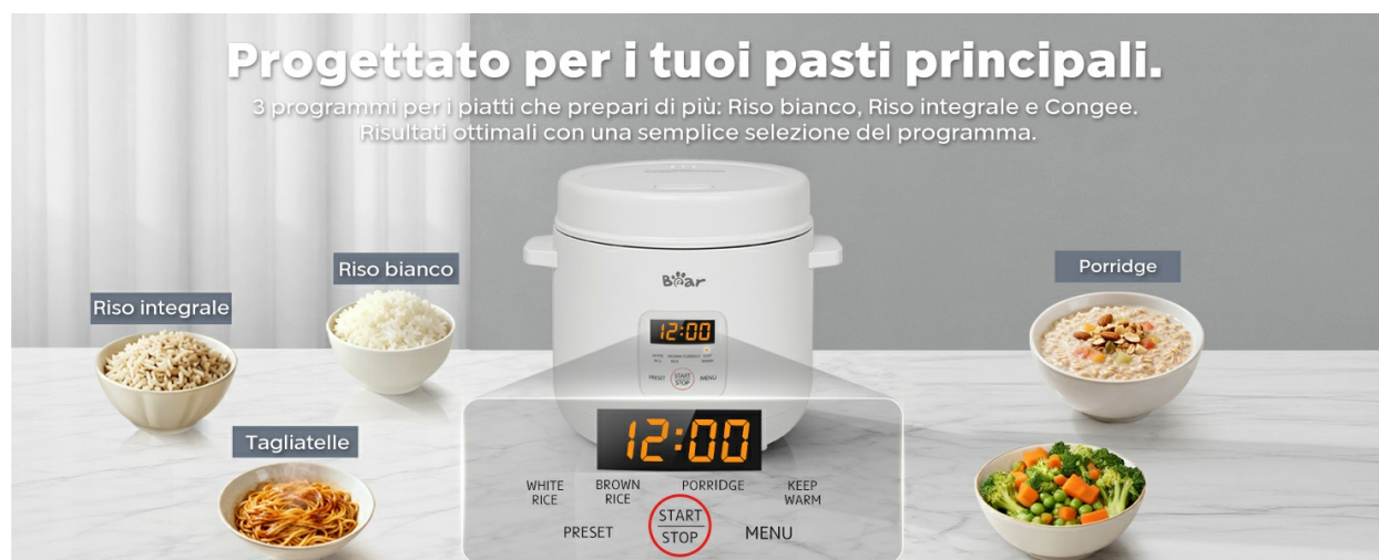
Image: The control panel of the Bear DFB-S12E6 Mini Rice Cooker, displaying options for "WHITE RICE", "BROWN RICE", "PORRIDGE", and "KEEP WARM". This illustrates the various cooking modes available.