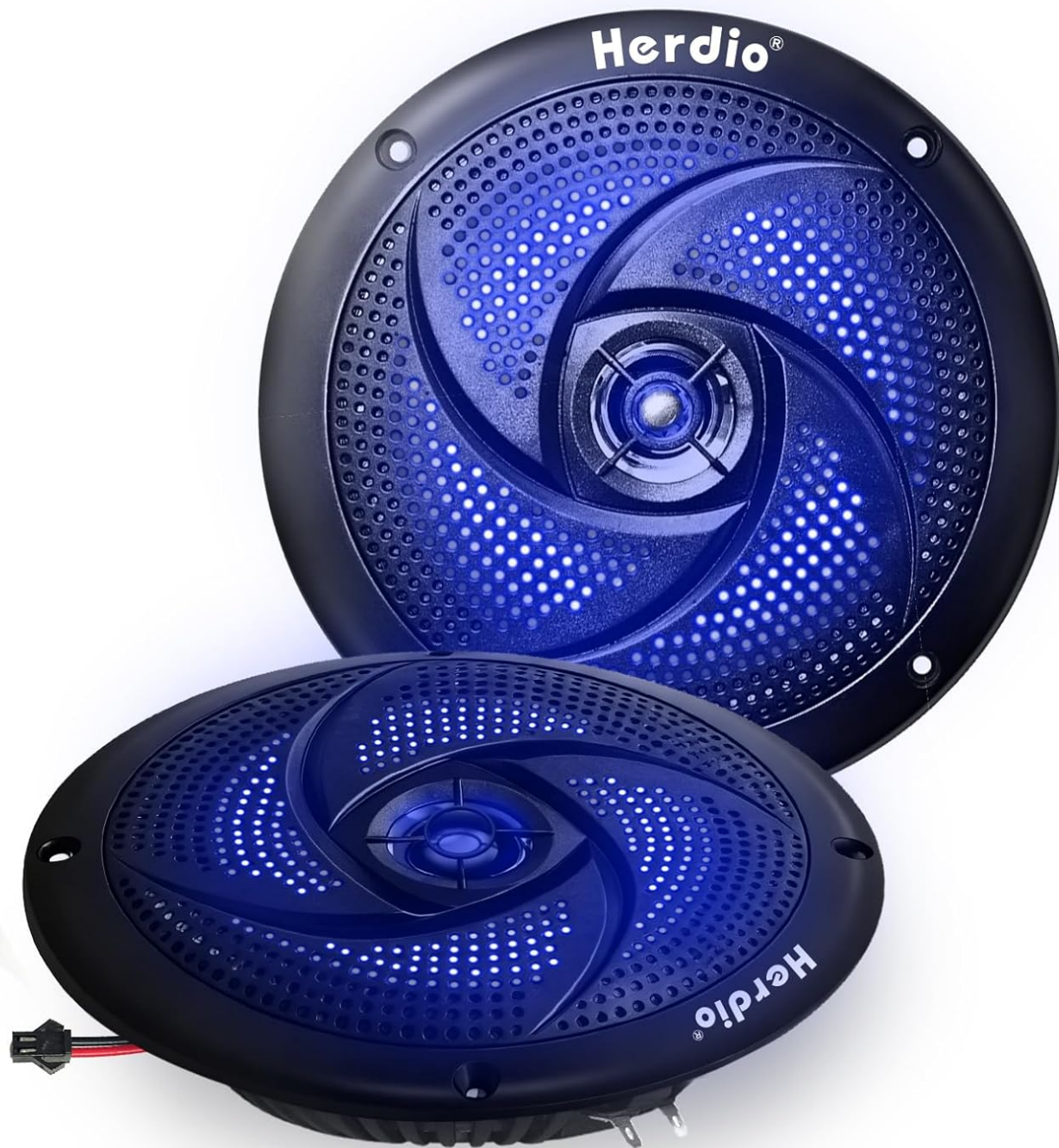
Figure 4.1: Herdio 6.5 Inch Marine Speakers with LED illumination.