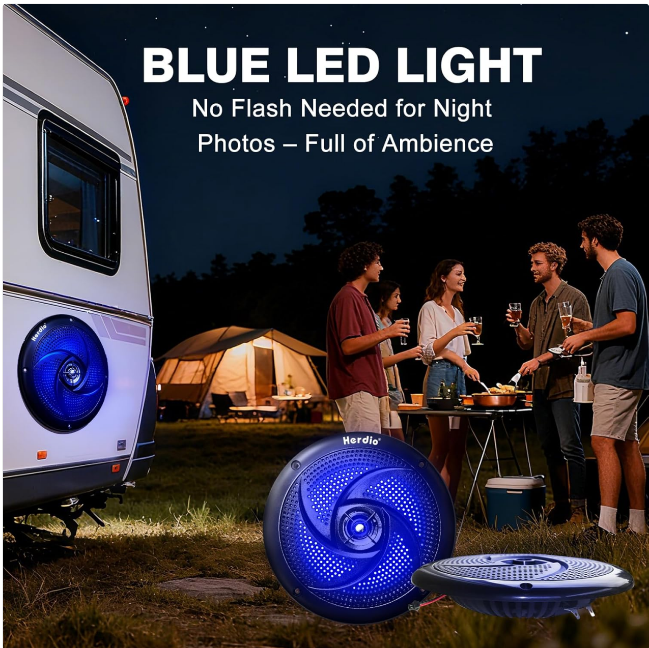
Figure 4.5: Blue LED lights providing ambient illumination.