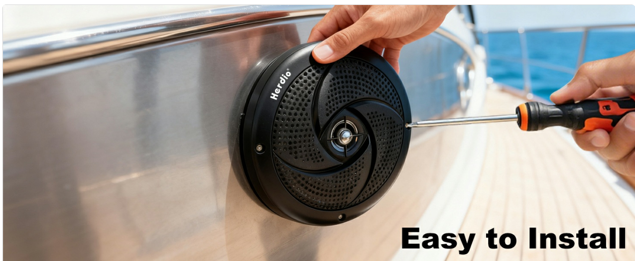
Figure 5.2: Speaker installation process.