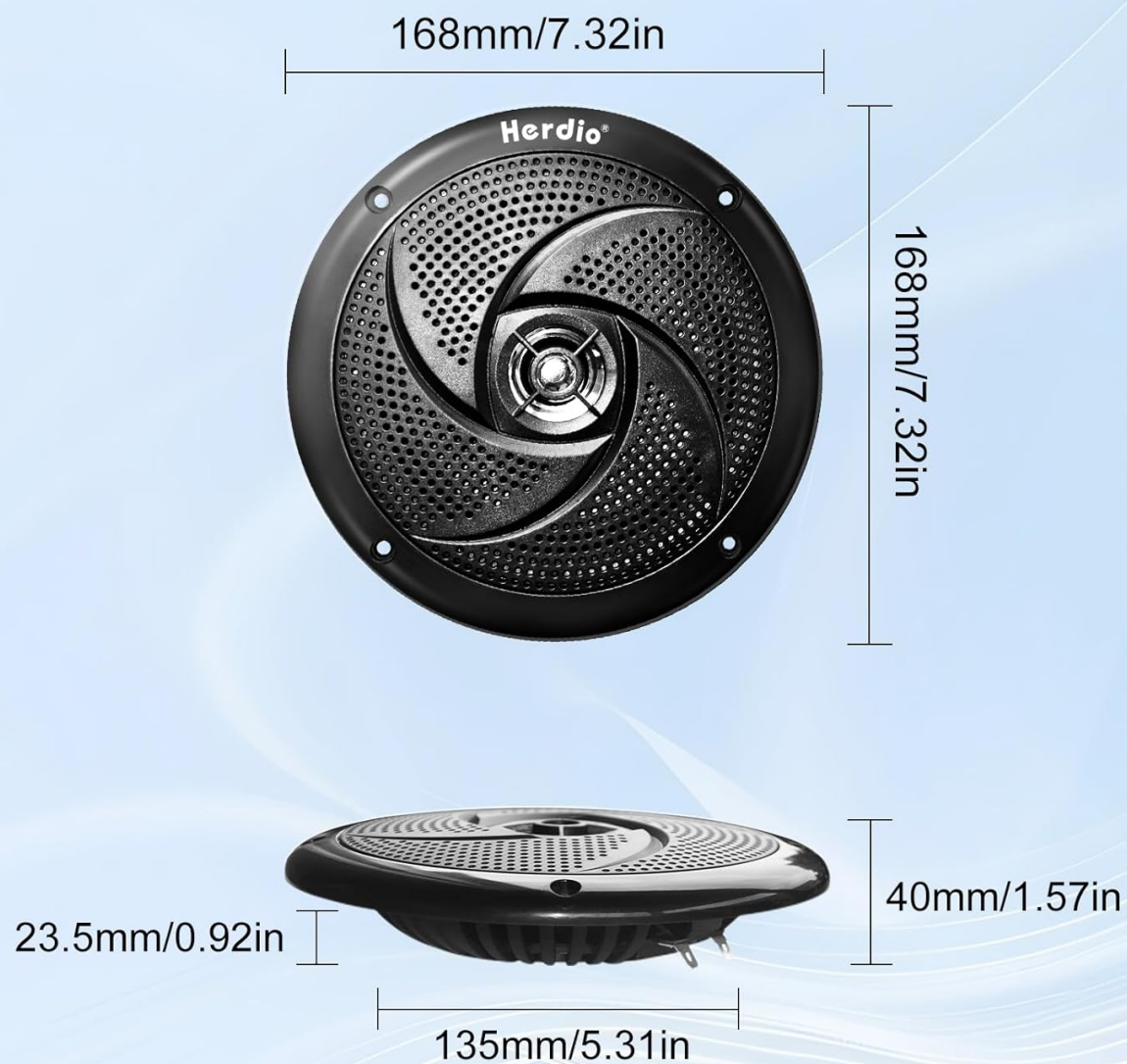
Figure 10.1: Key technical specifications.