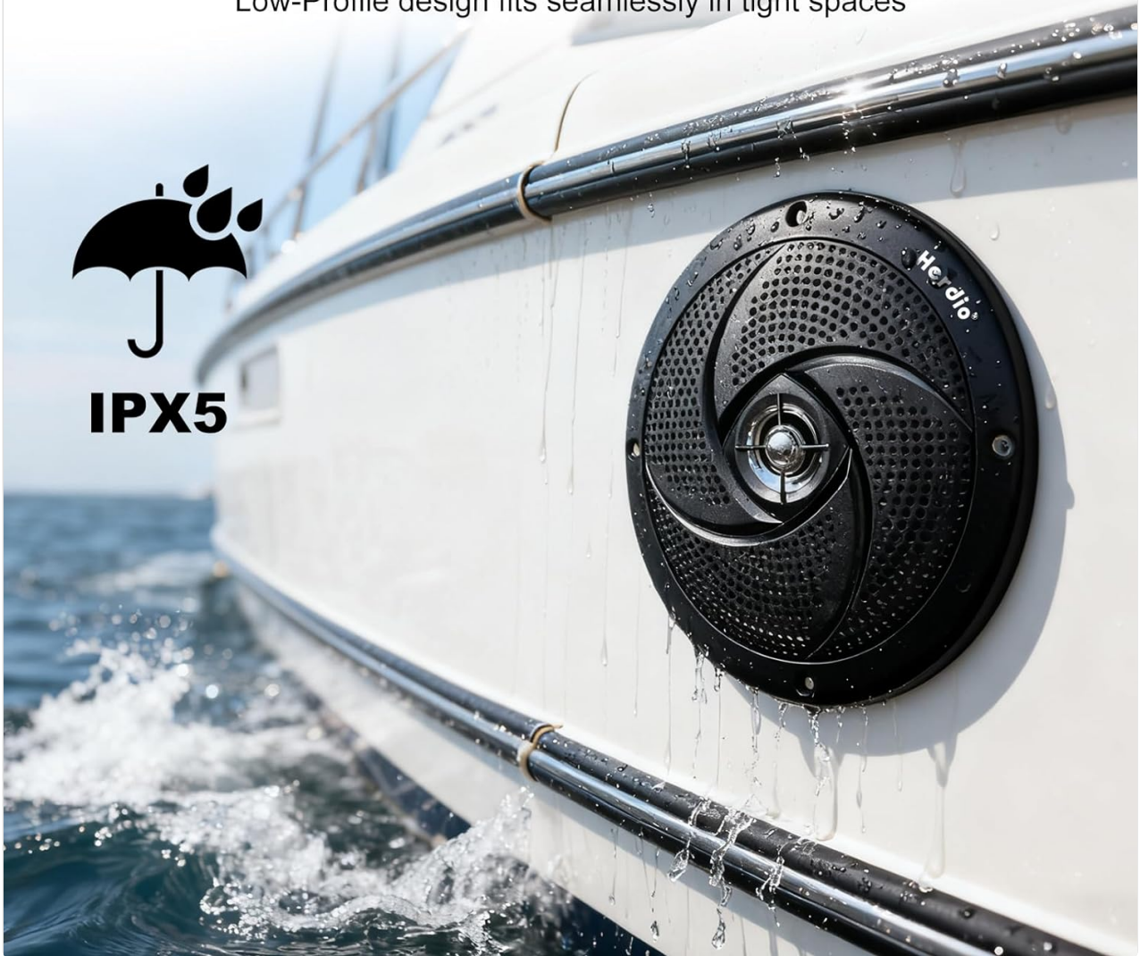
Figure 4.4: Rugged marine-grade construction with IPX5 waterproof rating.