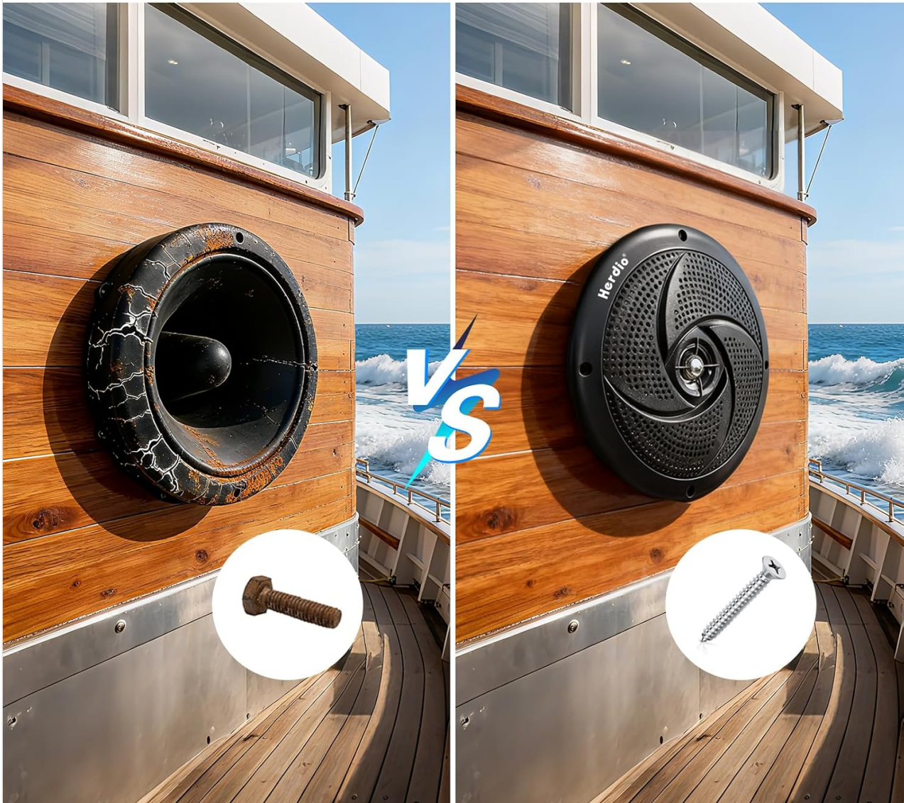
Figure 8.1: All-weather durability comparison.