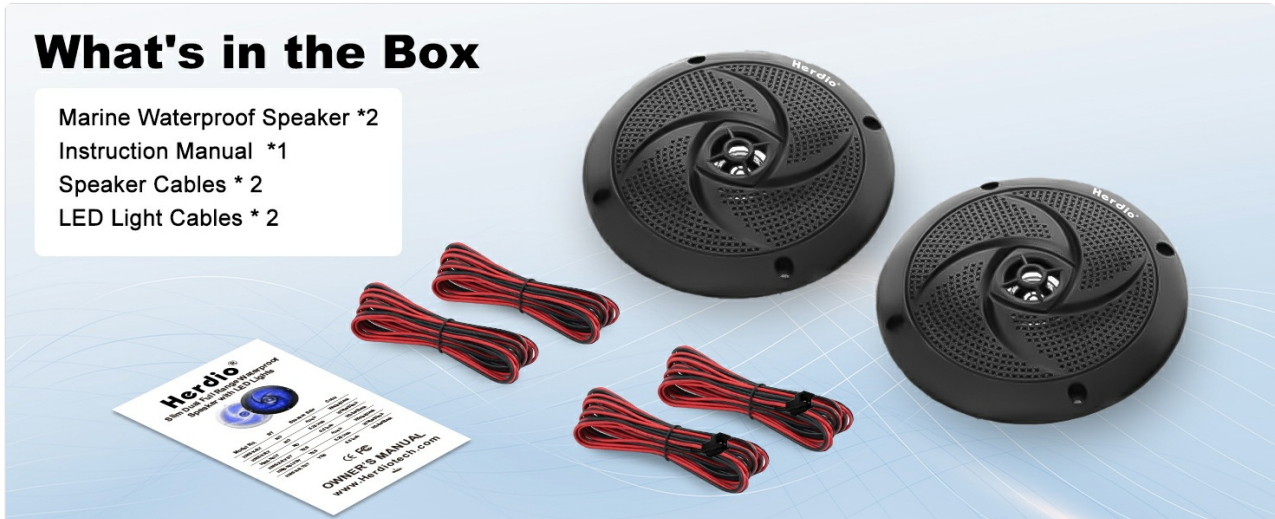
Figure 3.1: Included components in the Herdio Marine Speaker package.

Marine Waterproof Speaker *2 Instruction Manual *1 Speaker Cables * 2 LED Light Cables * 2