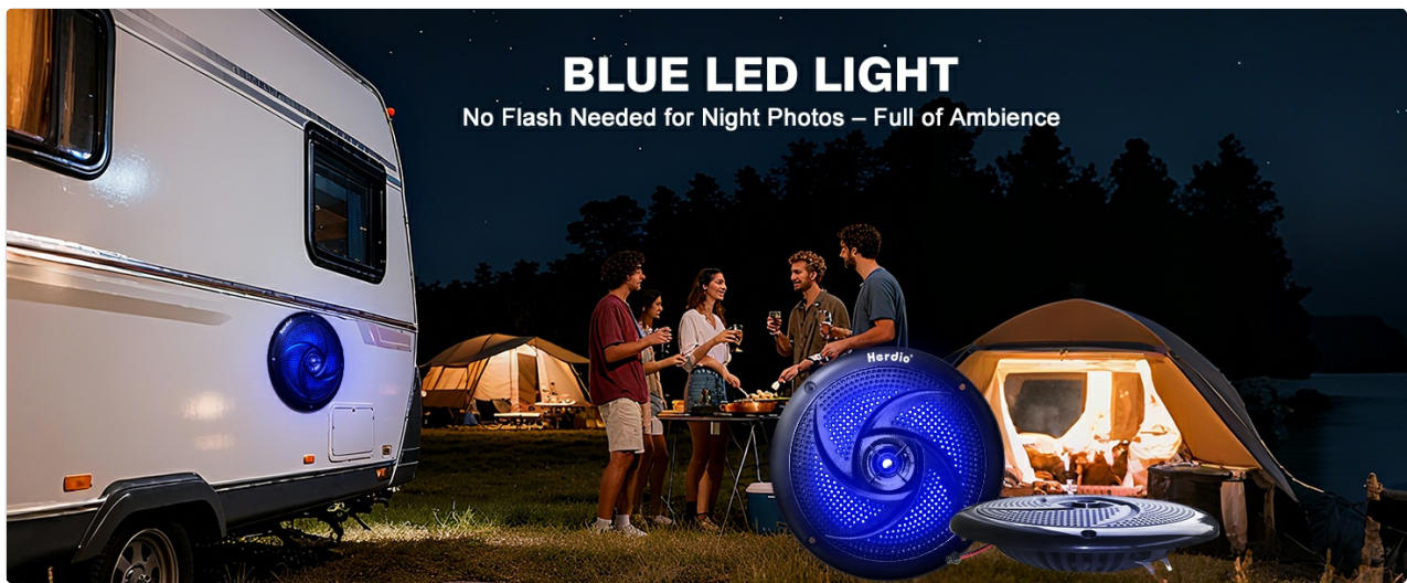
Figure 5.1: Examples of suitable installation environments.