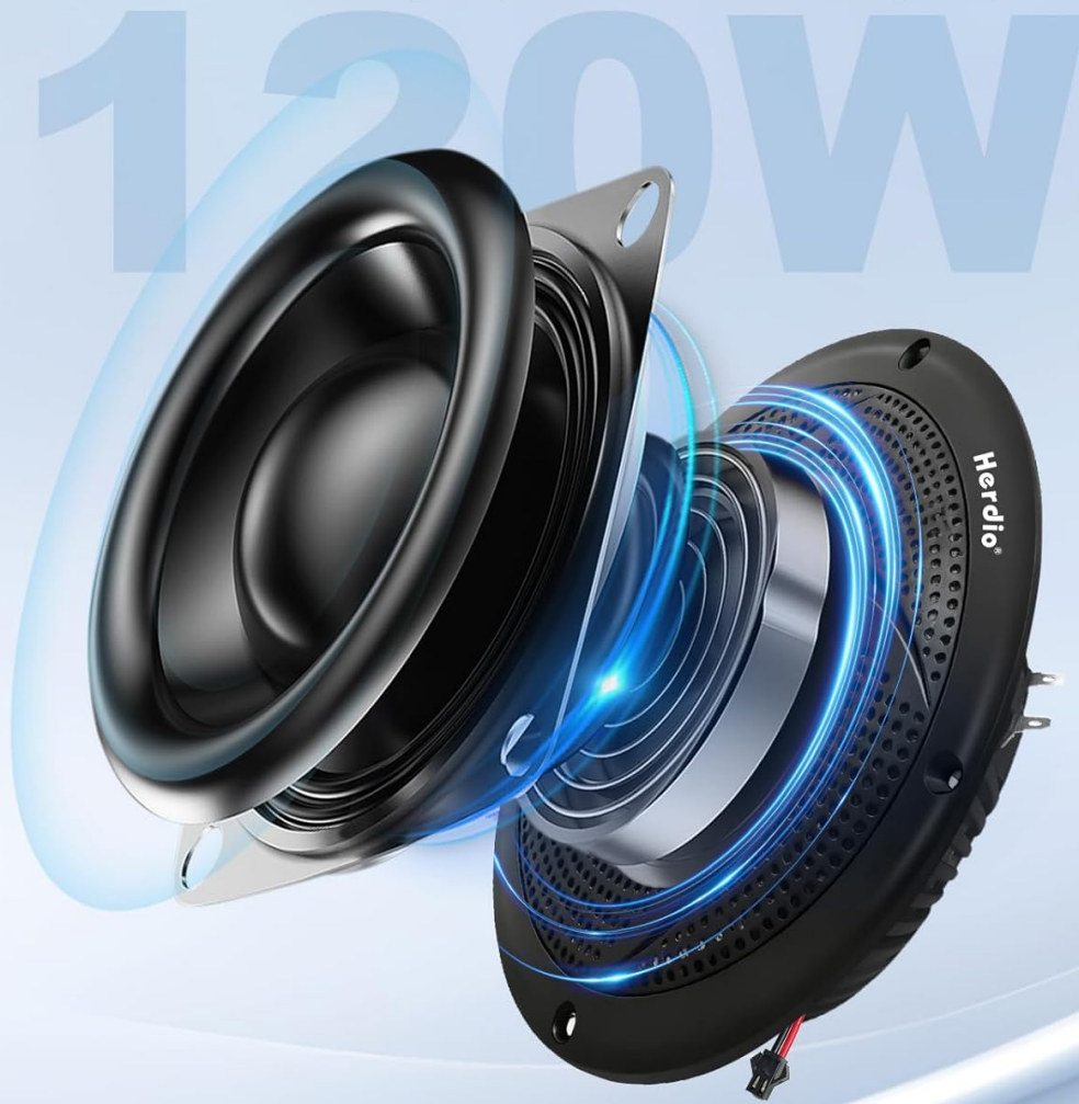
Figure 4.3: Slim design and power rating of the waterproof speaker.