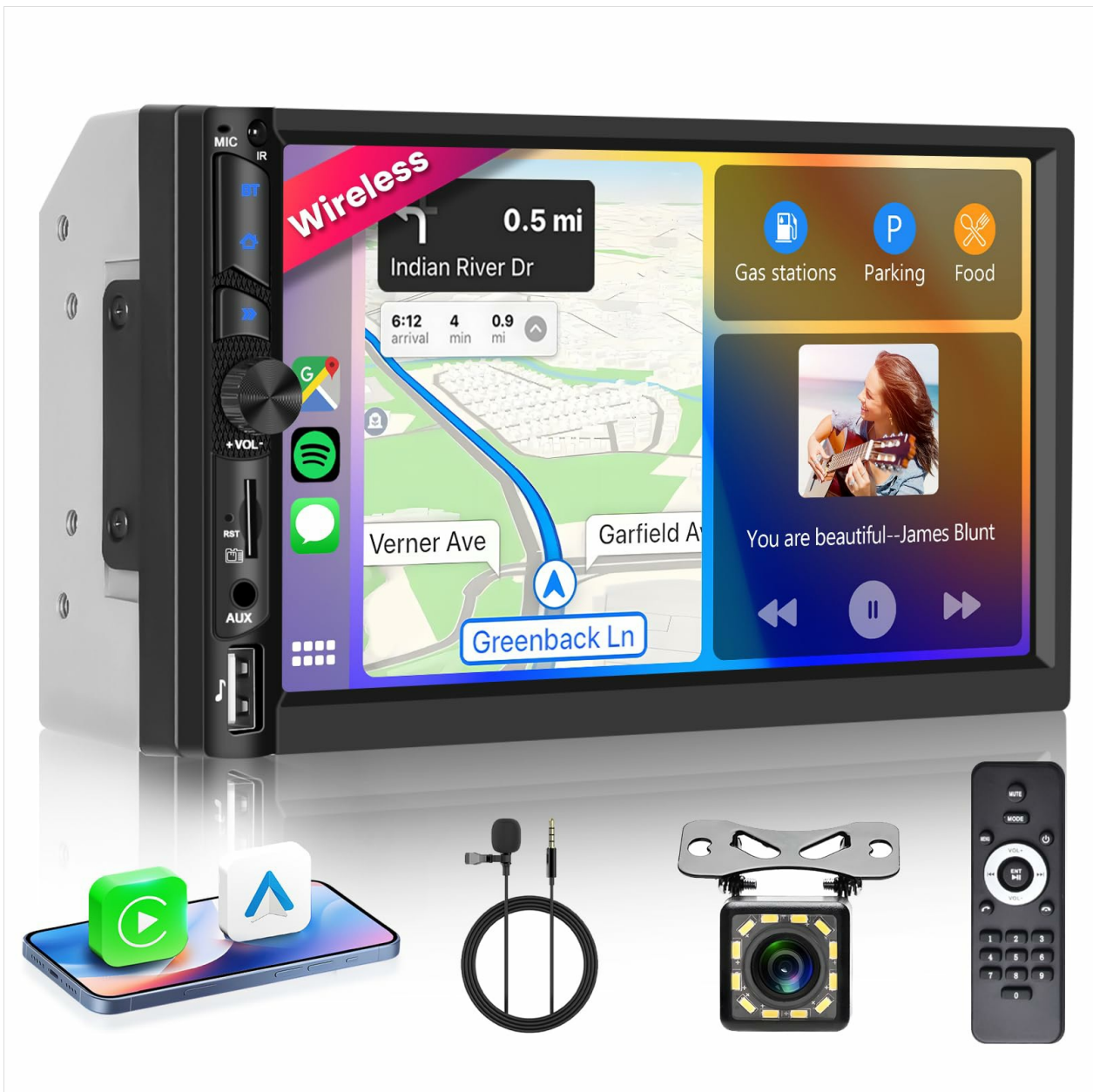
Image: The car stereo displaying navigation and media controls through Wireless CarPlay and Android Auto, with a smartphone showing the connection.