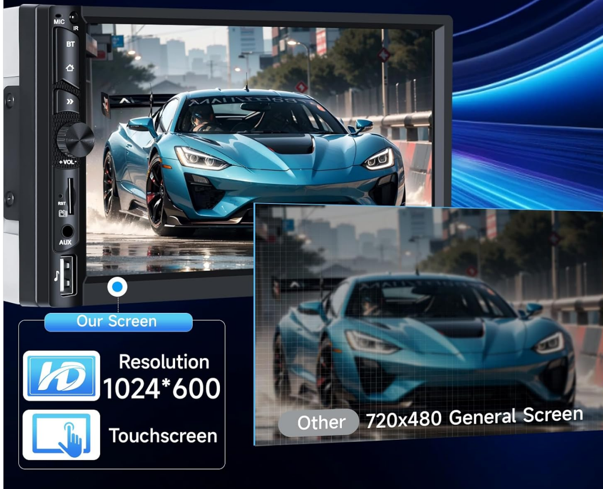
Image: The 7-inch HD touchscreen of the car stereo, highlighting its 1024x600 resolution and touch functionality.