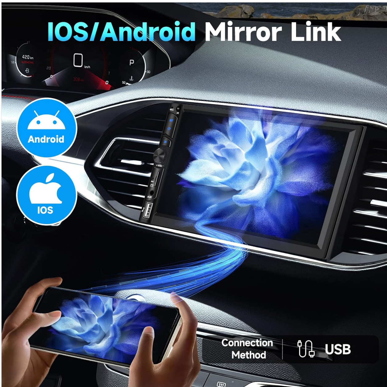
Image: A smartphone mirroring its display to the car stereo screen, demonstrating the iOS/Android Mirror Link feature.