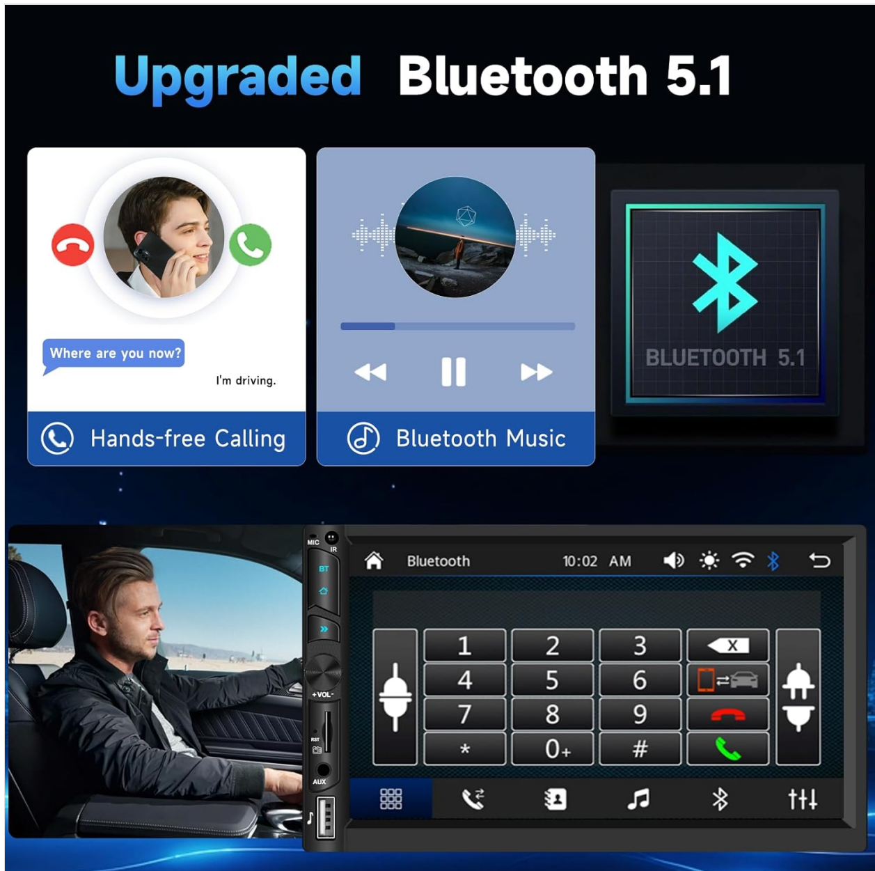
Image: The car stereo interface showing Bluetooth 5.1 connectivity, with options for hands-free calling and music streaming.

You can also stream music wirelessly from your device to the car stereo for an enhanced audio experience.