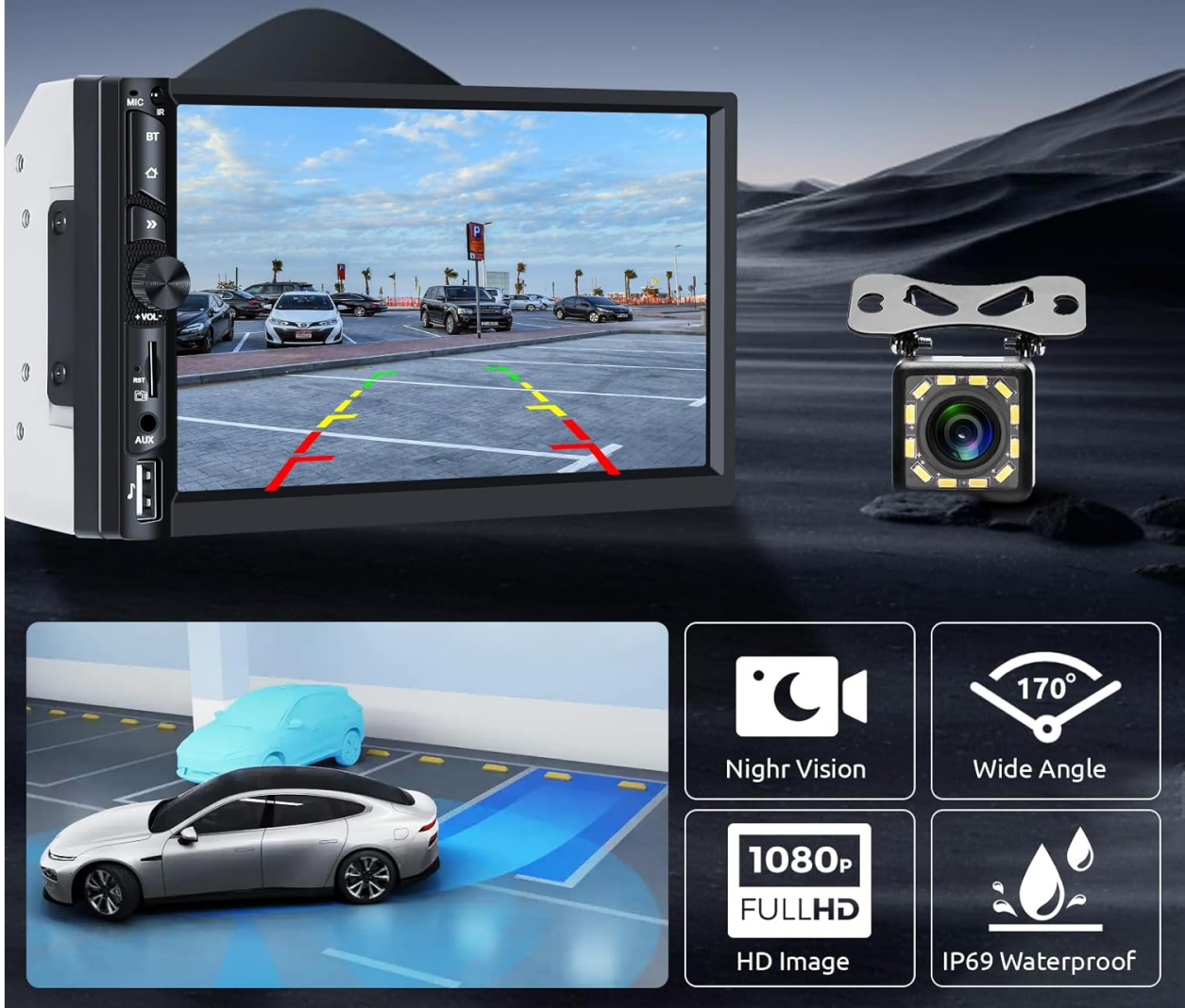
Image: The car stereo screen showing the view from the HD backup camera with parking assist lines, alongside an image of the camera unit.