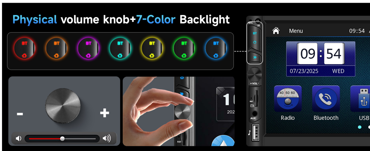
Image: Close-up of the car stereo's physical volume knob and the customizable 7-color backlit buttons.

The physical volume knob allows for quick and precise volume adjustments. The left-side buttons feature a 7-color backlight, improving visibility and ease of operation in low-light conditions.