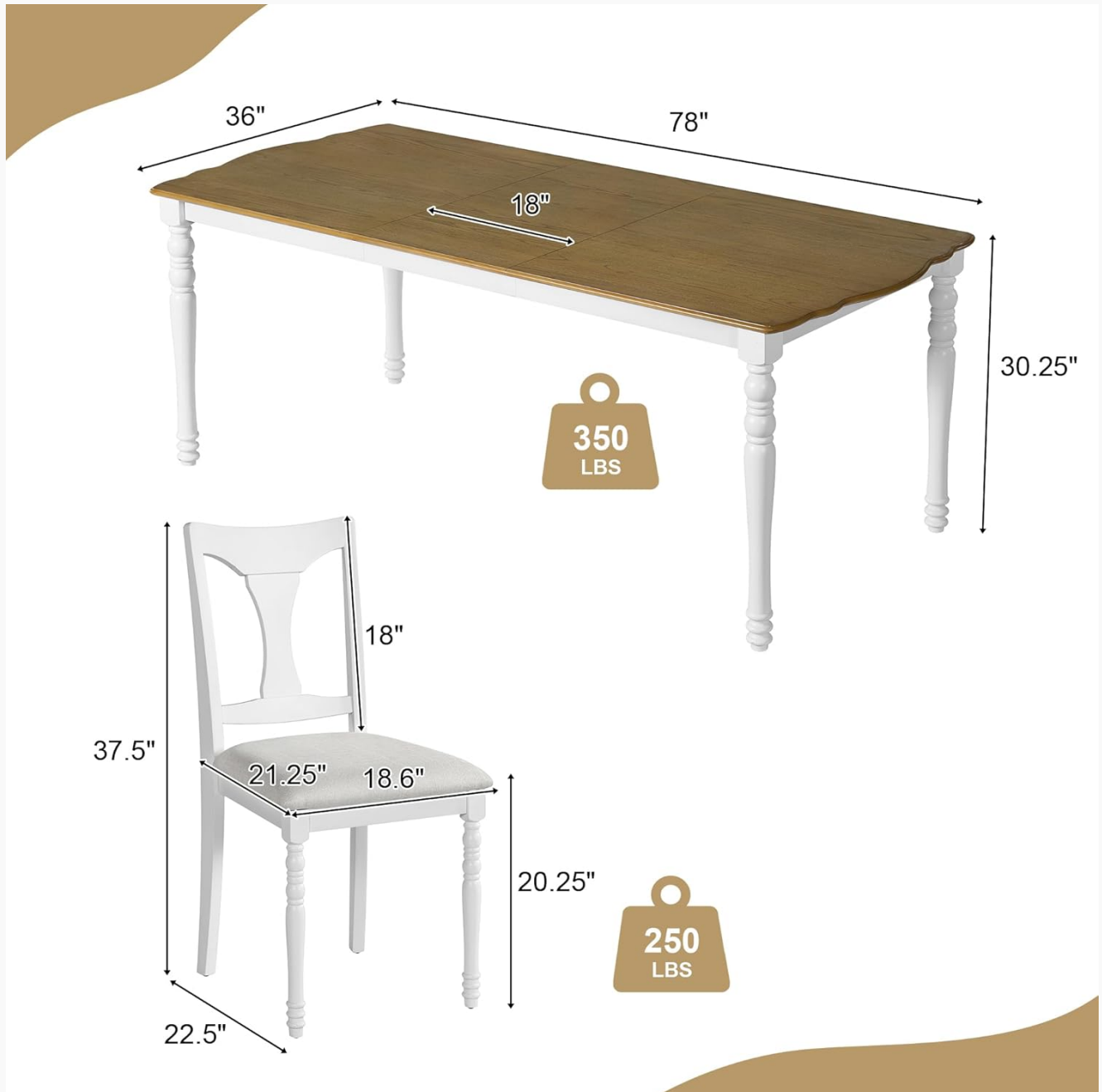
Image: A fully assembled Merax 7-Piece Dining Table Set, ready for use.

For detailed visual guides and specific steps, refer to the included 'Installation Manual'.