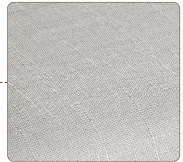
Durable Linen Fabric