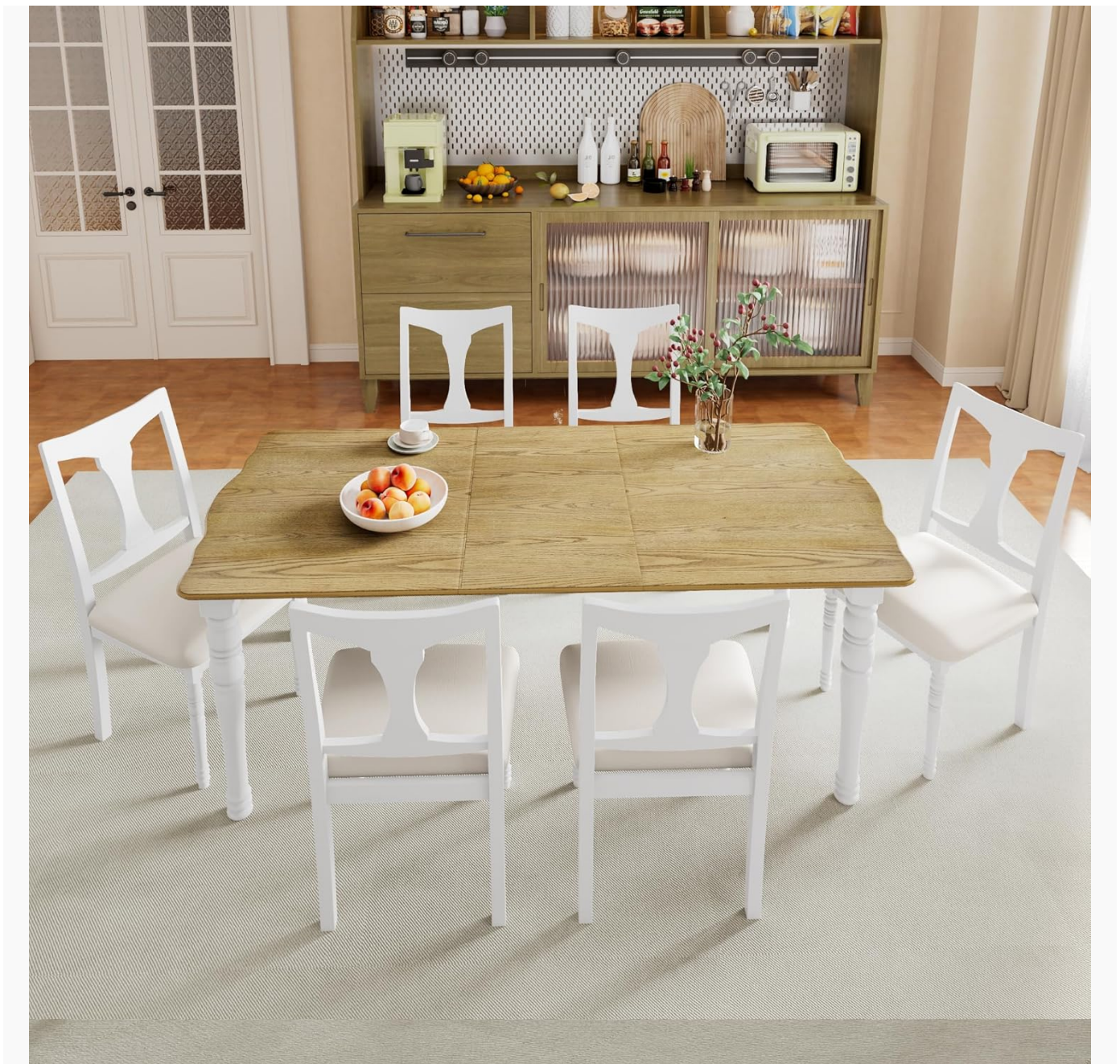
Image: The Merax 7-Piece Dining Table Set showcasing two available color options: Light Brown (Natural+White) and Dovetail Gray (Brown+Black).