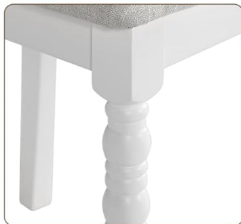
Sturdy Rubberwood Legs