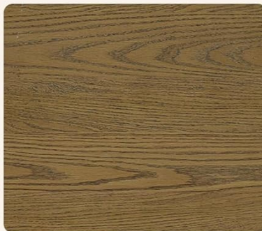
High Quality MDF and OAK-wood Veneer