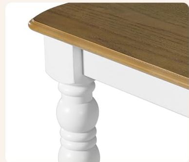
Sturdy Wooden Legs

Image: Detailed diagram showing the dimensions of the dining table (extended) and a single chair, along with their respective weight capacities.