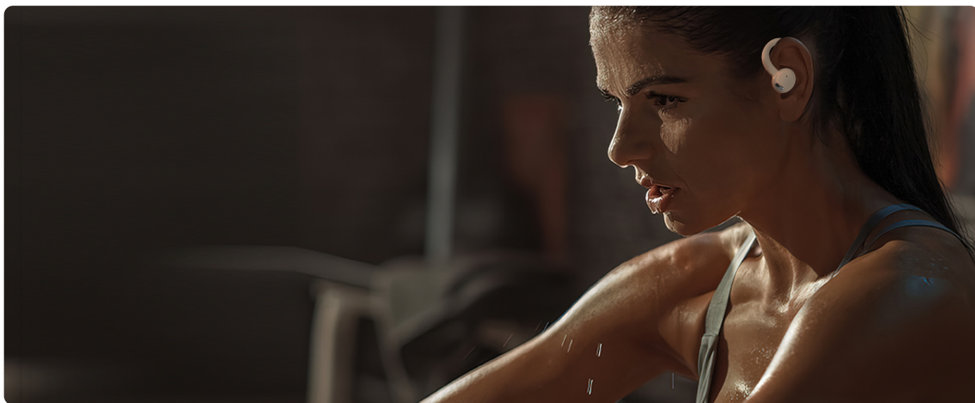
Image: One-step Auto Pairing process.