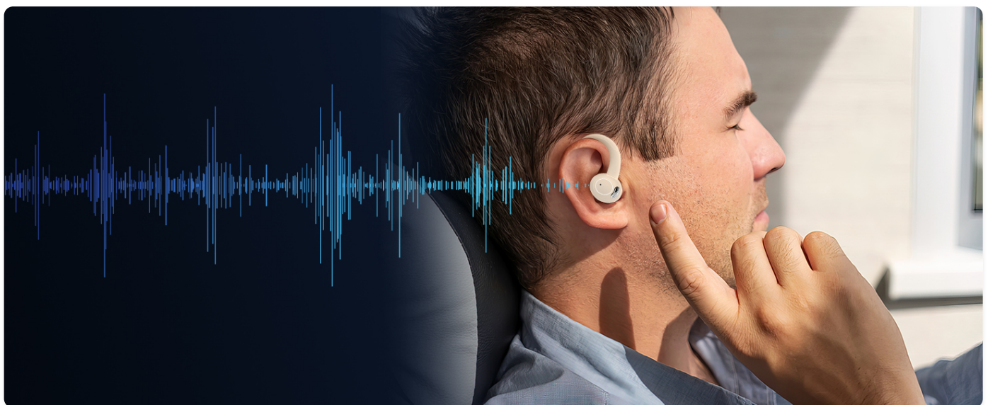
Image: IP7 Dust Resistant and Water Resistant.

The earbuds are IP7 waterproof, meaning they can withstand sweat and rain, making them suitable for workouts and outdoor activities. However, the charging case is not waterproof. Avoid submerging the earbuds in water for extended periods.