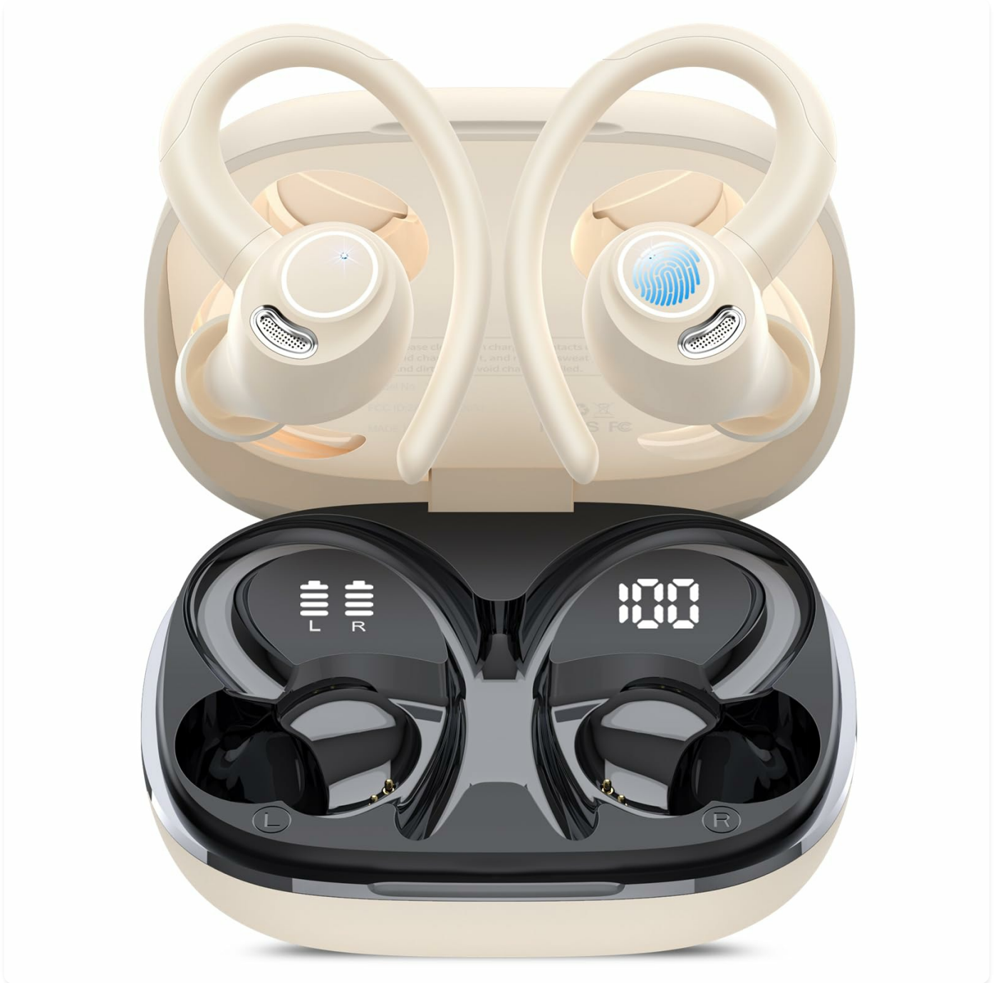
Image: Jesebang YT18 Wireless Earbuds and Charging Case.

The Jesebang YT18 Wireless Earbuds feature a comfortable over-ear design with ear hooks for a secure fit, making them ideal for sports and active lifestyles. The charging case includes a dual LED digital display to show battery levels for both earbuds and the case itself.