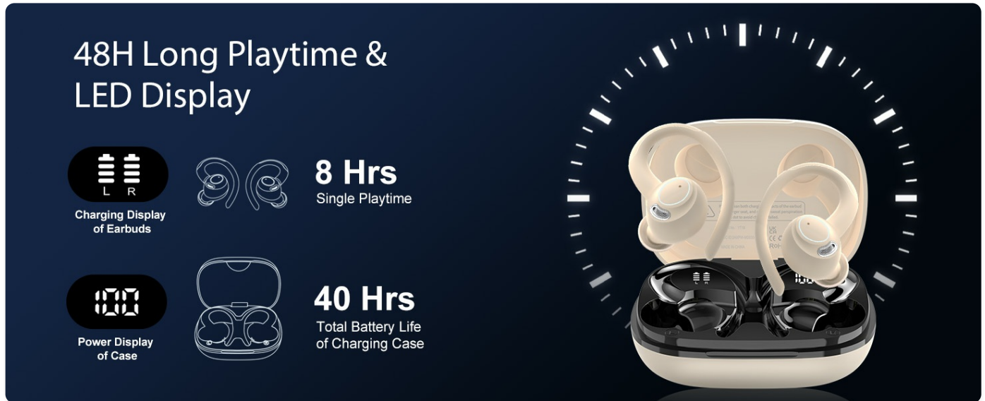
Image: 48H Long Playtime and LED Display.

The charging case features a dual LED display that clearly shows the remaining battery percentage of the charging case and the individual charge status of each earbud (L/R). This allows you to monitor battery levels and avoid unexpected power loss.