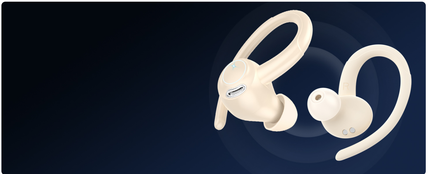
Image: Dual ENC Noise Cancellation Microphones.

Each earbud features 4 ENC noise-canceling microphones, effectively filtering out over 80% of external noise to ensure clear voice transmission during calls, even in noisy environments.