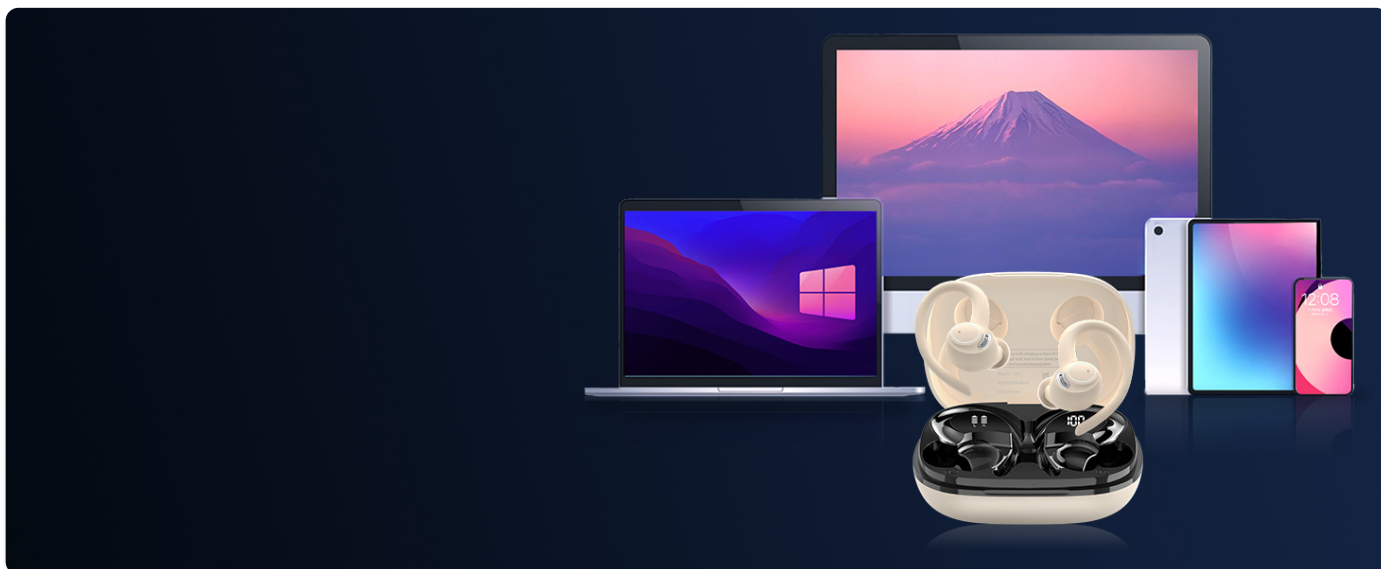
Image: Guide to wearing the earbuds stably.