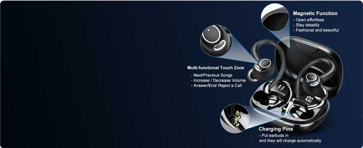
Figure 4.1: Overview of touch control functions.