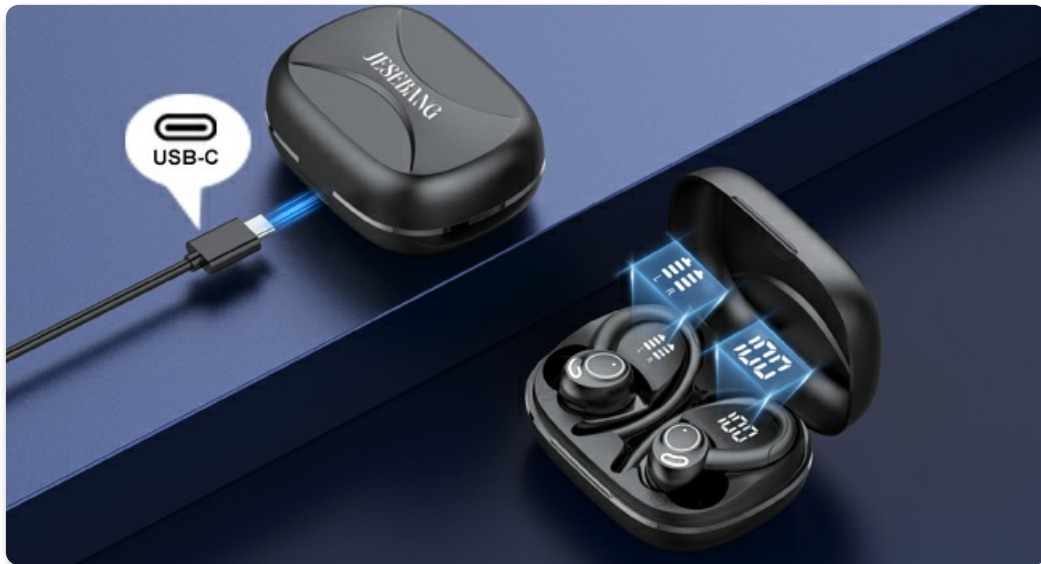
Figure 5.1: Charging the Jesebang YT18 case via USB-C.