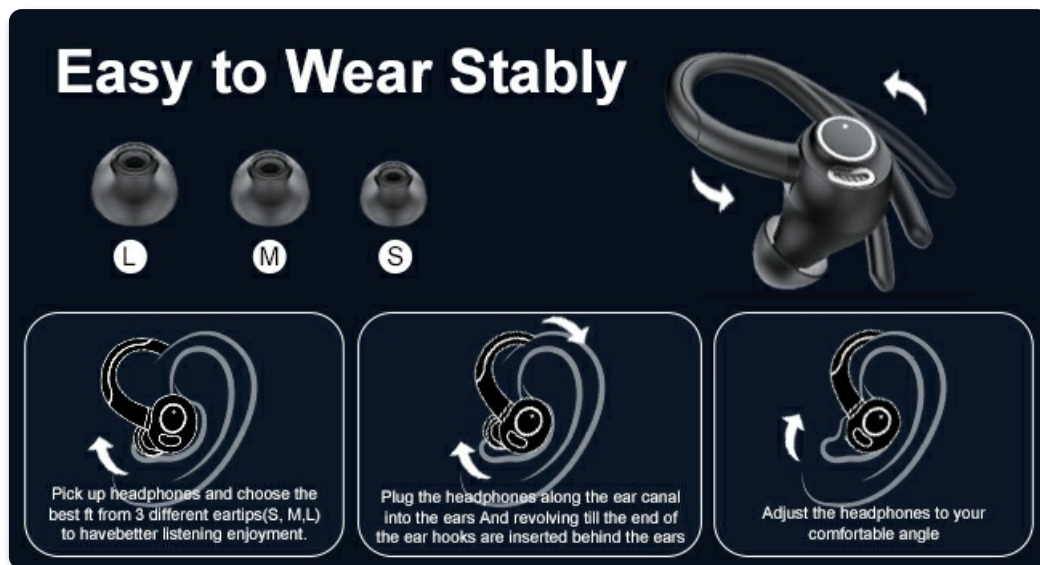
Figure 3.1: Proper fitting of the Jesebang YT18 Earbuds.