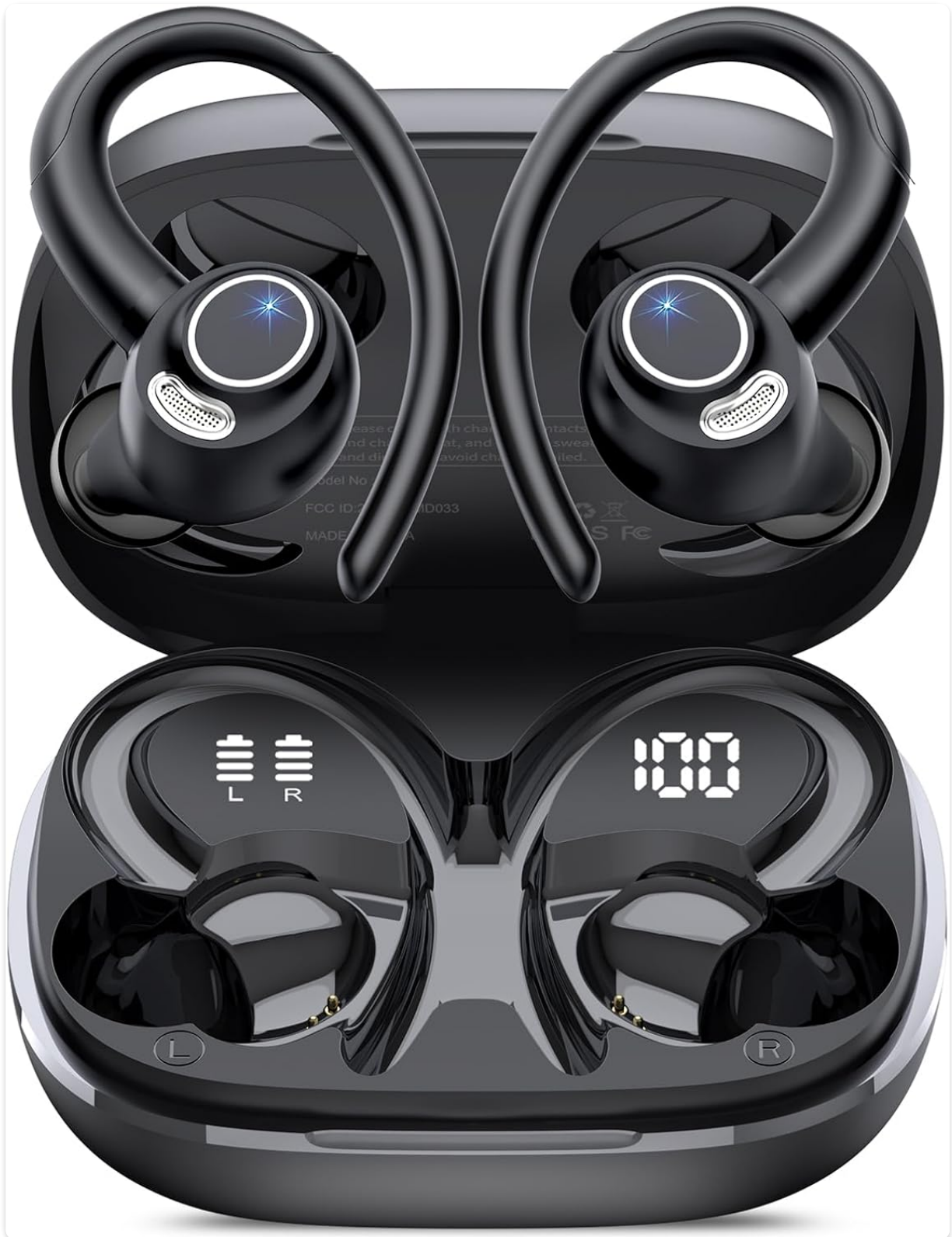
Figure 2.1: Jesebang YT18 Wireless Earbuds and Charging Case.