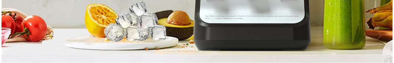
Image: The blender's control panel showing power, speed dial, pulse, and preset functions. Examples of blended items like smoothies, milkshakes, juices, puree, and baby food are displayed above.