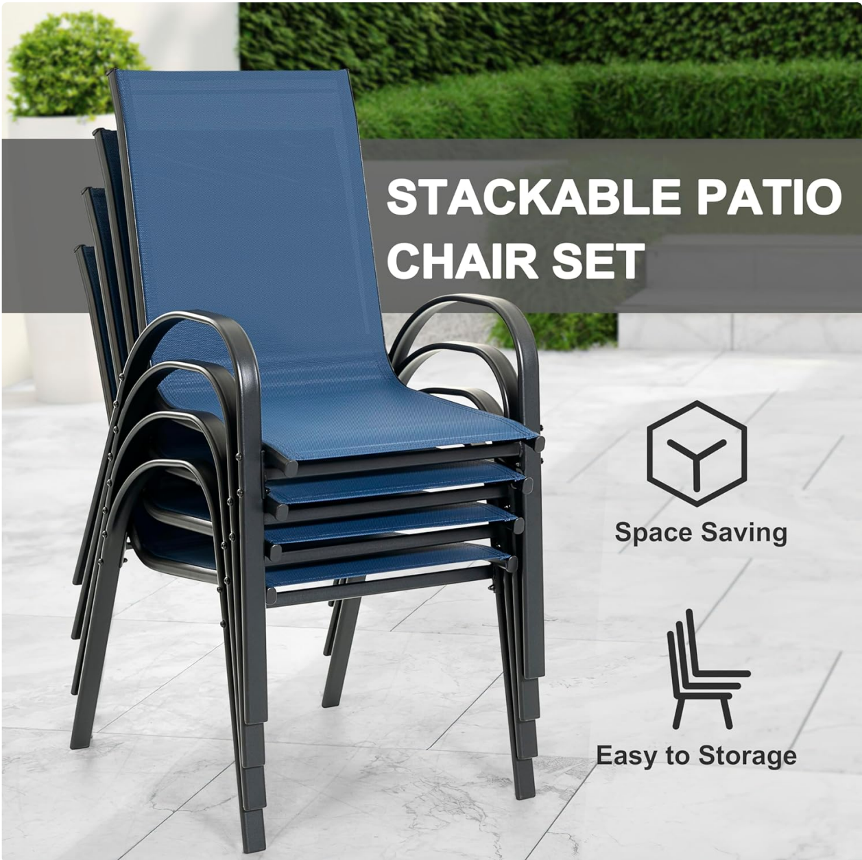
Image: NUU GARDEN DS201-BU patio chairs stacked for space-saving storage.

Your NUU GARDEN patio chairs are designed for comfortable outdoor seating. They are suitable for dining, relaxing, reading, or office use in various outdoor settings such as patios, porches, poolside, or gardens.