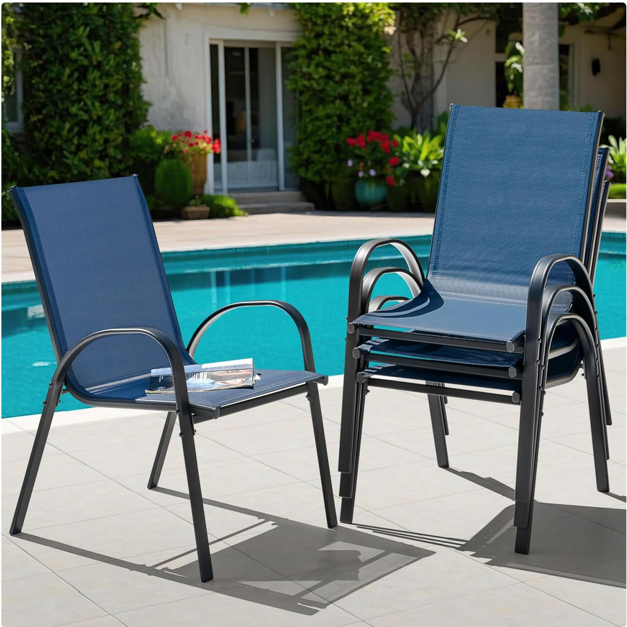
Image: NUU GARDEN DS201-BU Patio Chairs by a pool, showing one assembled chair and a stack of three chairs.