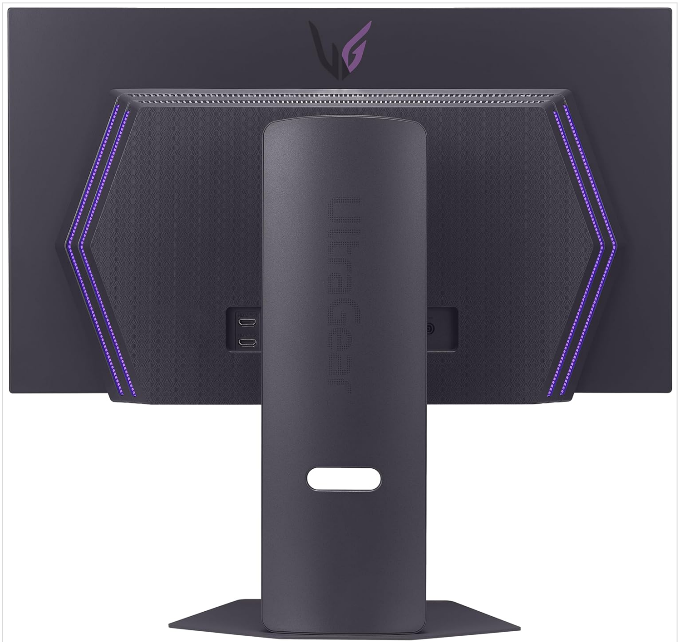
Image: Close-up of the rear input panel of the LG 27GX700A-B monitor, showing HDMI 1, HDMI 2, DisplayPort, and USB 3.0 ports. This illustrates where to connect your video and peripheral devices.