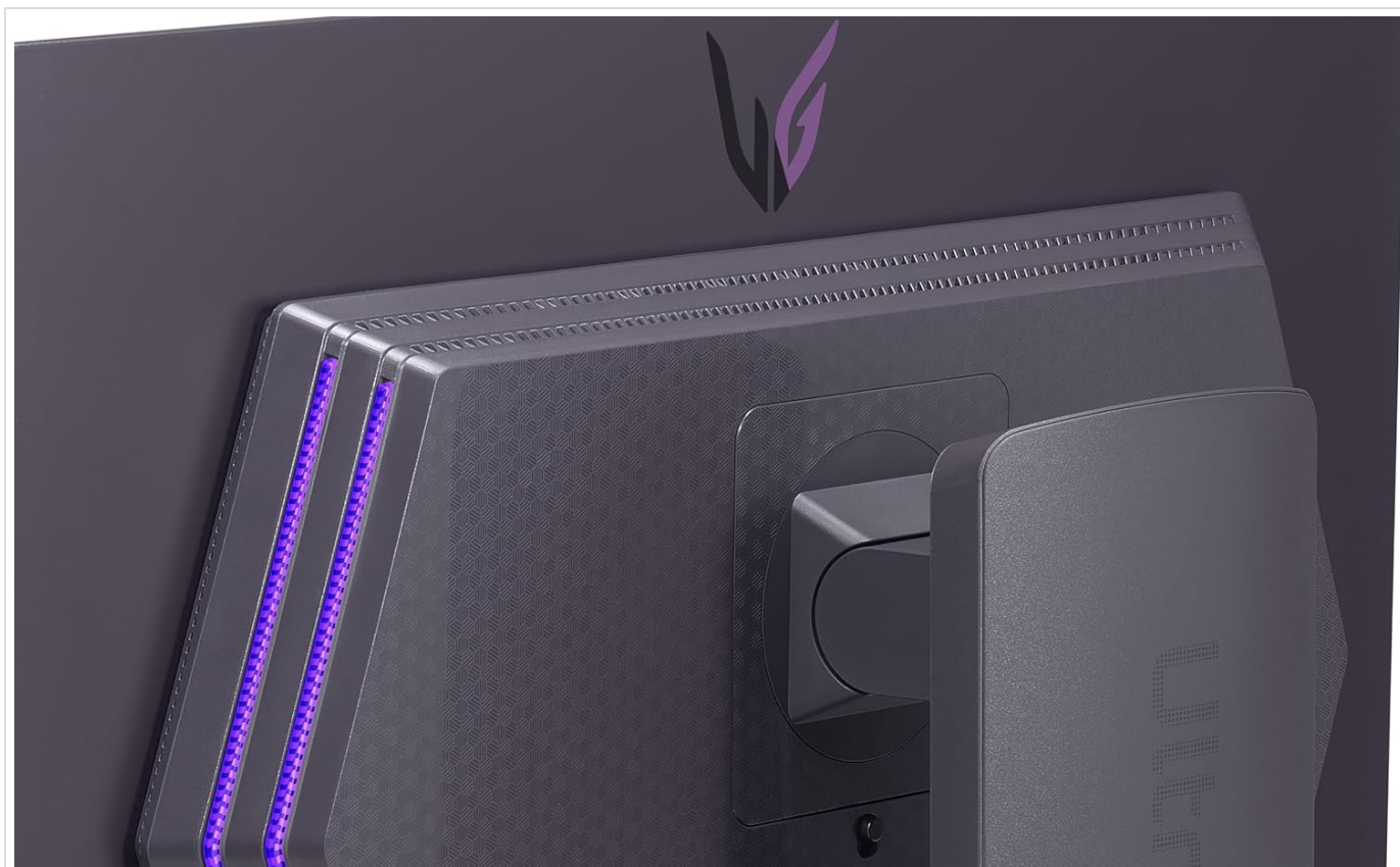
Image: Side view of the LG 27GX700A-B monitor demonstrating its height adjustment capability. The monitor can be moved up or down along the stand for ergonomic positioning.