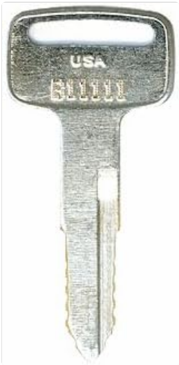
Figure 2.2: Example Replacement Key. This image shows a typical EasyKeys replacement key. Note that the code stamped on the key (e.g., B11111 in this example) should match your required code (B12148 for this product).