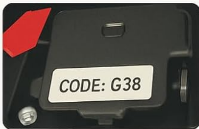
On a Label Inside/ Behind the Lock