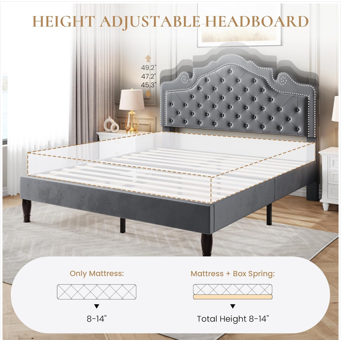
Figure 4: Mattress Compatibility. This image shows that the bed frame is designed for use with a mattress only, typically 8-14 inches thick, and does not require a box spring.