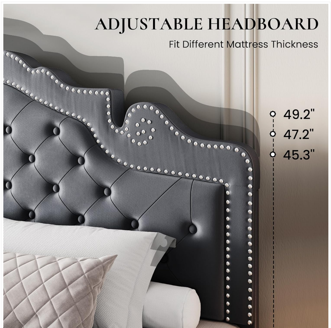
Figure 2: Adjustable Headboard. This image demonstrates how the headboard can be adjusted to different heights (45.3", 47.2", 49.2") to suit various mattress thicknesses, providing customizable comfort and style.