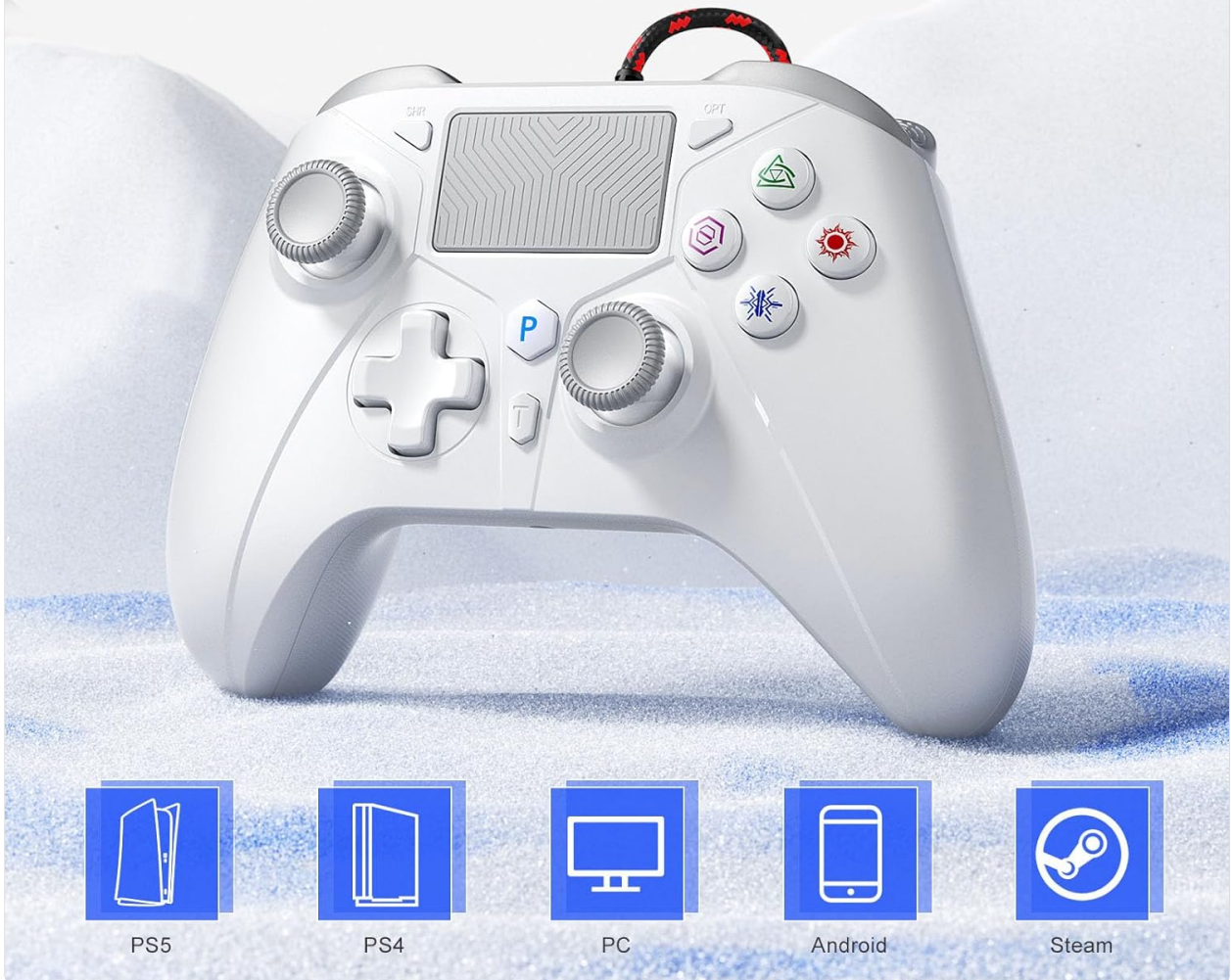
Figure 3.1: The Dinosoo Wired Controller is compatible with multiple platforms including PlayStation 5, PlayStation 4, PC, Android, and Steam, offering broad usability.

No Space Constraint with the 10 ft Cable