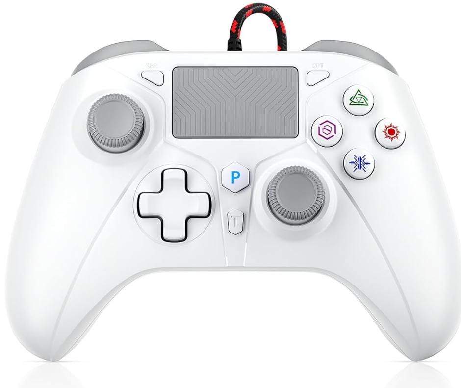
Figure 4.3: The Turbo button (T) and its corresponding mappable buttons (Y, X, B, A, RT, LT, RB, LB) for activating rapid-fire functionality.