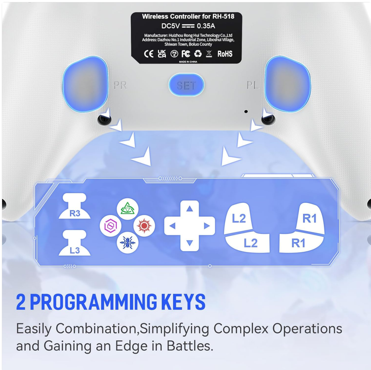
Figure 4.2: Illustration of the two programmable back buttons (PL and PR) and the SET button, designed to simplify complex in-game actions.