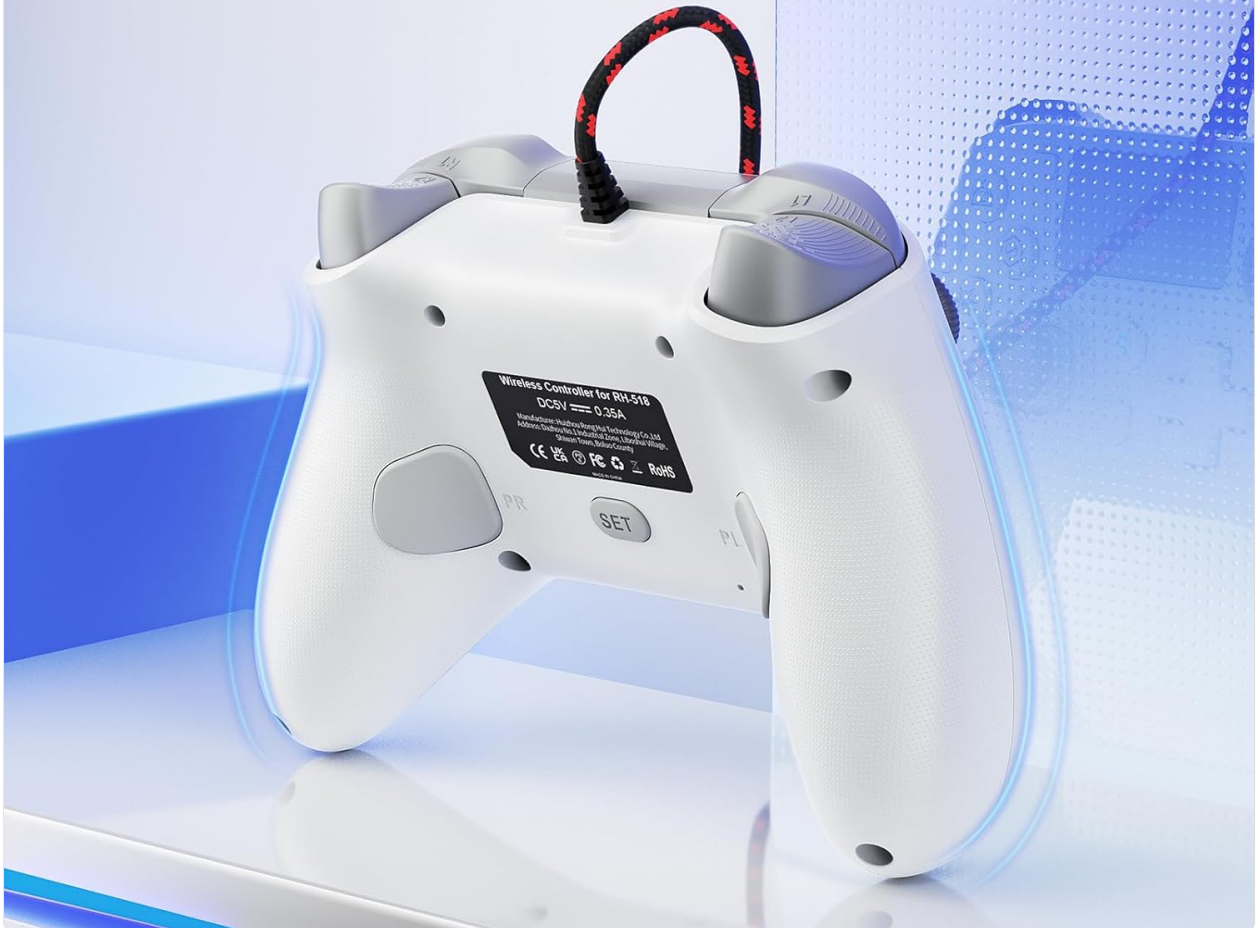
Figure 4.4: Close-up view of the controller's anti-slip grips, designed for enhanced comfort and stability during use.

The controller grips features laser-etched fine carving providing comfortable and sweat-resistant grip.