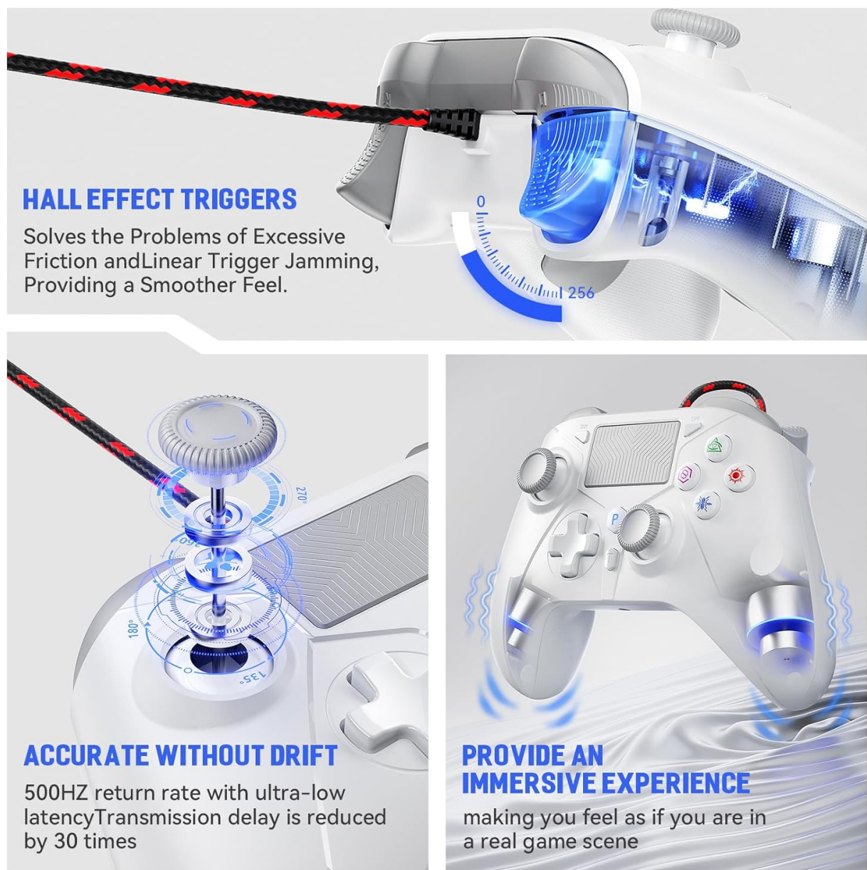
Figure 4.1: Detailed view of the controller's internal mechanisms, showcasing Hall Effect Triggers for smooth action, an accurate joystick designed to prevent drift, and vibration motors for an immersive gaming experience.