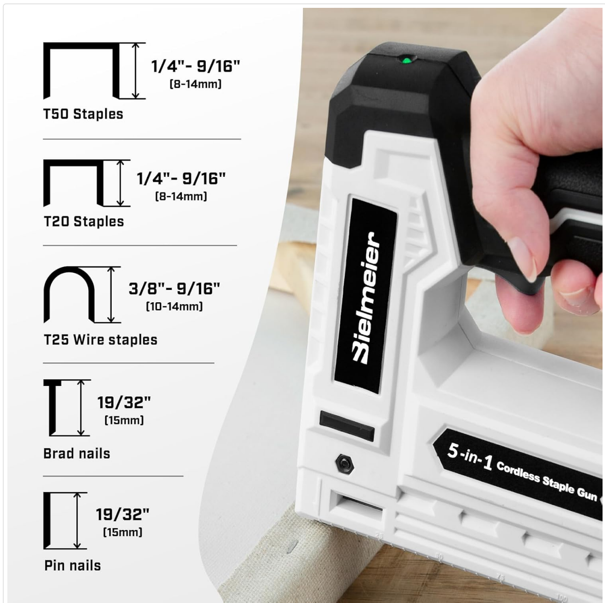
Figure 6.1: Examples of the diverse applications for the 5-in-1 cordless staple gun, from securing fabrics to light woodworking.