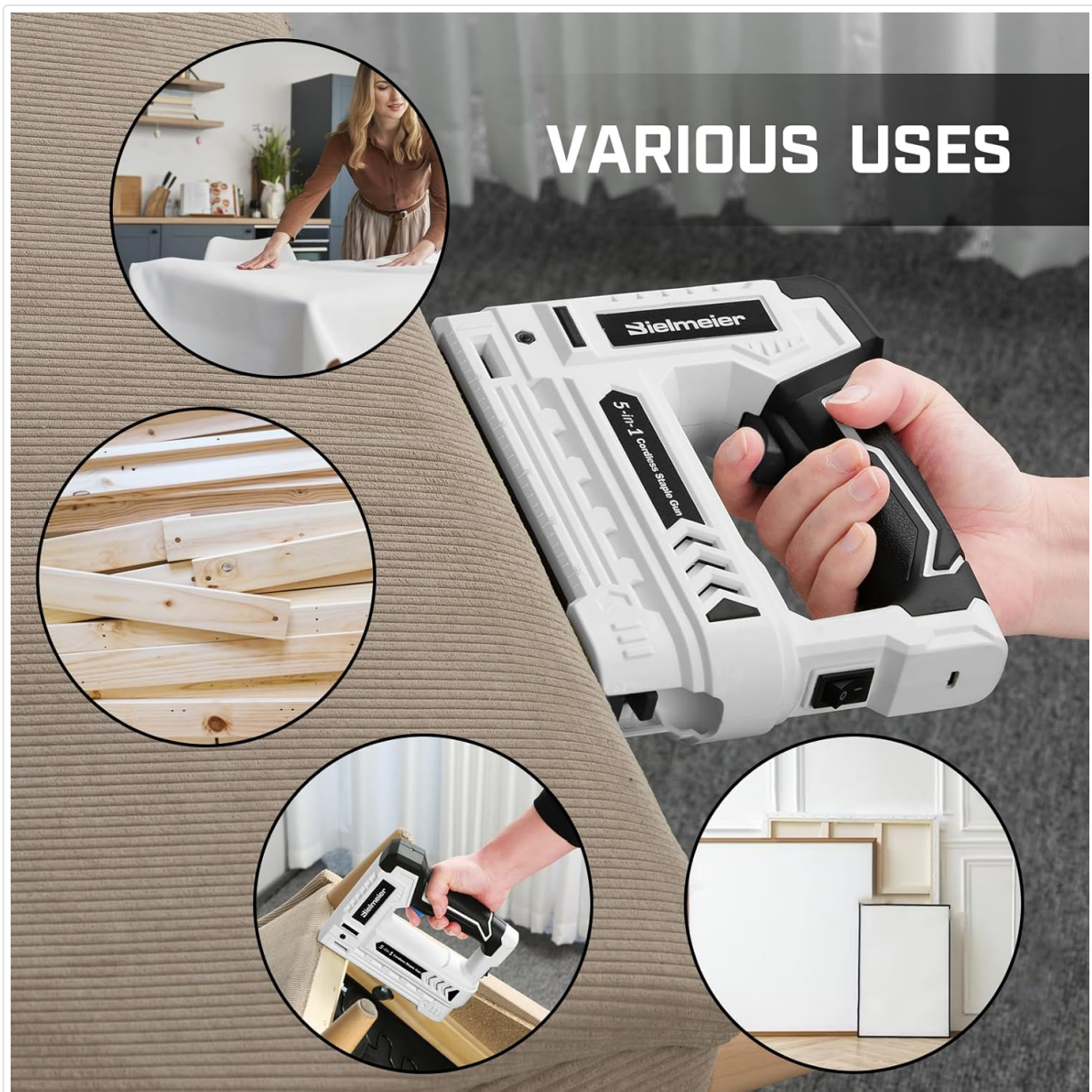
Figure 5.1: The staple gun is capable of delivering up to 1,200 shots on a single full charge, ensuring extended use.