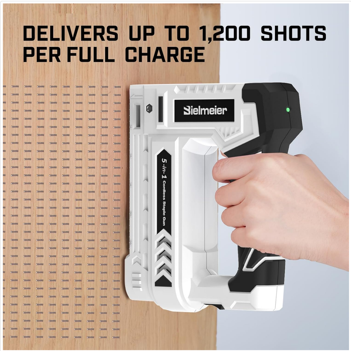
Figure 4.3: Visual representation of the compatible T50, T20, T25 staples, and brad/pin nails with their respective size ranges.

DELIVERS UP TO 1,200 SHOTS PER FULL CHARGE