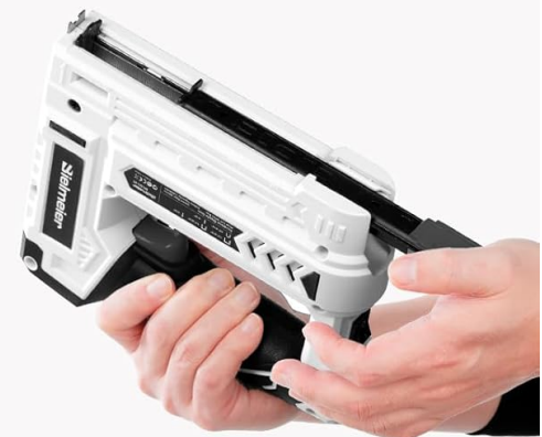
Figure 4.2: Step-by-step guide for loading staples and nails into the magazine of the stapler gun.