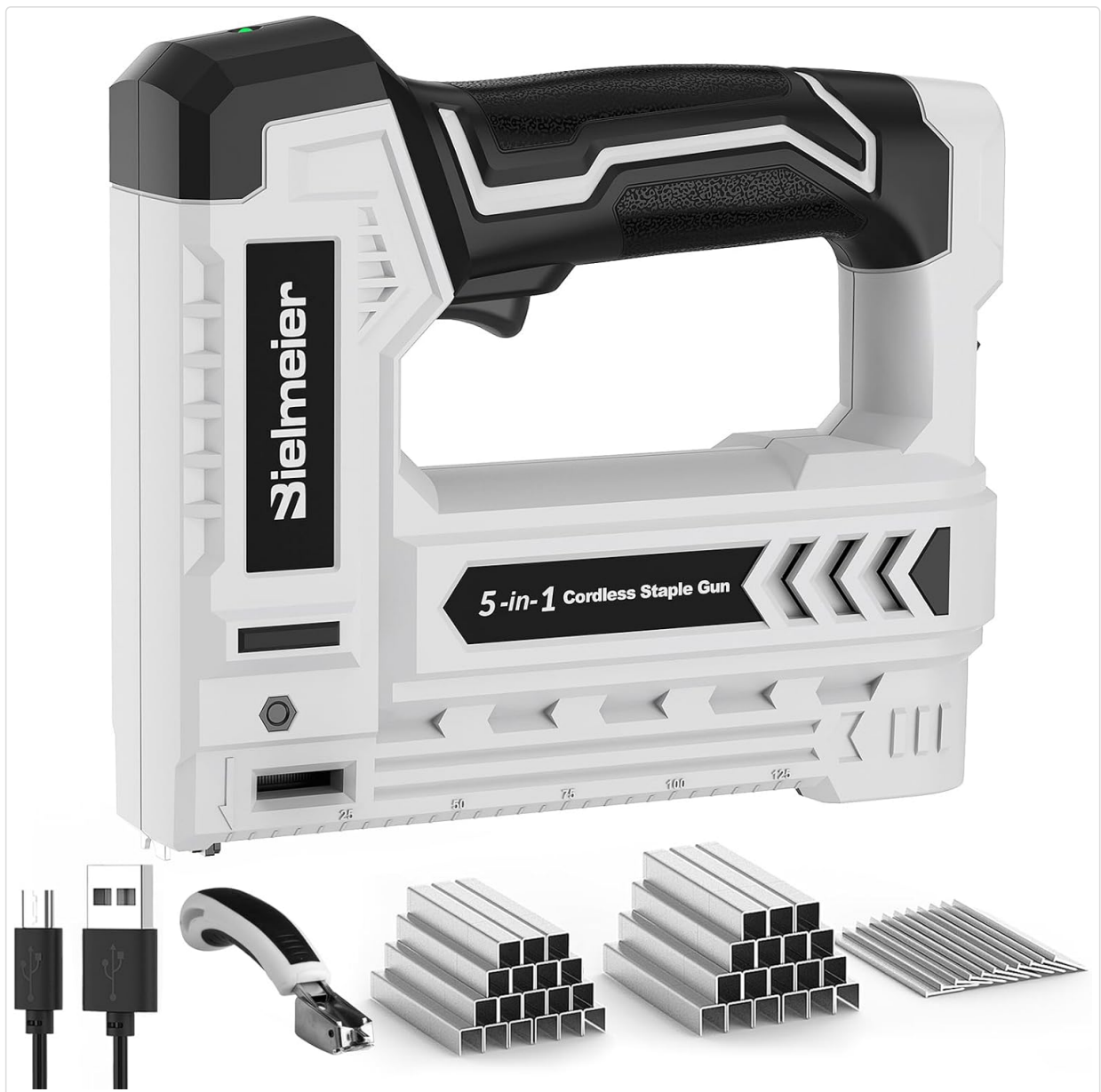
Figure 2.1: Bielmeier Electric Staple Gun with included staples, nails, stapler remover, and USB-C cable.