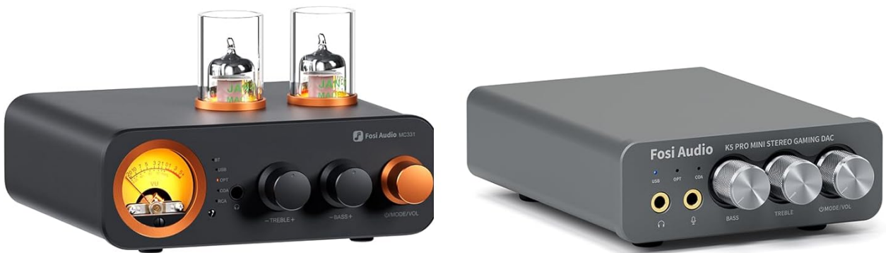
Image: Fosi Audio MC331 Tube Integrated Amplifier and K5 Pro Gaming DAC Headphone Amplifier side-by-side, illustrating their compact designs.