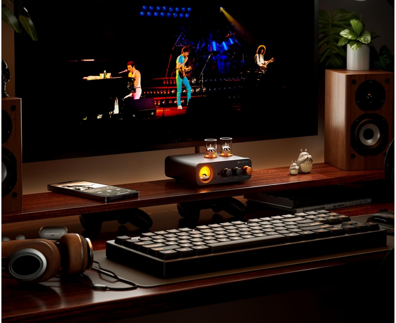
Image: The Fosi Audio MC331 integrated into a typical desktop audio system, demonstrating its compact footprint.

An All-in-One Hybrid DAC Amp to Meet Your Diverse Listening Needs