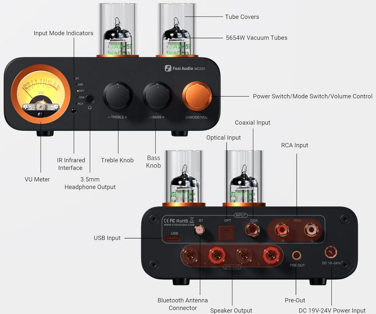
Image: Front and rear panel diagram of the Fosi Audio MC331, indicating controls and connection points.

Supporting Bluetooth/USB/Coaxial/Optical/RCA Connectivity