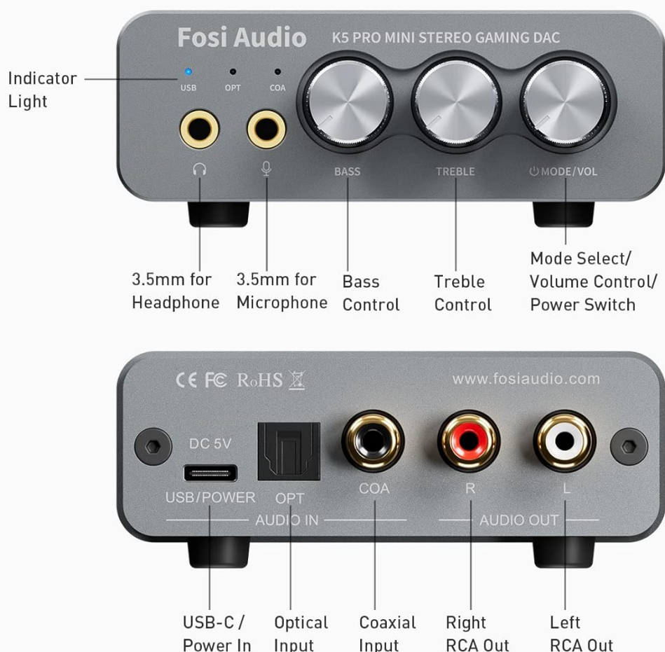
Image: Front and rear panel diagram of the Fosi Audio K5 Pro, indicating controls and connection points.

Practical and Exuding Elegance with High-performance