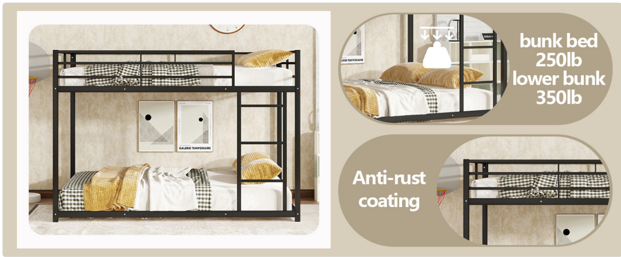
Figure 5.3: Weight Capacity and Anti-Rust Coating