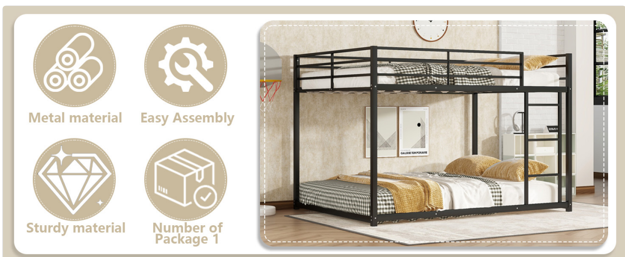
Figure 3.1: Key Product Attributes