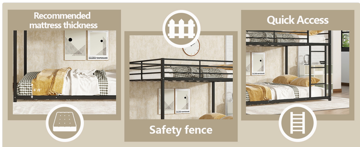
Figure 5.2: Mattress Thickness and Safety Fence Details