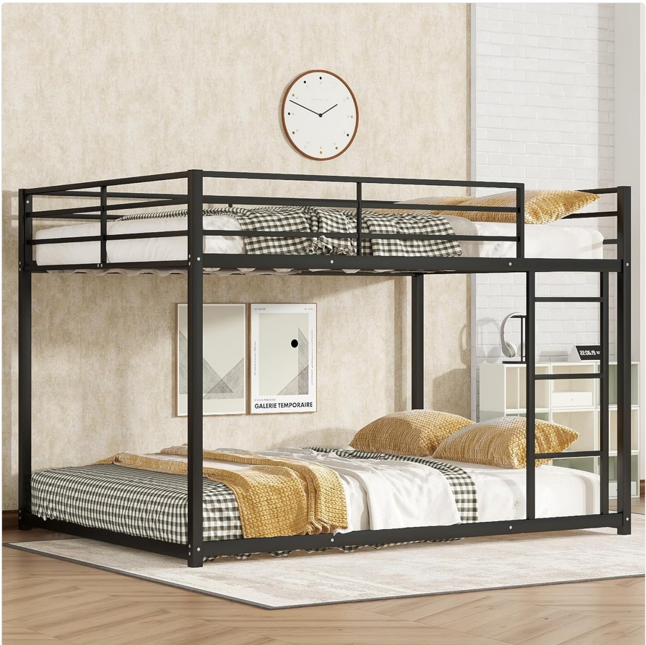
Figure 1.1: Assembled Bellemave Full Over Full Bunk Bed (Black Ladder)

The Bellemave Full Over Full Bunk Bed is constructed with heavy-duty, rust-resistant metal, ensuring long-lasting durability and stability. It includes a built-in ladder and high guardrails for enhanced safety.