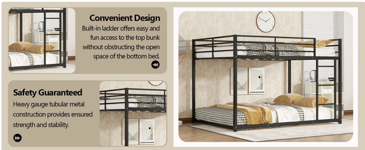
Figure 2.1: Convenient Design and Safety Features

This product is CPC-certified, indicating it meets specific safety standards for children's products.