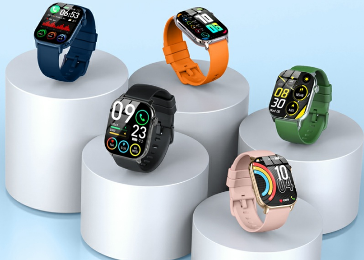
Image: The Jugeman P99 Smart Watch highlighting its 1.96-inch full touch screen, demonstrating its large display for clear message reading and app control.

1.96" Large Screen: Read messages clearly, swipe notifications effortlessly, and enjoy app controls with enhanced visibility. Perfect for quick glances and precise interactions.