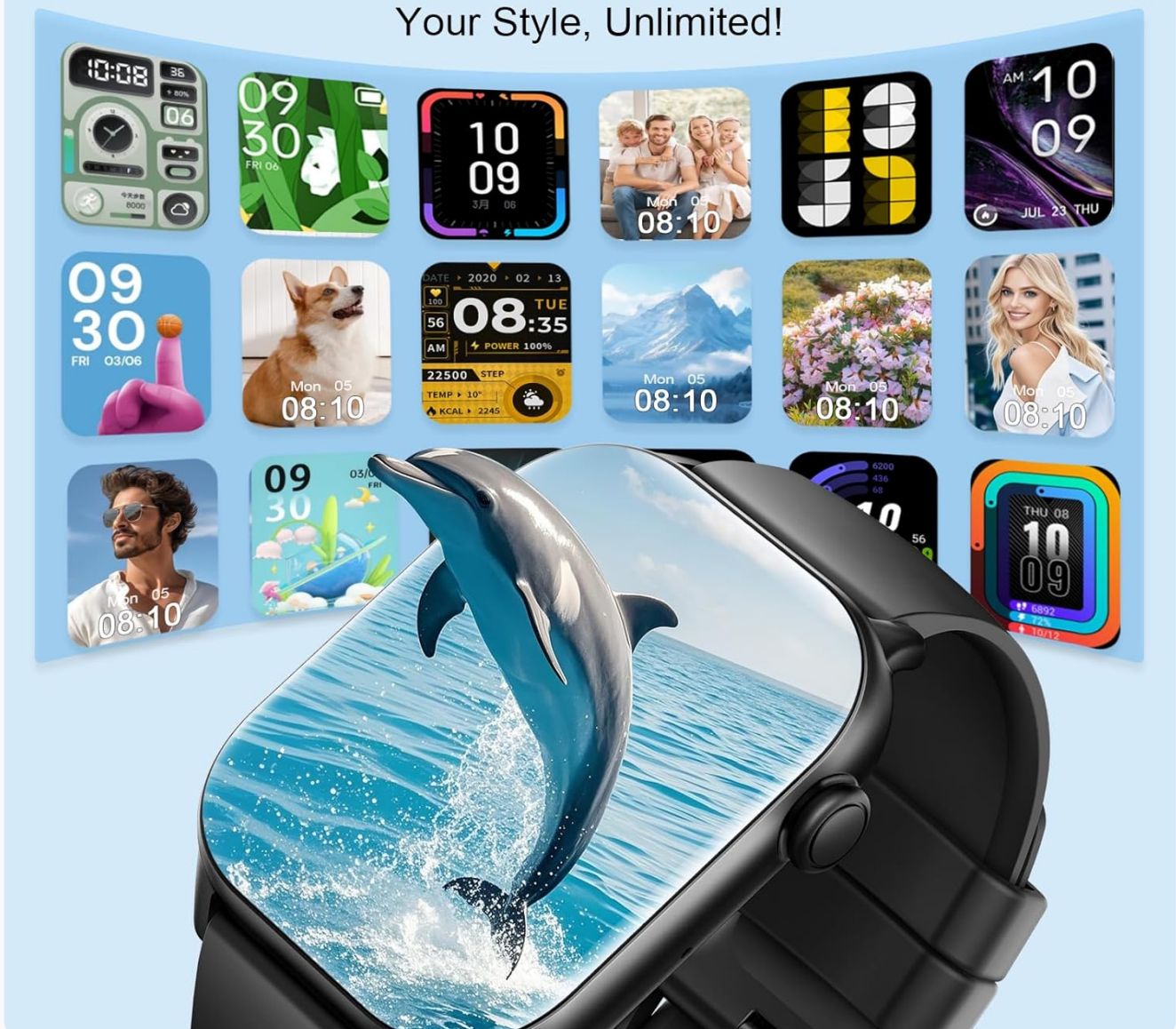
Image: A collage of different watch faces available for the Jugeman P99 Smart Watch, showcasing the 1.96-inch vibrant screen and over 250 customization options.