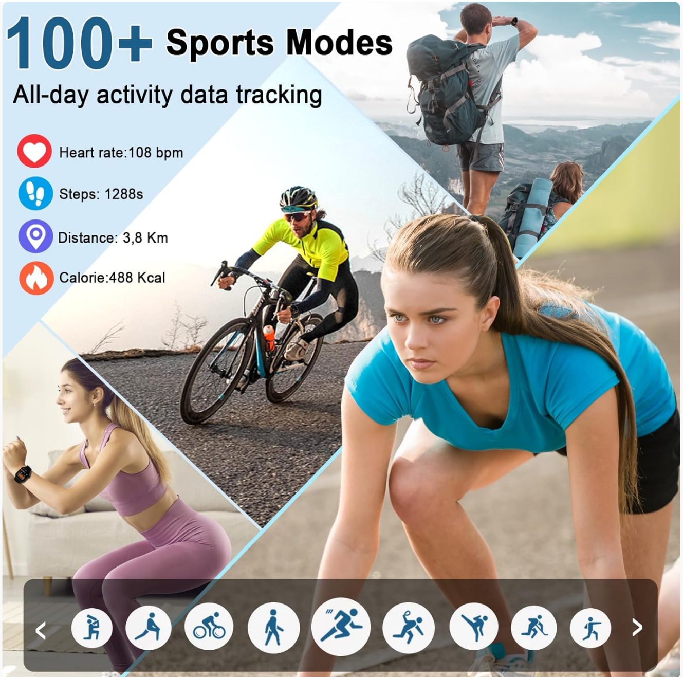
Image: A dynamic image showing individuals engaged in various sports, with the Jugeman P99 Smart Watch displaying activity data such as heart rate (108 bpm), steps (1288s), distance (3.8 Km), and calories (488 Kcal), highlighting its 100+ sports modes.