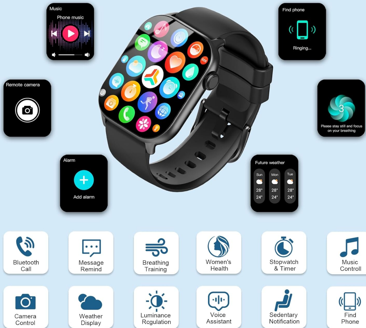
Image: The Jugeman P99 Smart Watch showcasing its multifunctional capabilities, including music control, phone finding, remote camera operation, alarm setting, and weather display.

Track Health, Master Workouts, Stay Connected — All-in-One Smart Companion!