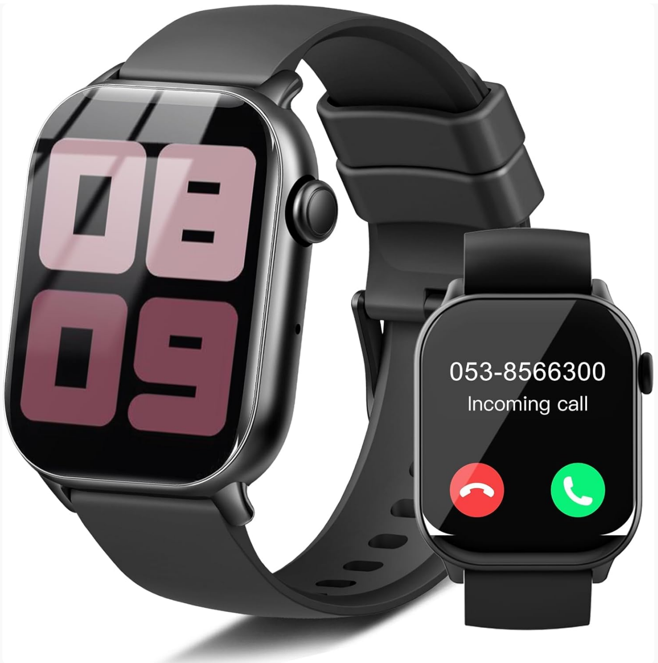
Image: The Jugeman P99 Smart Watch in black, showing the time and an incoming call notification on its display.