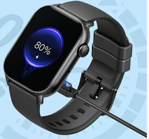
Image: The Jugeman P99 Smart Watch being charged via its magnetic USB cable, with the screen showing an 80% battery level and charging icon.