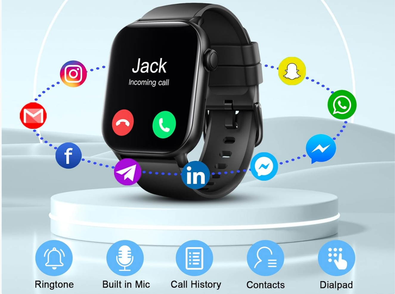
Image: The Jugeman P99 Smart Watch displaying an incoming call and surrounded by icons representing various social media and messaging apps, indicating its Bluetooth call and notification capabilities.