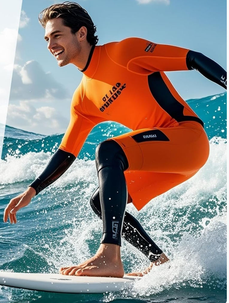
Image: A person surfing, with the Jugeman P99 Smart Watch highlighted, emphasizing its IP68 waterproof rating for activities like rain, bathing (hand washing), and sweating.