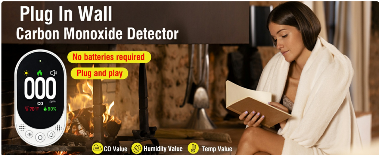
Image 2: The VETOUCH L6068 detector plugged into a wall outlet, ready for use.

The VETOUCH L6068 detector is designed for easy setup. Simply plug the device into any standard AC outlet (110V-220V). The device will automatically power on and begin monitoring. Ensure the outlet is not obstructed and allows for proper air circulation around the detector.