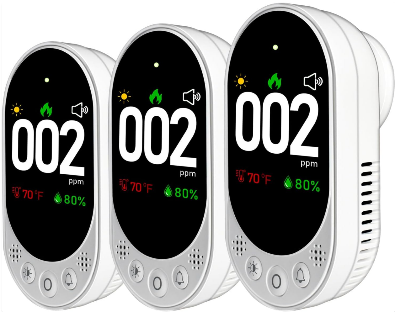
Image 1: The VETOUGH L6068 Plug-in Carbon Monoxide Detector, showing its compact design and digital display.