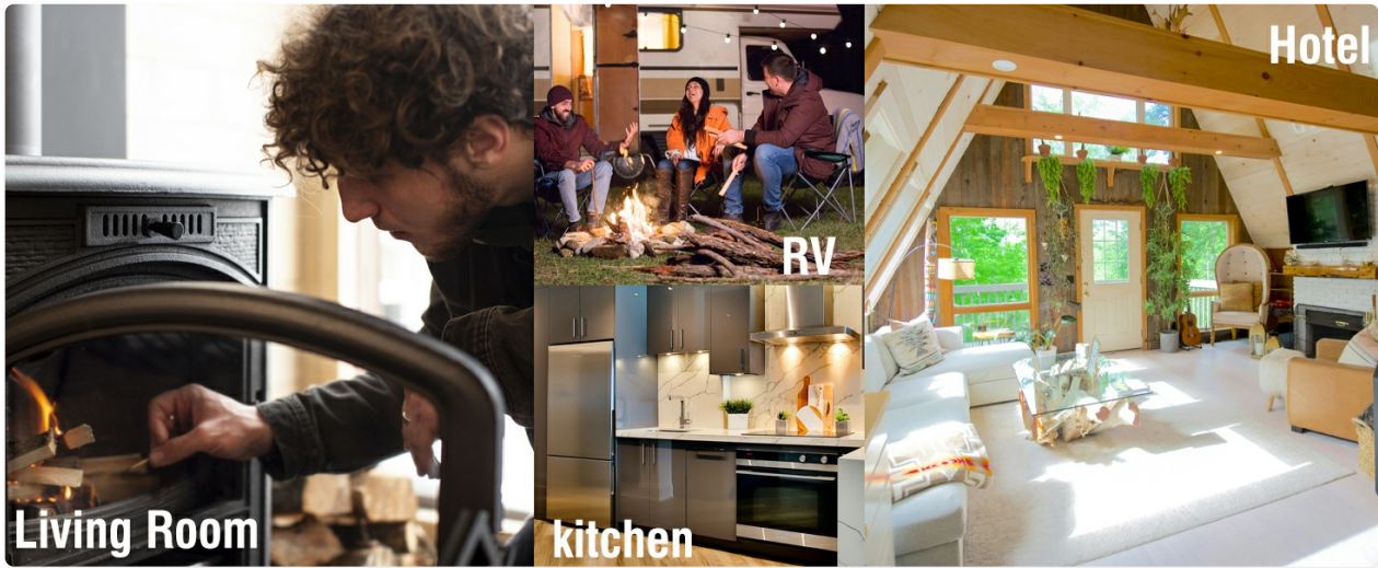
Image 5: The detector shown in various settings like a living room, kitchen, RV, and hotel room.

The VETOUCH L6068 is versatile and suitable for various environments where carbon monoxide monitoring is crucial.