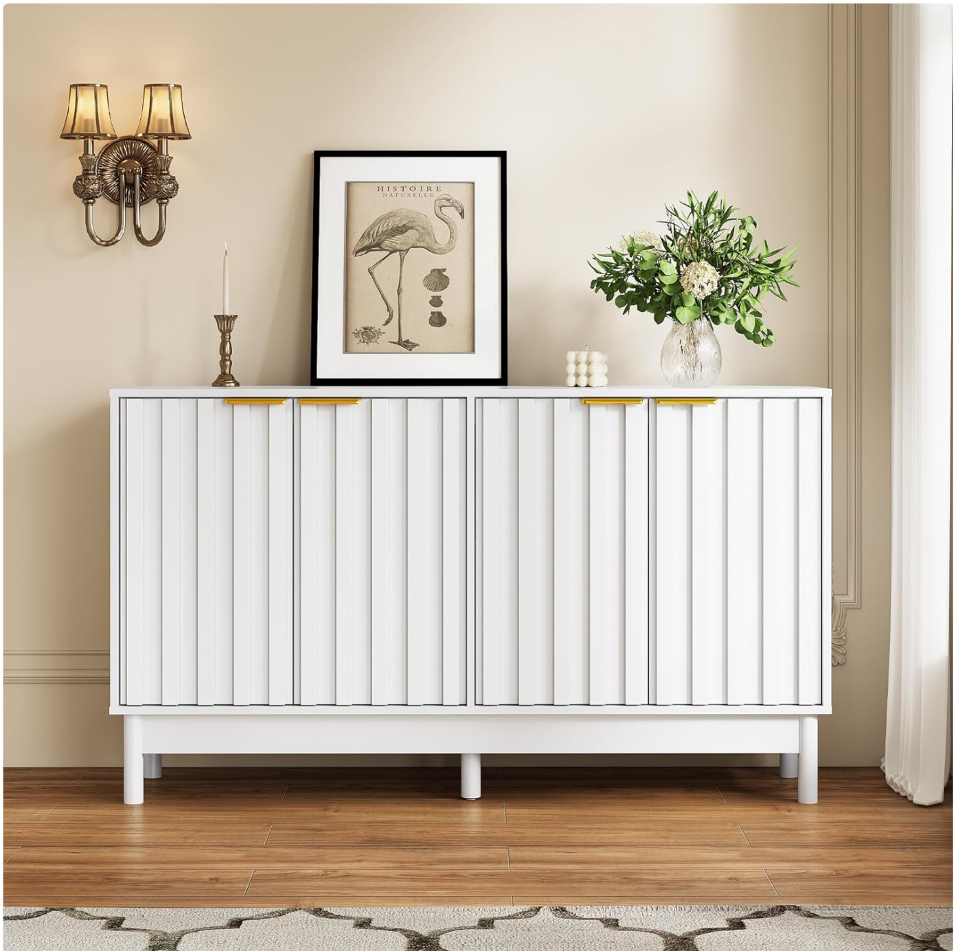
Image: The RoyalCraft 50-inch white buffet cabinet, showcasing its elegant design and fluted doors, positioned in a modern living space.