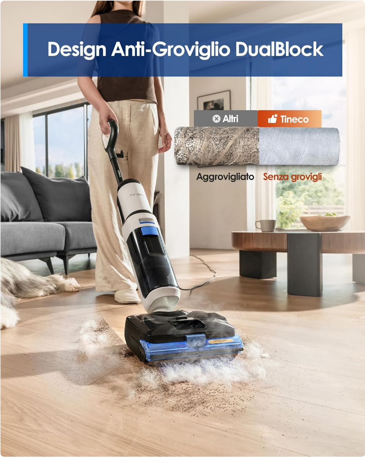
Image: Illustration of the DualBlock Anti-Tangle Design, showing how it prevents hair from wrapping around the brush roller.