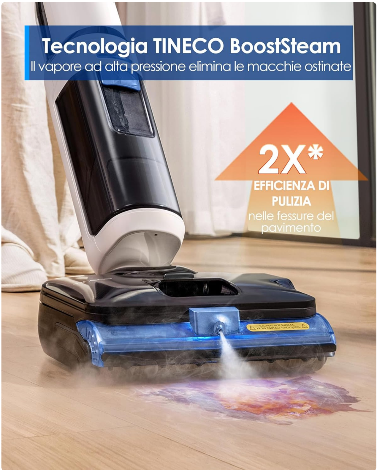
Image: Tineco BoostSteam Technology in action, showing steam being applied to a dirty floor.