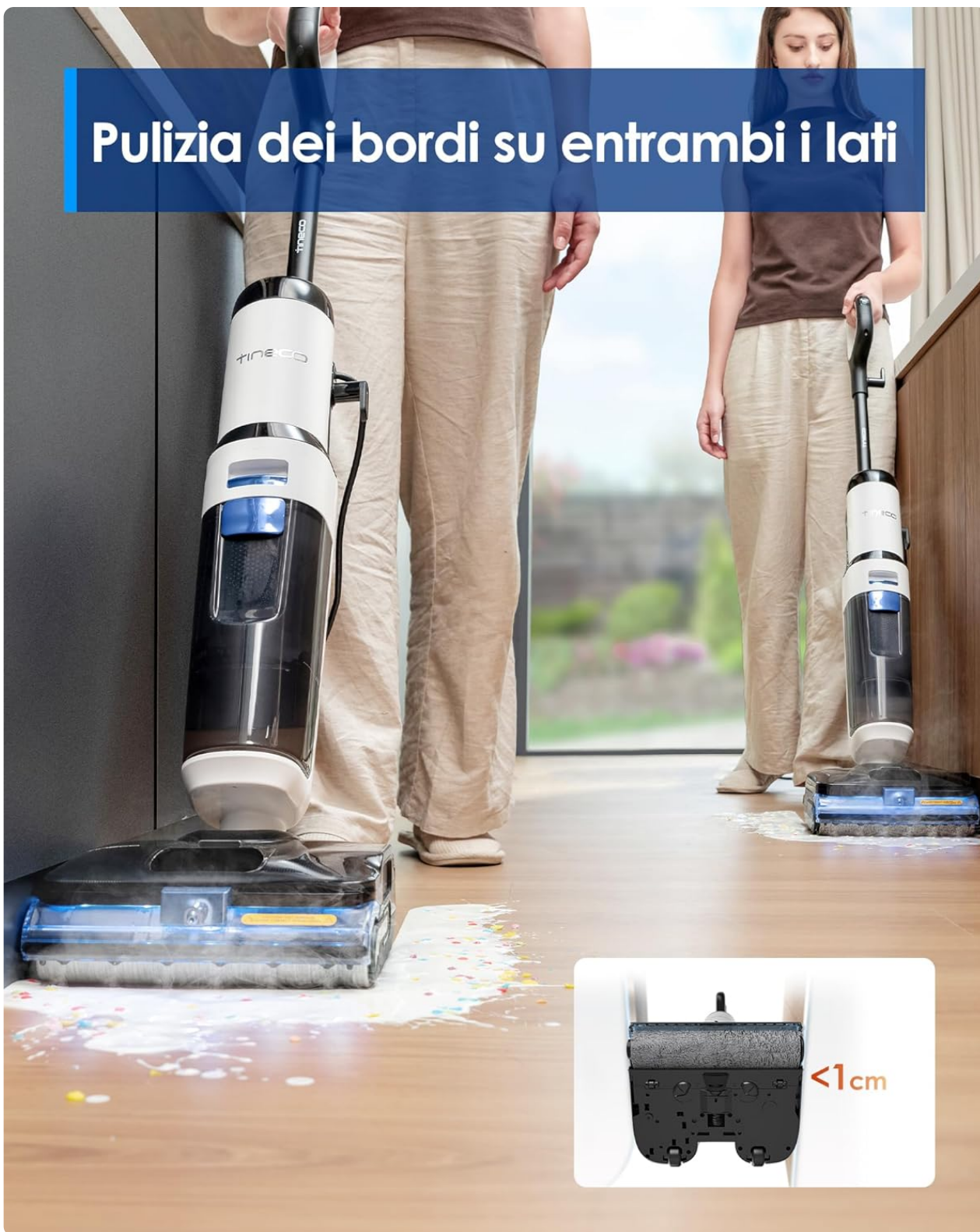
Image: The appliance demonstrating its ability to clean close to edges and baseboards.