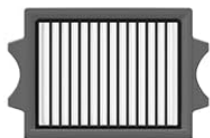
Filtro a secco