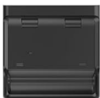
Vassoio di stoccaggio