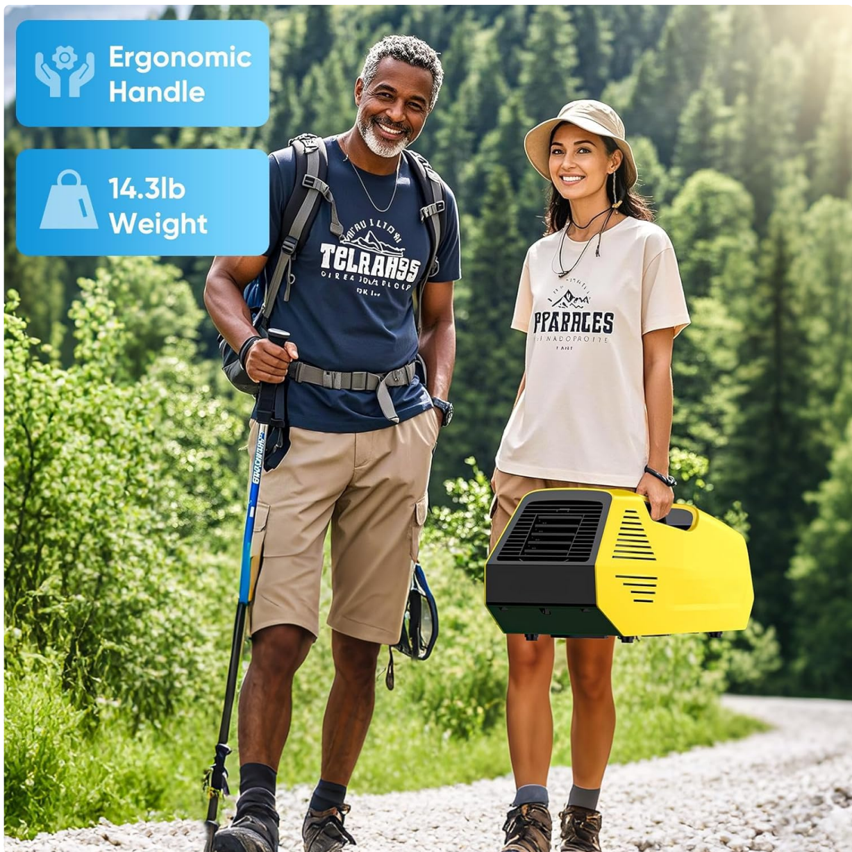
Image 1.2: The unit features an ergonomic handle and weighs approximately 14.3 lbs, making it easy to transport for outdoor activities.