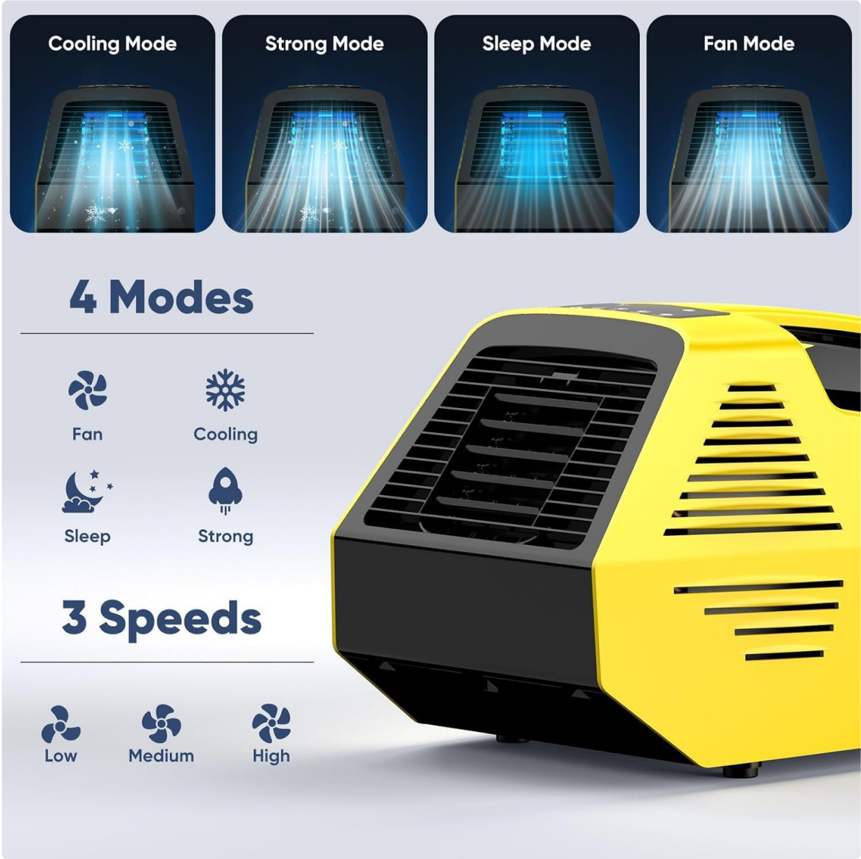
Image 5.1: Overview of the four operational modes and three fan speed settings.

The air outlet vent can be adjusted from 30° to 120° to direct the cool air as needed.