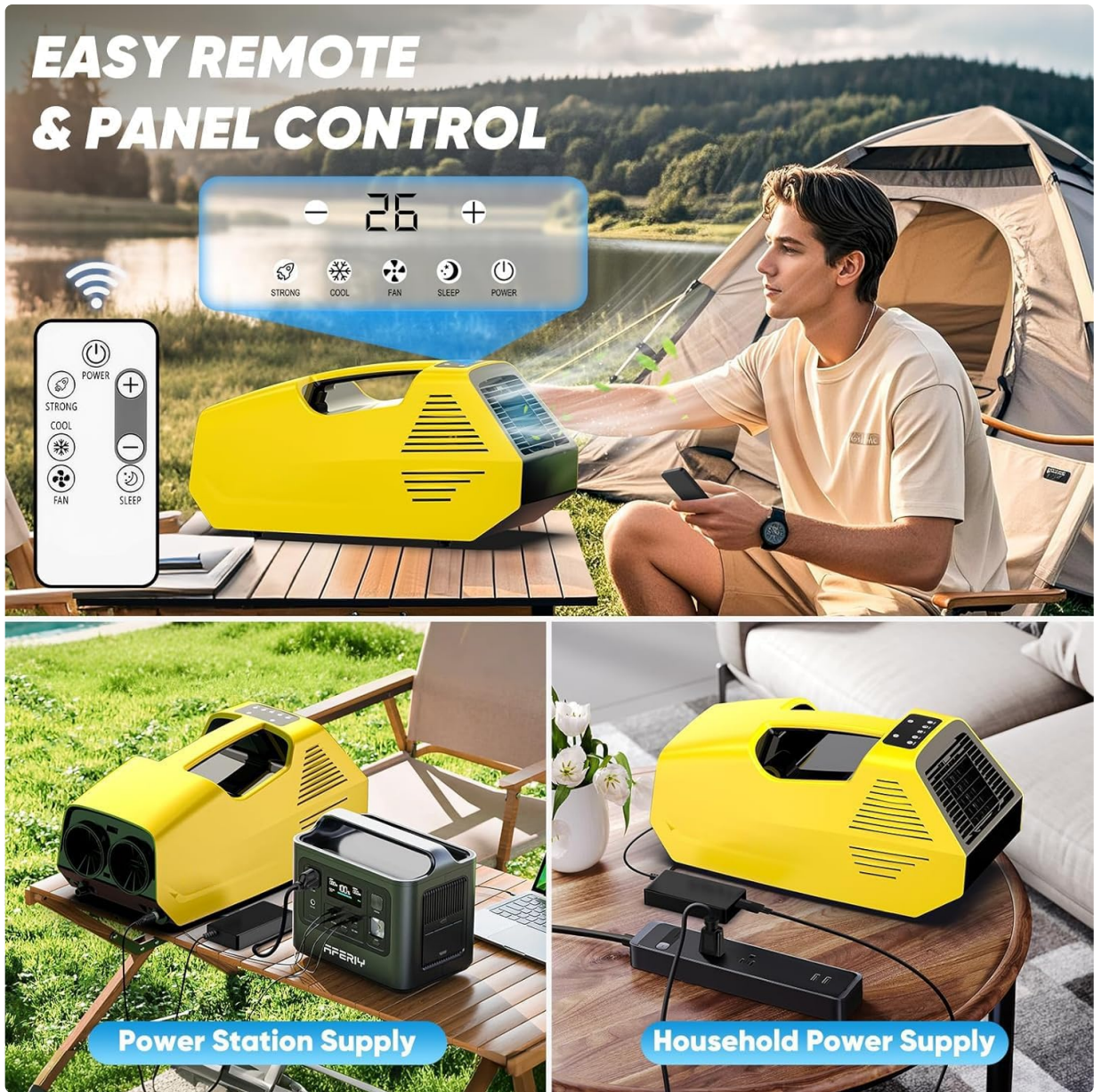
Image 4.1: The unit can be powered by a power station or a standard household outlet, offering versatility for different environments.