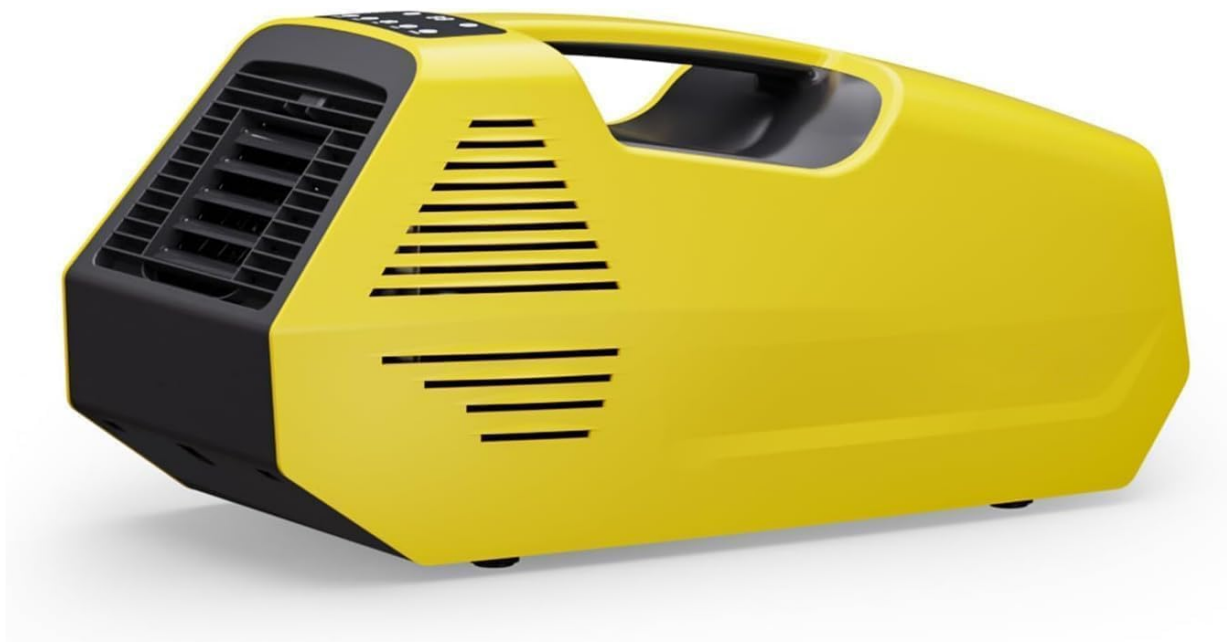
Image 1.1: The EnjoyCool Portable Air Conditioner Model CO7H001, showcasing its compact design and integrated handle.

This manual provides essential information for the safe and effective use of your portable air conditioner. Please read it thoroughly before operation and retain it for future reference.