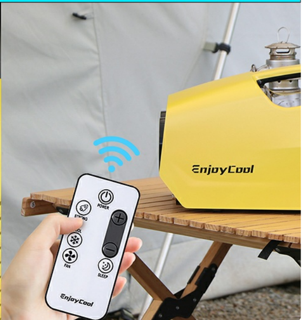
Image 5.3: Customize your comfort with various modes and temperature settings.