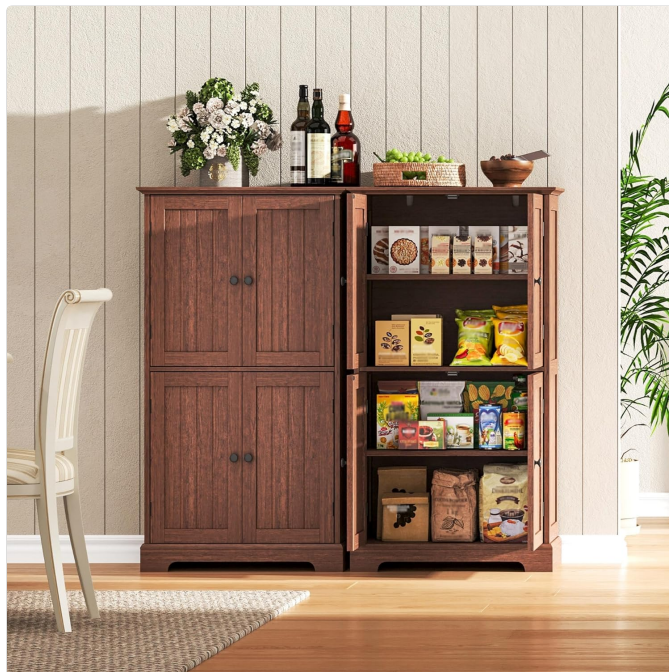
Image: The cabinet with its doors open, demonstrating its ample storage capacity for various household items.