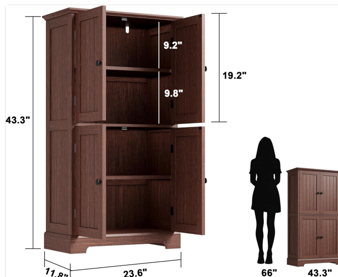
Image: Dimensional diagram of the cabinet, illustrating its height, width, and depth, along with internal shelf spacing.