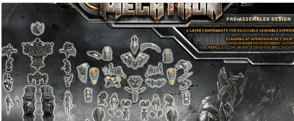
Image 4.1: Exploded view of Megatron's components, highlighting the pre-assembled design.

Once individual components are ready, attach the assembled arms and legs to the main body. Refer to the video (approx. 1:52) for connecting these major sections. Ensure all joints are securely fitted while maintaining articulation.