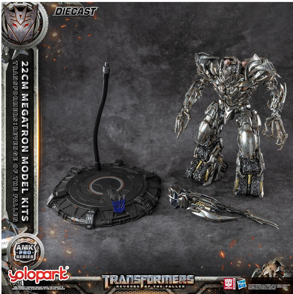
Image 3.1: Megatron figure with included accessories and display base.