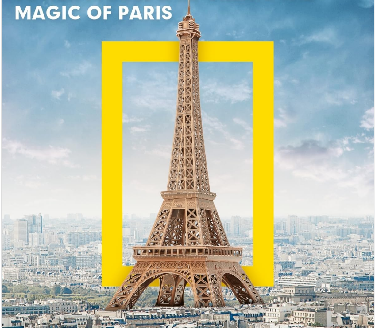
Image 4.1: The completed Eiffel Tower 3D puzzle model, suitable for display.