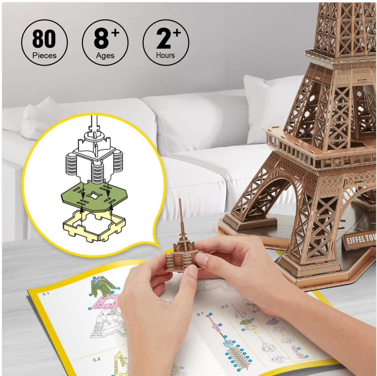
Image 3.1: An illustration demonstrating the interlocking mechanism and step-by-step assembly process for the 3D puzzle components.