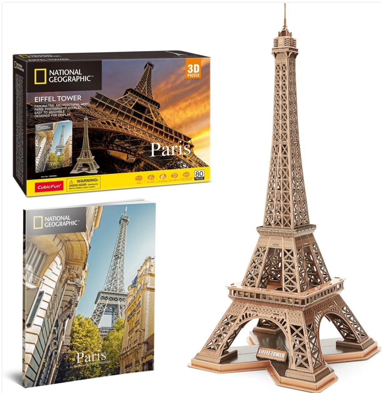
Image 3.2: The complete set including the puzzle box, the National Geographic booklet, and the fully assembled Eiffel Tower model.