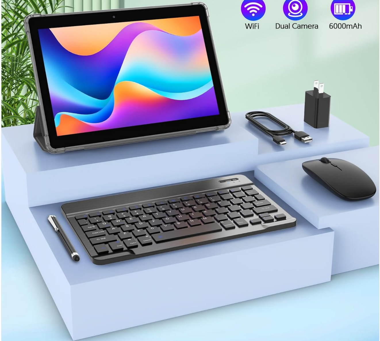
Image: The Fitifun M10 tablet shown with its charger, USB-C cable, keyboard, and mouse, highlighting its Android 13 OS, 10.1-inch display, 4GB RAM, 64GB ROM, Bluetooth 5.0, Wi-Fi, dual cameras, and 6000mAh battery.