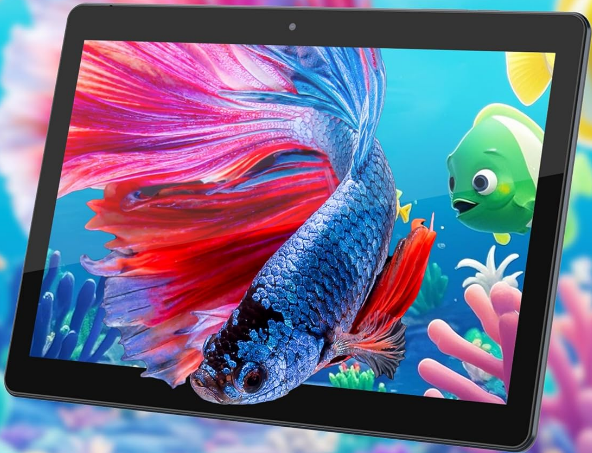
Image: The tablet's screen showcasing its 10.1-inch IPS HD display, 1280x800 FHD resolution, and 16:10 aspect ratio.