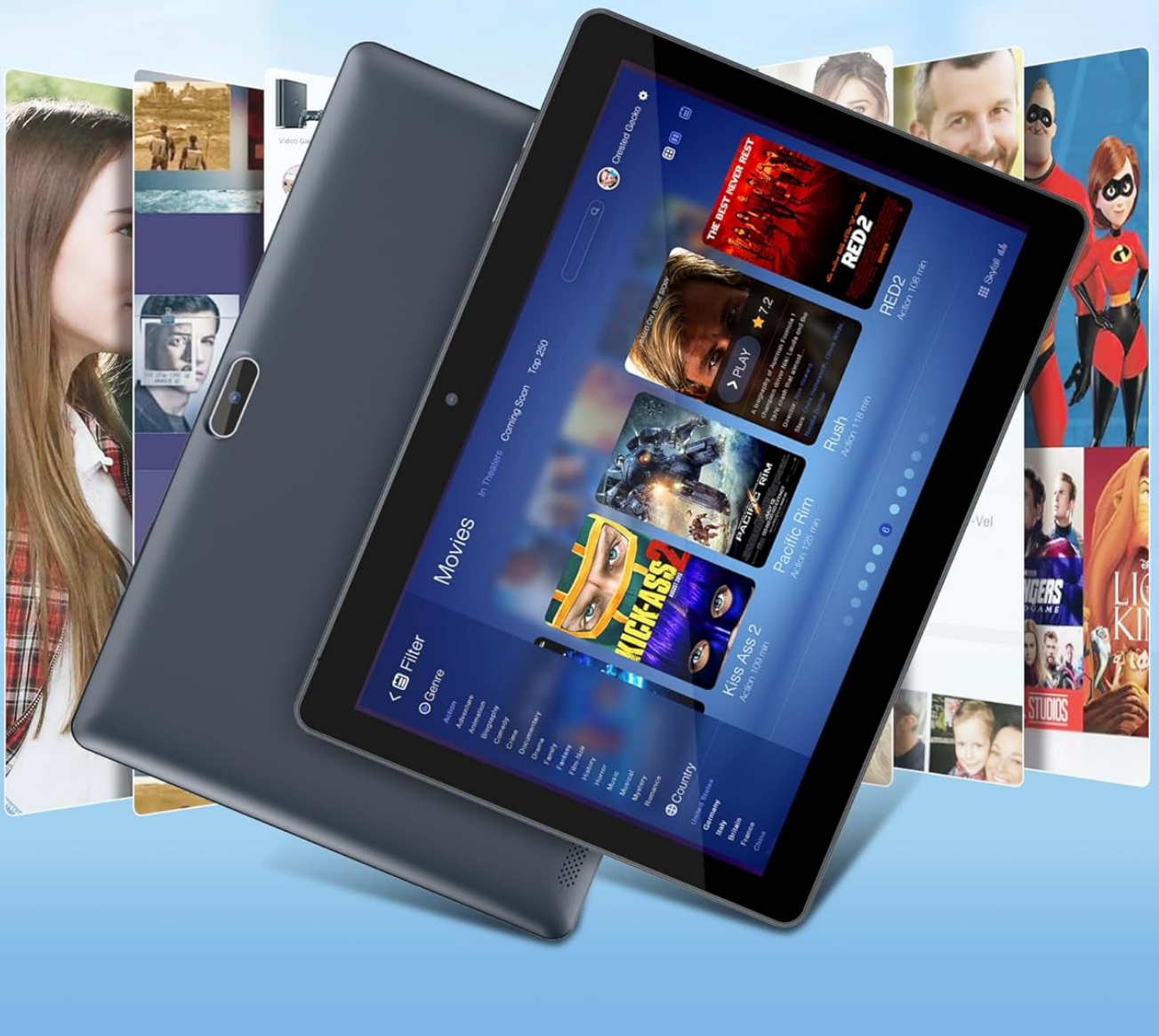
Image: The tablet's display showing its 4GB RAM, 64GB ROM, and the option for 1TB SD card expansion, with various media content displayed in the background.