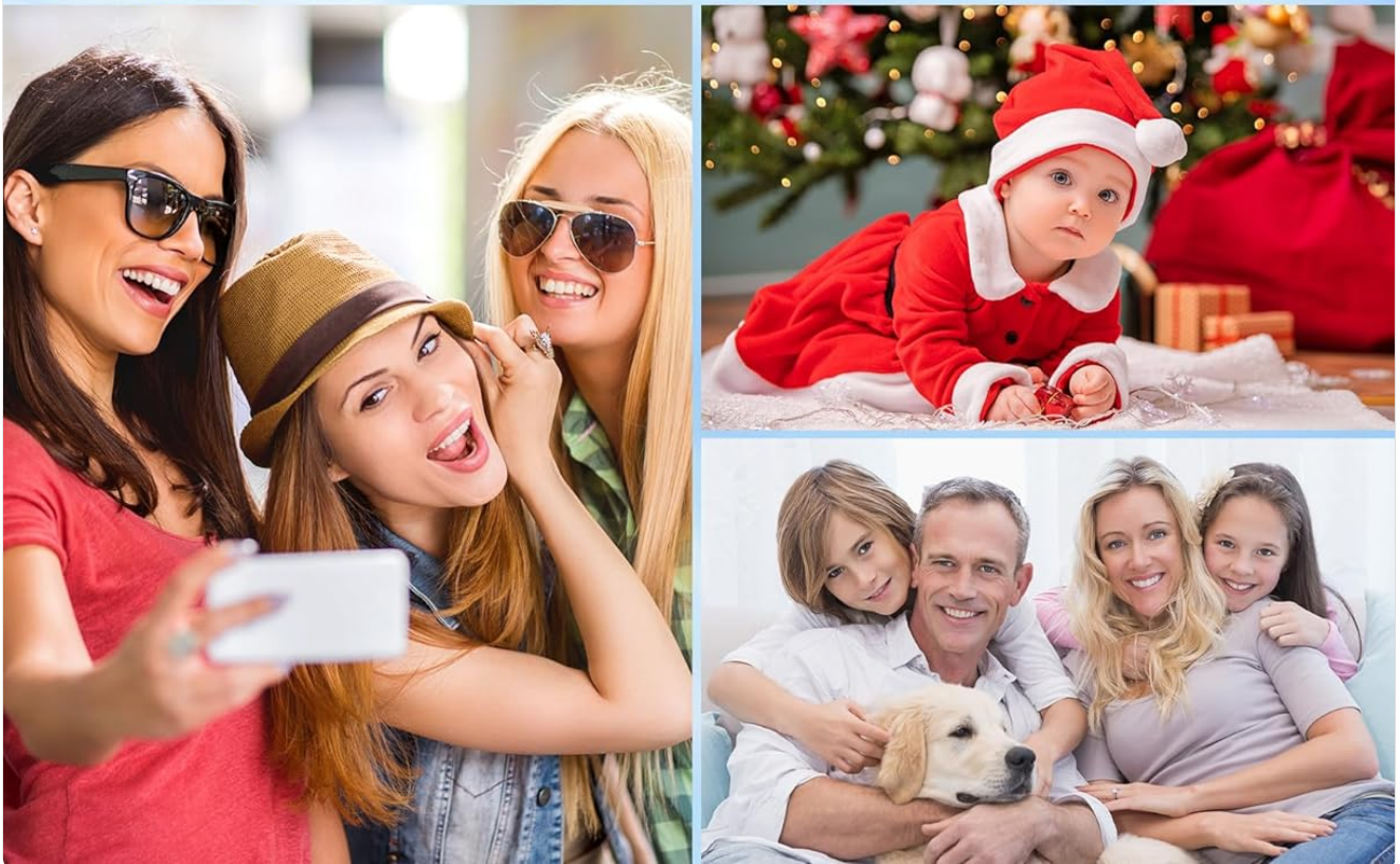
Image: Close-up view of the tablet's 2MP front and 8MP rear cameras, accompanied by example photographs demonstrating their capabilities.