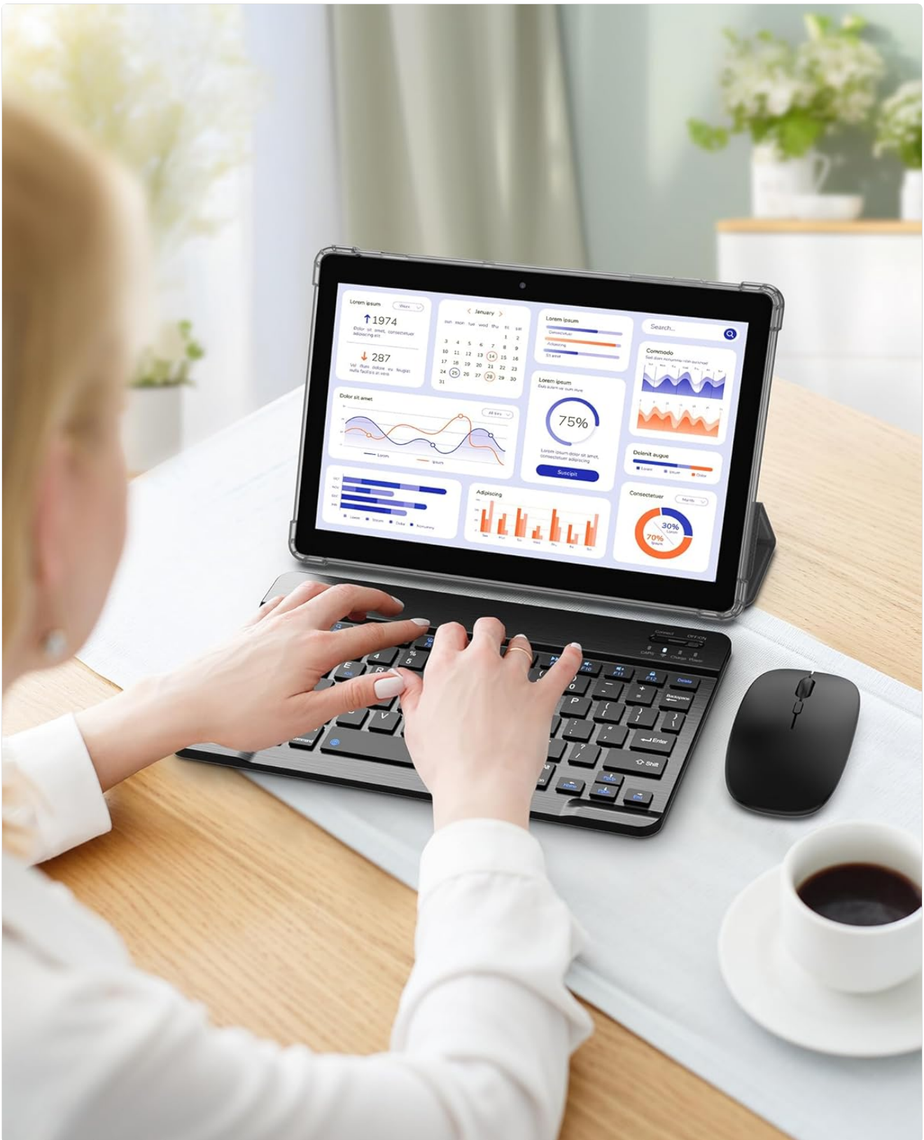
Image: A user interacting with the Fitifun M10 tablet, which is connected to an external Bluetooth keyboard and mouse, demonstrating its versatility for productivity tasks.