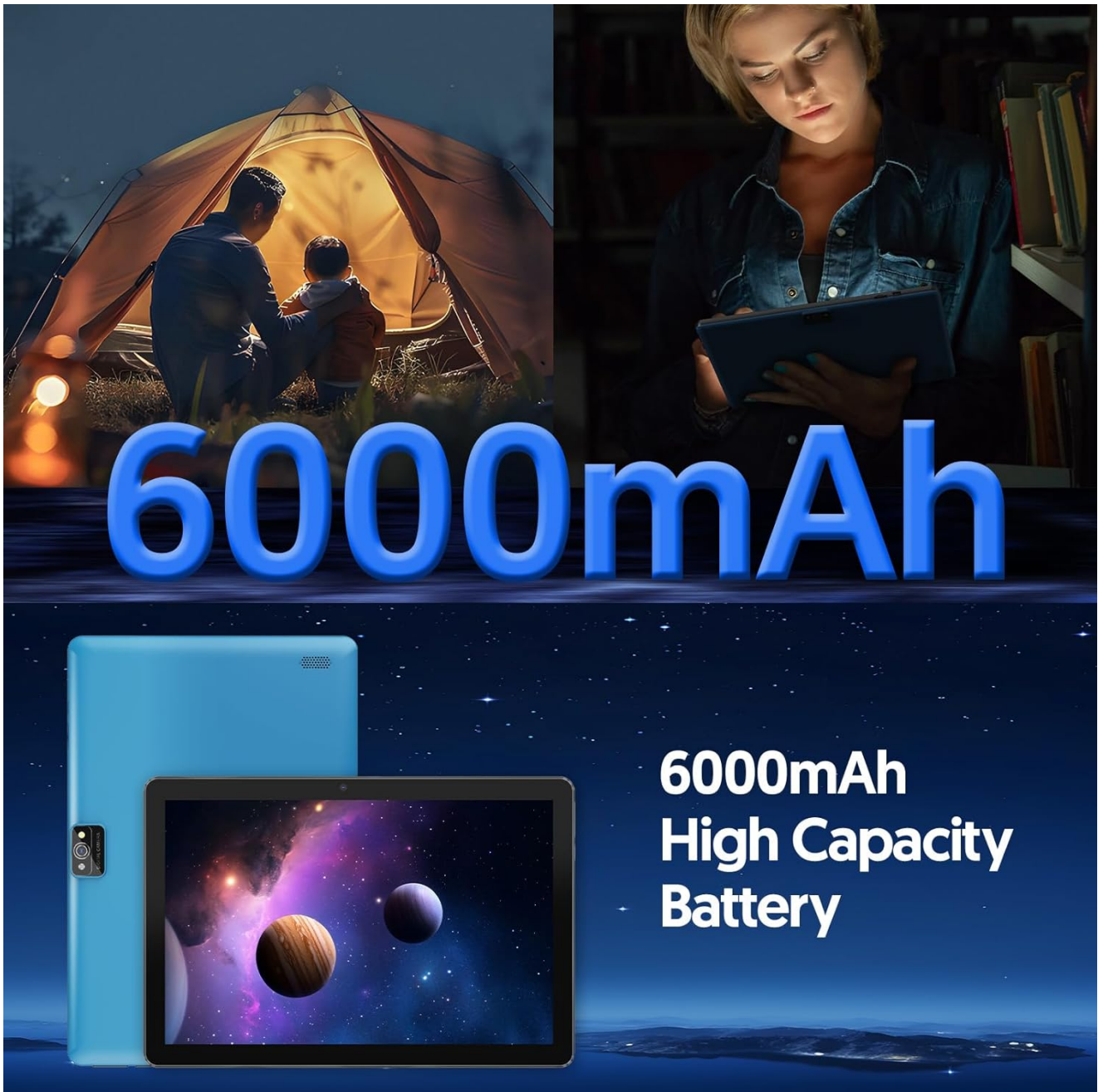
Image: The Fitifun M10 Tablet with a prominent display of its 6000mAh high-capacity battery, illustrating its long-lasting power.