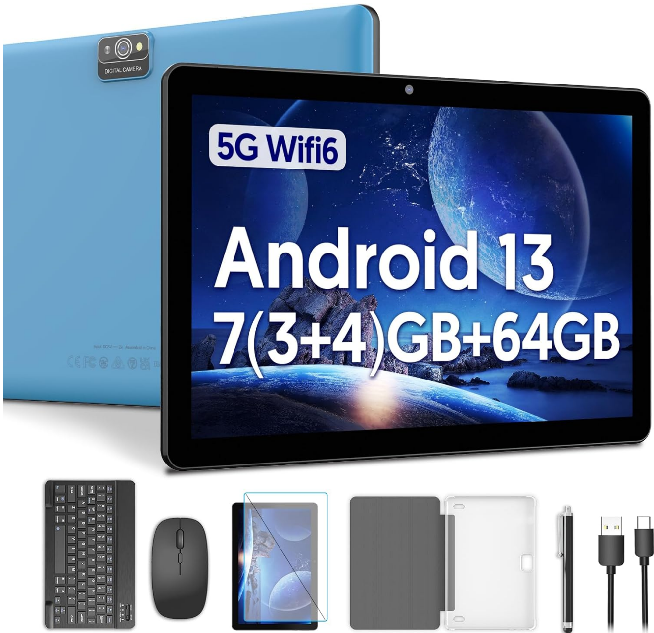
Image: The Fitifun M10 Android 13 Tablet displayed with its included accessories: a protective case, wireless keyboard, wireless mouse, stylus pen, and charging cable.