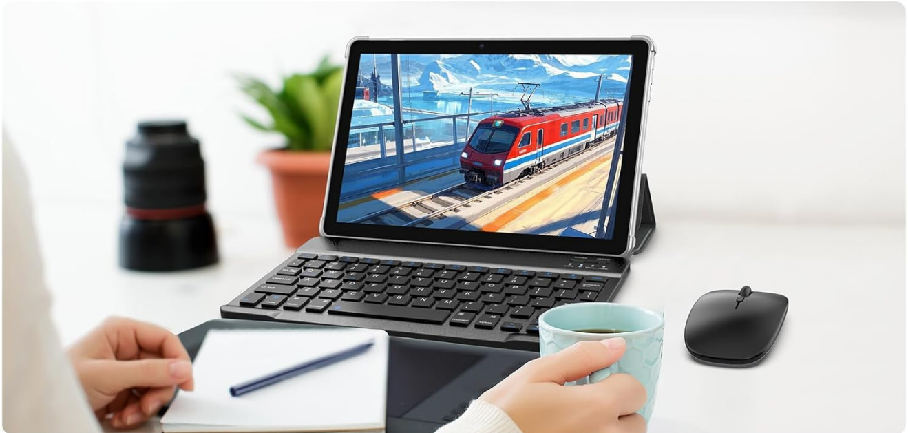
Image: The Fitifun M10 Tablet set up with its wireless keyboard and mouse, demonstrating a typical desktop-like usage scenario.