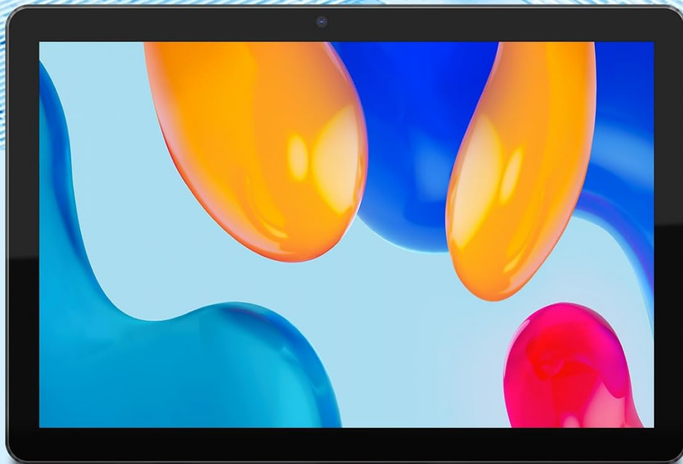
Image: A graphic illustrating the Fitifun M10 Tablet's storage capabilities, including 7GB RAM, 64GB ROM, and support for 1TB SD card expansion.