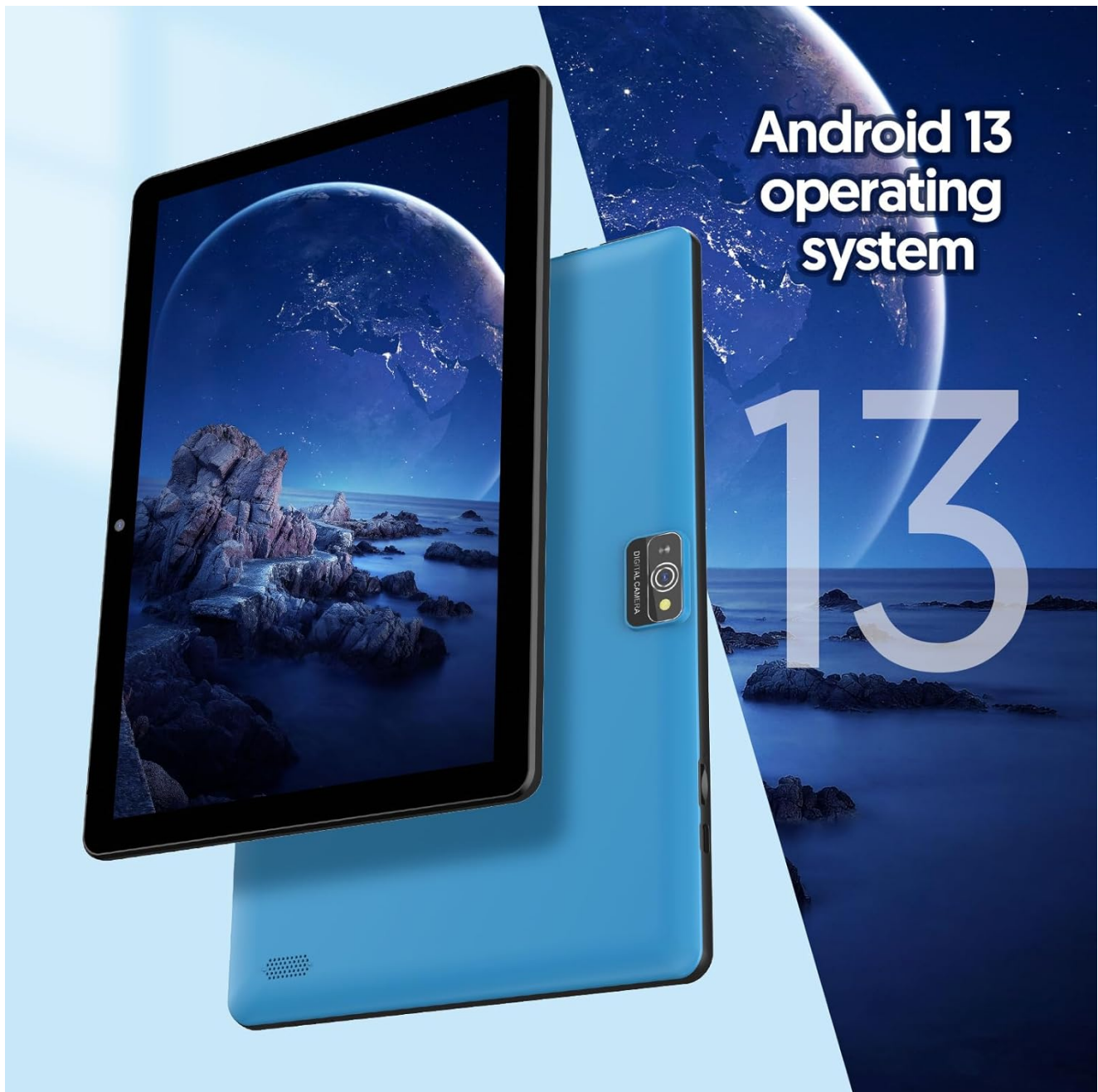
Image: The Fitifun M10 Tablet showcasing the Android 13 operating system interface on its screen.