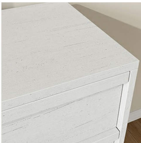
Figure 6: Detail of the dresser's tabletop surface, showing its texture and finish. Regular cleaning helps maintain its appearance.