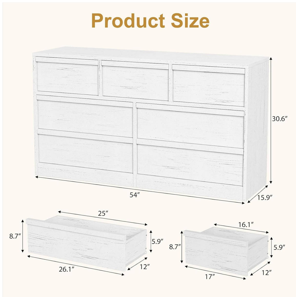
Figure 3: Product dimensions. The overall dresser measures 54 inches wide, 15.9 inches deep, and 30.6 inches high. Individual drawer dimensions are also detailed.