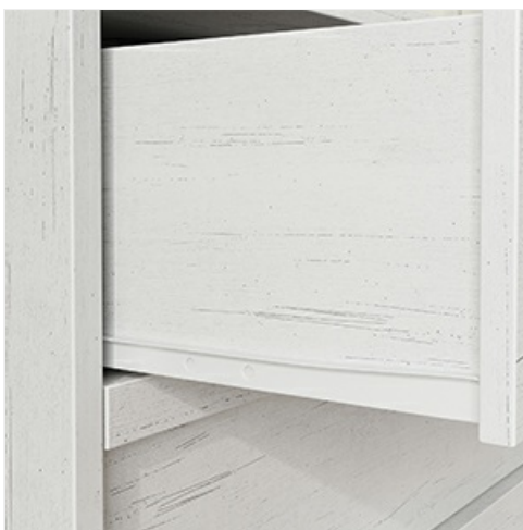
Figure 7: A close-up view of the smooth drawer glide, which should be kept free of debris for optimal function.