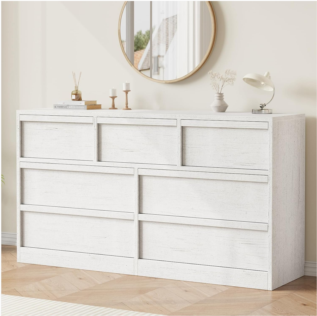
Figure 1: The GarveeHome 7-Drawer Dresser, showcasing its antique white finish and functional design. This dresser provides ample storage and a wide top surface for various items.