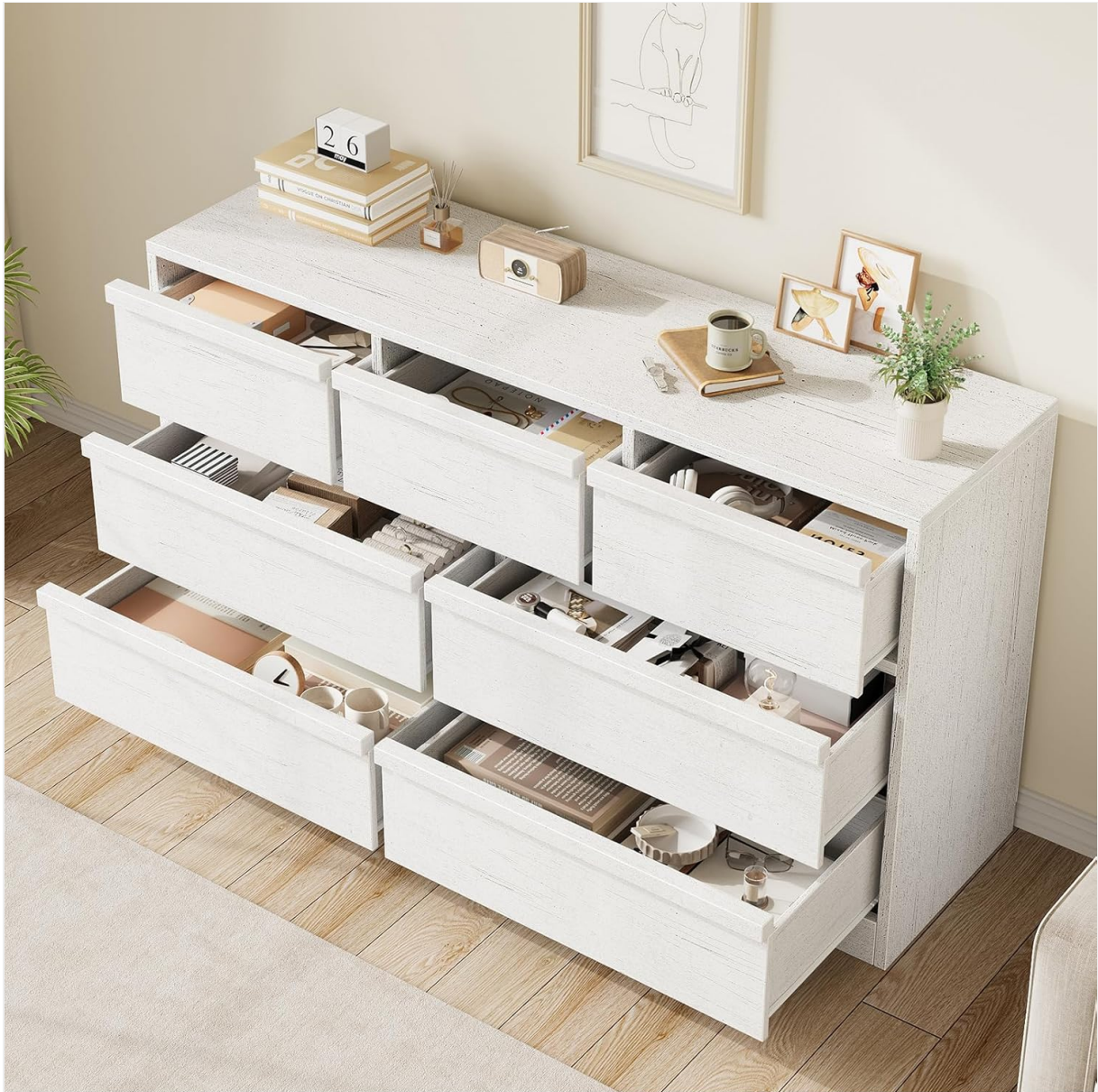
Figure 4: The dresser with drawers open, demonstrating the ample storage space available for various items.