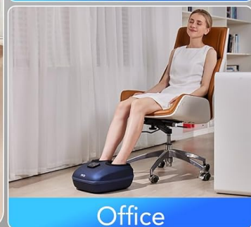
Image: The SKG Foot Massager YS100 shown in different environments such as an armchair, sofa, bedside, and office, highlighting its versatility for use anywhere.