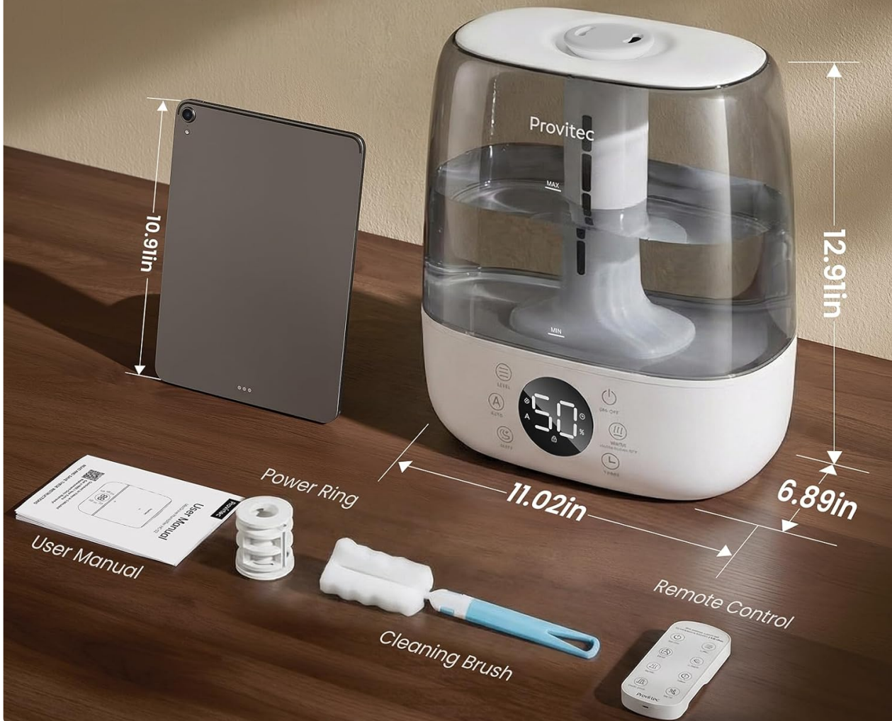
Image: The humidifier displayed with its dimensions and all included accessories: user manual, power ring, cleaning brush, and remote control.