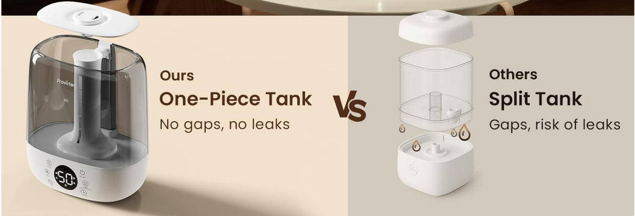
Image: The 6L integrated tank of the Provirtec MistGrove Humidifier being filled from the top, highlighting its no-leak design compared to split tanks.