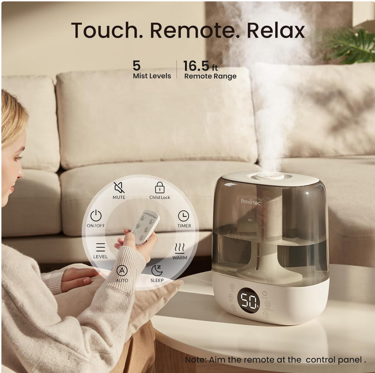
Image: User interacting with the touch panel and remote control of the Provirtec MistGrove Humidifier, showing various function buttons.

The humidifier features 360° dual mist outlets. Freely rotate and adjust the outlets to direct the mist in any desired direction for even coverage.