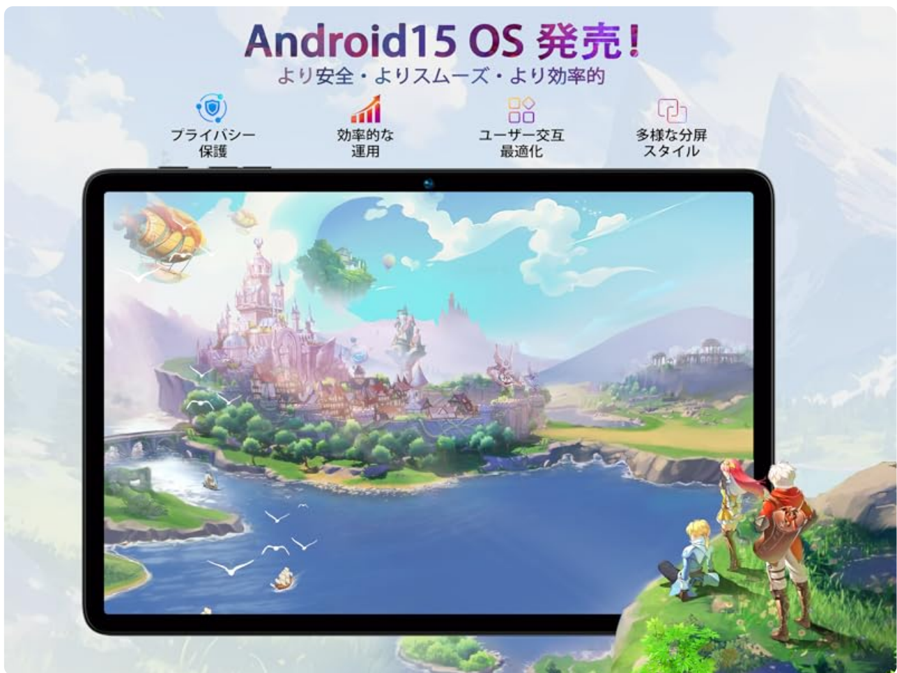
Figure 3.1: The Bmax I10 Plus tablet shown with its included accessories.