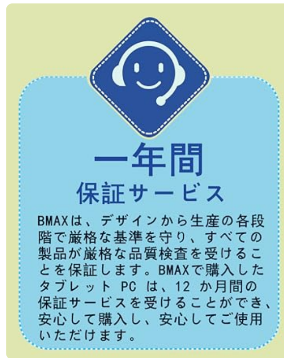
Figure 8.2: Information on how to contact customer support for assistance.