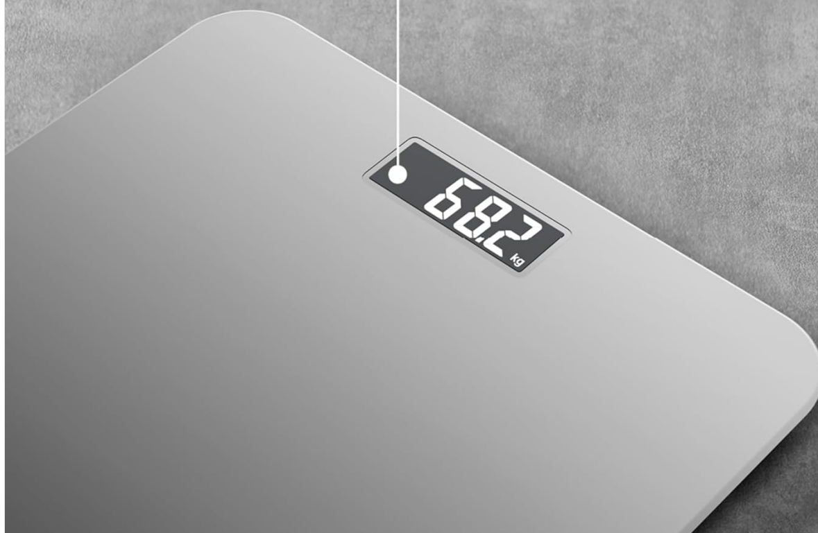
Image 1.2: A close-up view of the easy-to-read LCD display on the Rowenta Premiss 2.0 scale, showing a clear weight measurement.