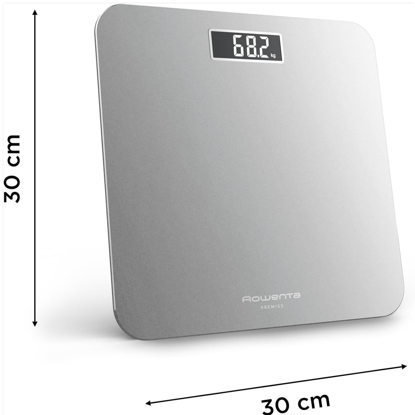
Image 6.1: A visual representation of the Rowenta Premiss 2.0 scale's dimensions, indicating its 30 cm by 30 cm platform size.