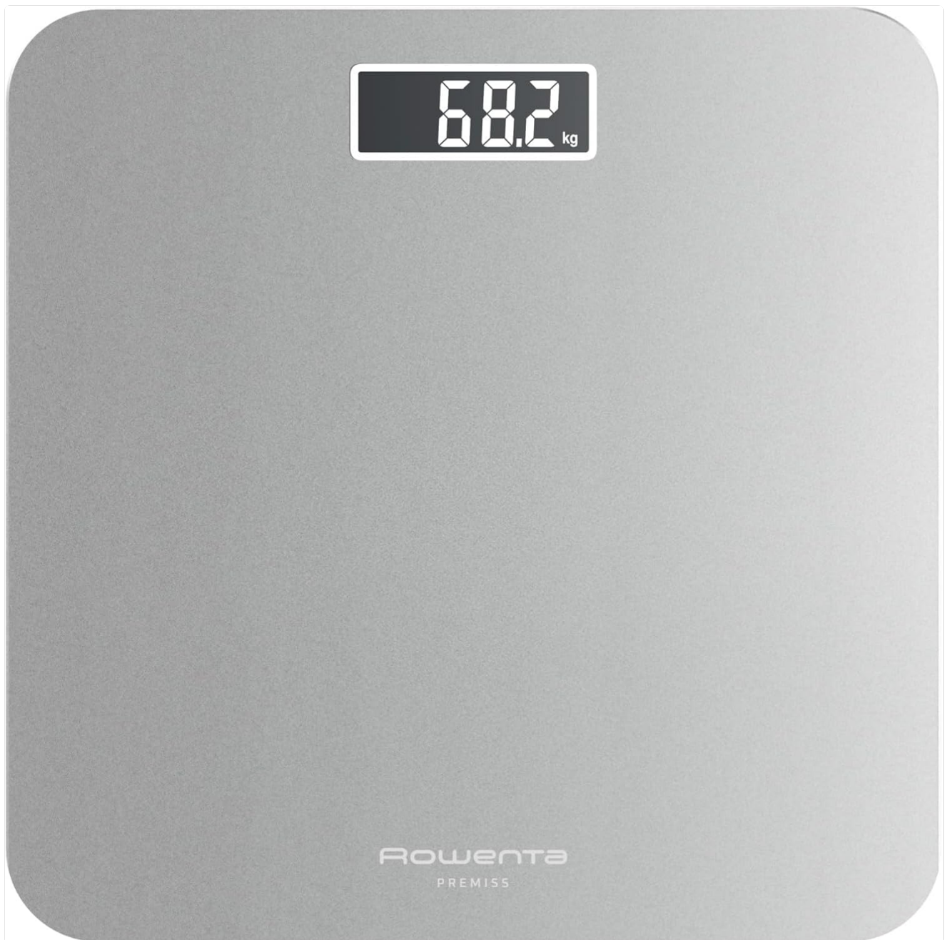
Image 1.1: The Rowenta Premiss 2.0 Digital Bathroom Scale displaying a weight of 68.2 kg. This image highlights the scale's sleek design and clear LCD screen.