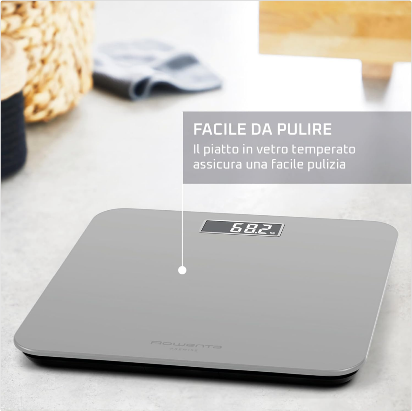
Image 4.1: The Rowenta Premiss 2.0 scale positioned in a bathroom setting, highlighting its smooth, tempered glass surface that is easy to clean and maintain.