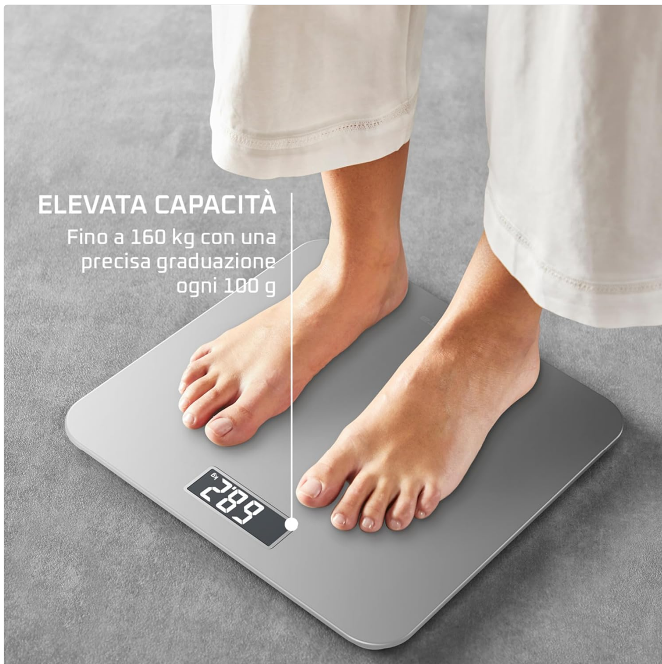
Image 3.1: A person standing on the Rowenta Premiss 2.0 scale, illustrating the process of taking a weight measurement. The image also highlights the scale's high capacity.