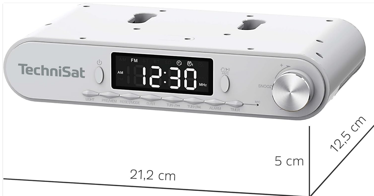
Image: A detailed view of the TechniSat Viola's front panel, showing the LED display, timer button, and the aluminum rotary knob for volume and selection.