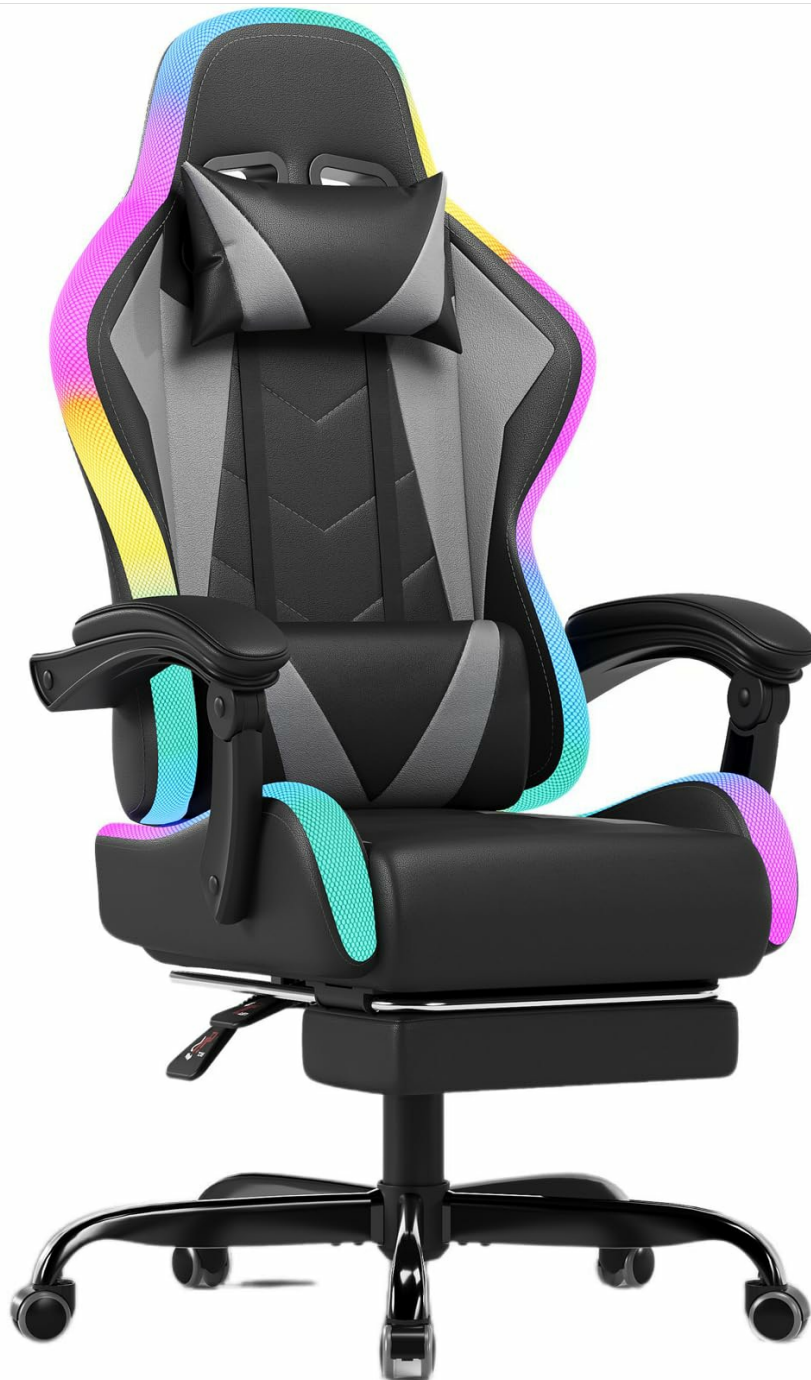
Image: The JUMMICO Gaming Chair with its integrated LED lighting, positioned within a modern gaming environment.