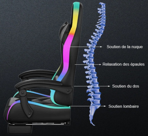
Image: An illustration highlighting the ergonomic design of the chair, showing support for the neck, shoulders, back, and lumbar region.

Favorise une bonne posture et la relaxation physique et mentale