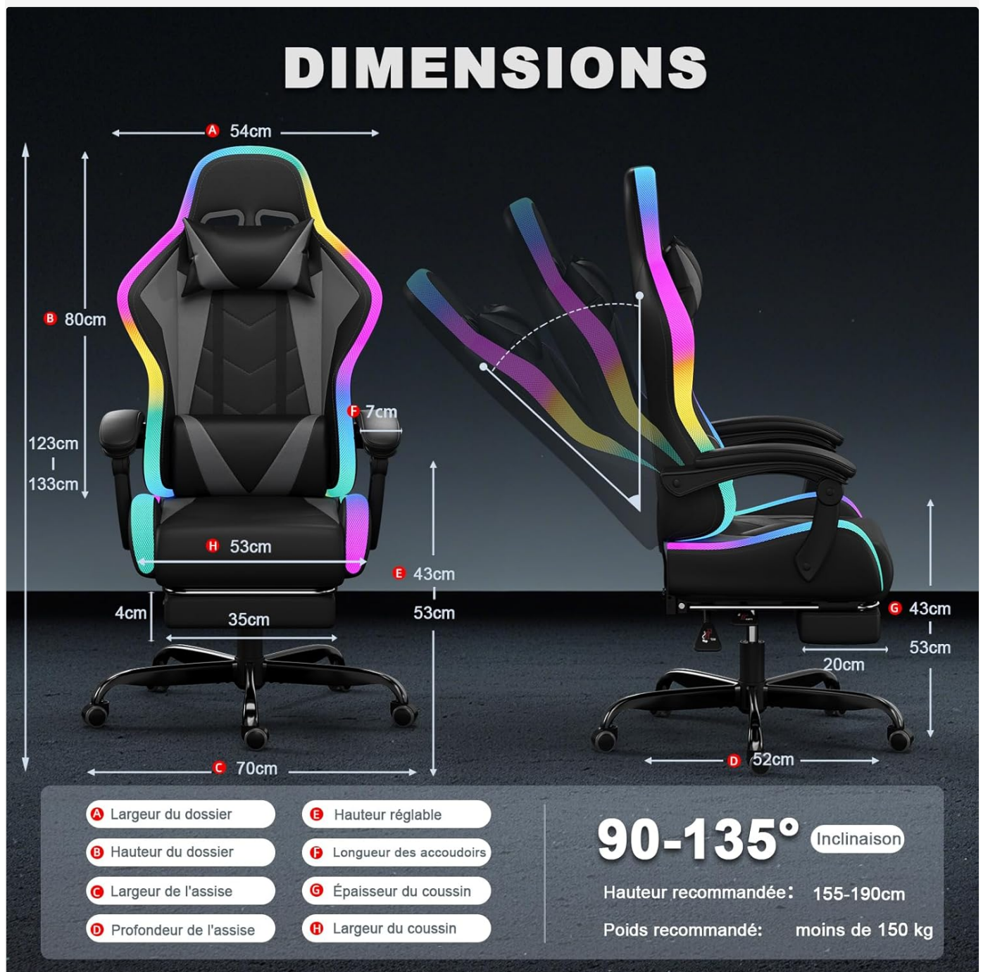
Image: A detailed diagram illustrating the various dimensions of the chair and its recline capability from 90 to 135 degrees.