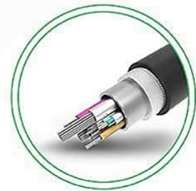
Figure 2.2: Reinforced design of the cable, highlighting its flexibility and durability against bending.