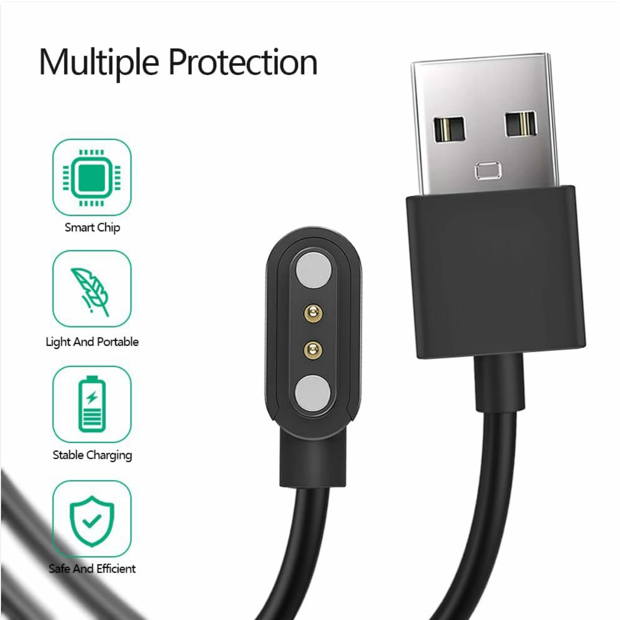
Figure 2.1: Multiple Protection features of the charging cable, including a smart chip for safe and efficient charging.