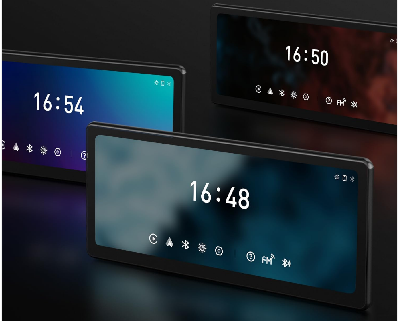
Figure 5.3: CarpodGo T3 Pro User Interface Examples.