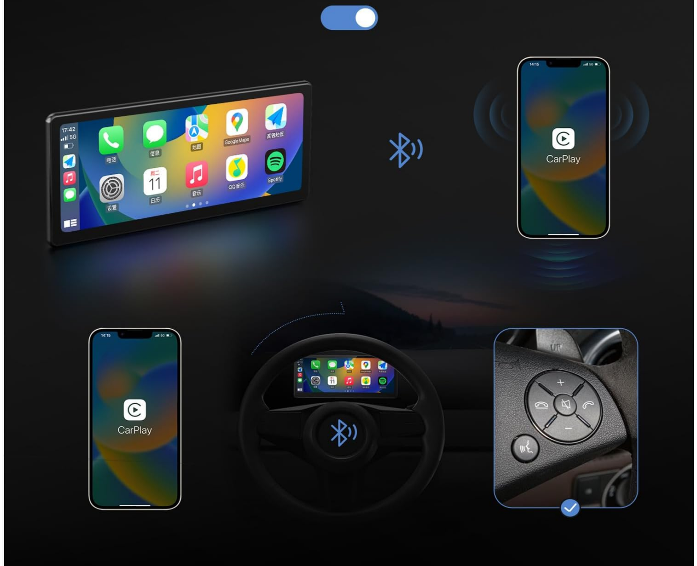
Figure 5.2: Display-Only Bluetooth Mode Configuration.