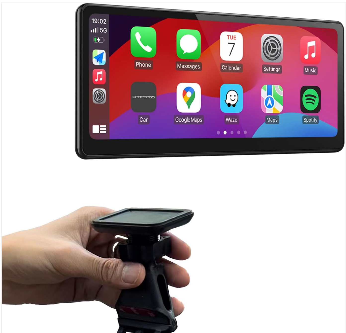
Figure 1.1: CarpodGo T3 Pro Portable Display with CarPlay Interface.