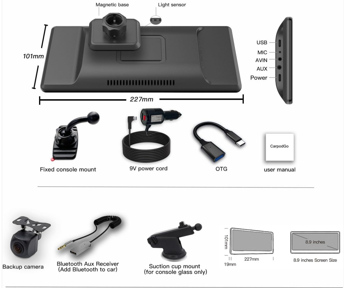
Figure 3.1: Package Contents of CarpodGo T3 Pro.