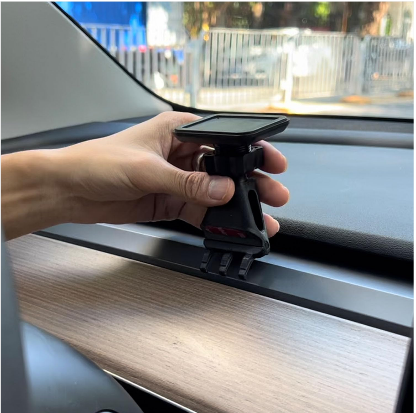
Figure 4.1: Magnetic Base and Mount.