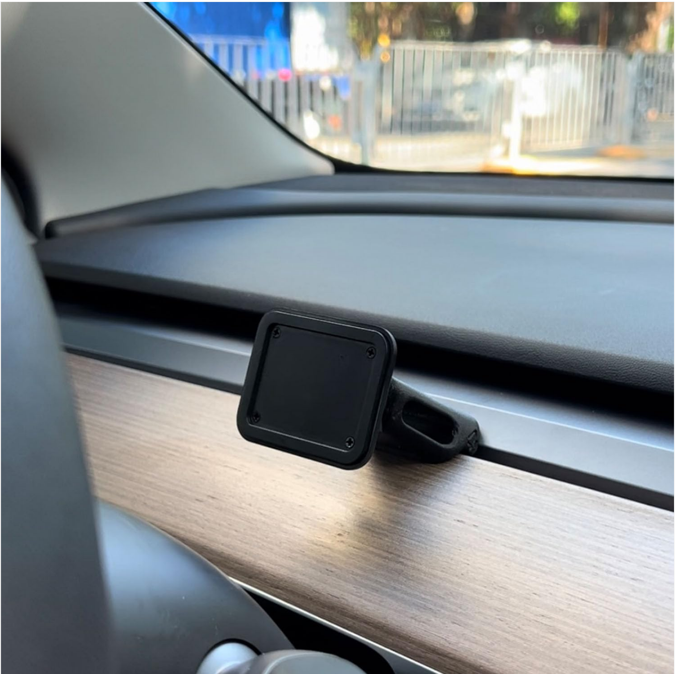
Figure 4.2: Magnetic Base Installed on Dashboard.