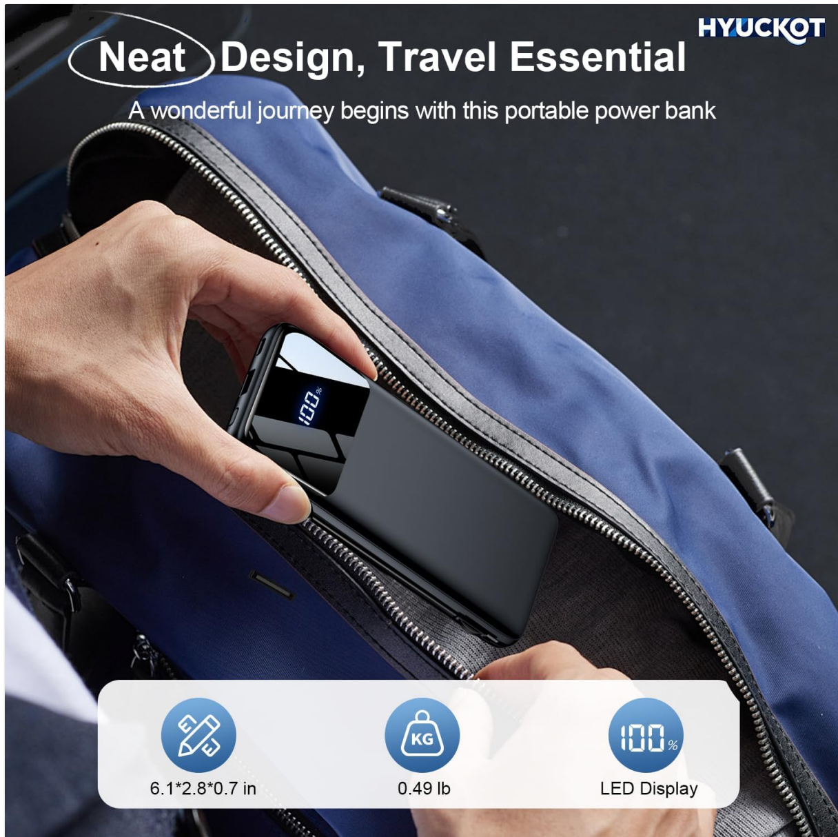
Figure 3: This image showcases the ultra-slim and lightweight design of the HYUCKOT K11 Portable Charger, illustrating how easily it fits into a bag, making it ideal for travel.

A wonderful journey begins with this portable power bank