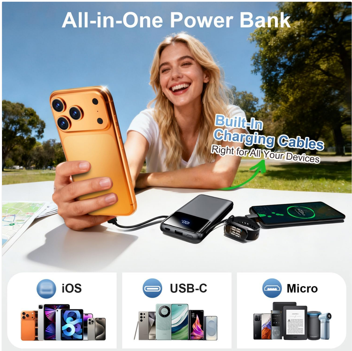
Figure 5: The HYUCKOT K11 Portable Charger's capability to charge up to four devices concurrently, including smartphones, smartwatches, and earbuds, using its various output options.