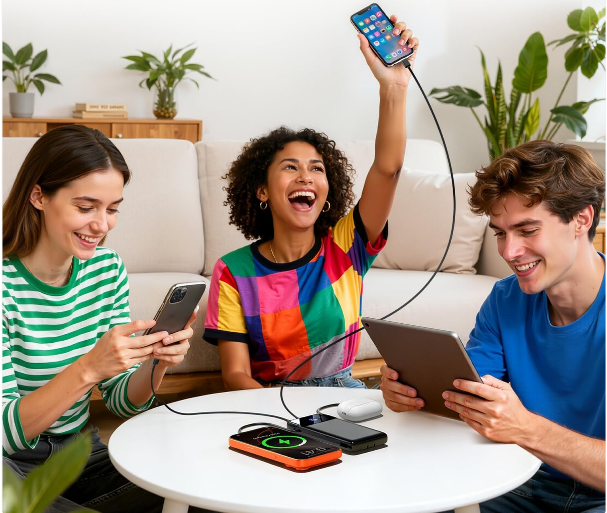
Figure 2: This image highlights the versatility of the HYUCKOT K11 Portable Charger, showcasing its integrated iOS, USB-C, and Micro-USB cables, designed to be compatible with a wide range of devices.