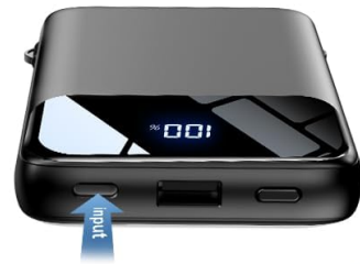
Figure 4: This image demonstrates the two convenient methods for recharging the HYUCKOT K11 Portable Charger: directly through its foldable AC wall plug or via the dedicated USB-C input port.